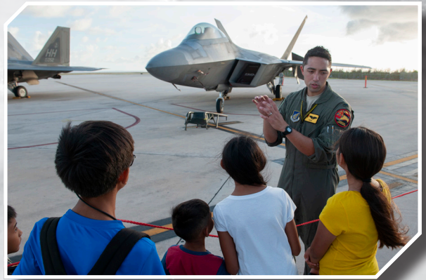
A 199th Fighter Squadron pilot from the Hawaii Air National Guard answers questions about the F-22 Raptor during a static display tour at the Francisco C. Ada International Airport, Saipan, April 23, 2019.