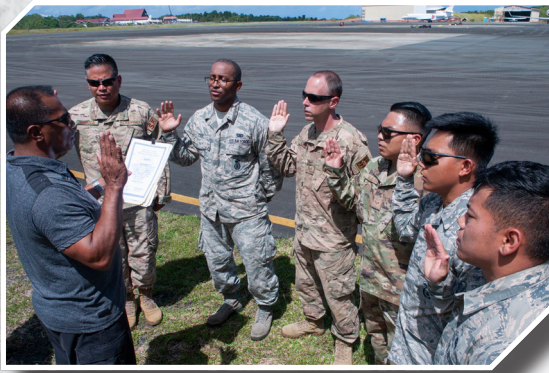
U.S. Air Force Security Forces Defenders from the 154th Security Forces Squadron are deputized by a local police chief April 25, 2019, at the Palau International Airport, Republic of Palau, authorizing them to protect valuable aircraft and assets during their stay.