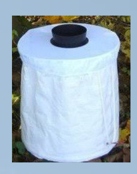
BG Sentinel Trap

Each mosquito trap's location is chosen based on a variety of factors including the population at risk and specific areas that attract mosquitos. Mosquito traps are harmless to humans and pets. Do NOT touch it! The placement and set up of the traps are very crucial. The photos above show examples of our traps which may be seen hanging from a tree or in a bucket on the ground. Mosquitos are attracted to the carbon dioxide (CO2) that humans and animals exhale. Therefore, Public Health uses dry ice (which releases CO2) as an attractant for the mosquitos which may appear to be "smoke" released from the traps.