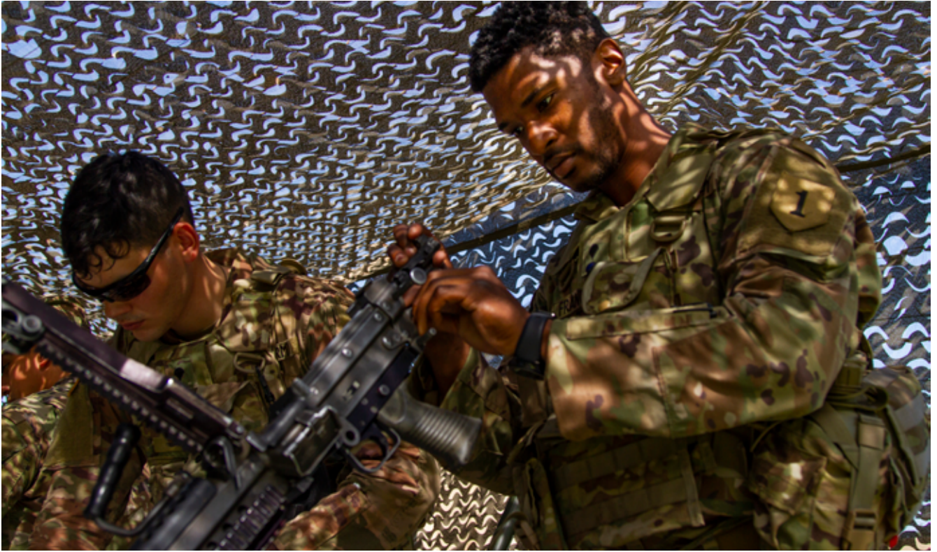
Military Intelligence Soldiers assemble an M249 during the 'Best Intel Competition' that took place in Zagan, Poland, June 12, 2019.