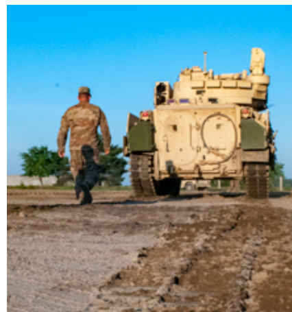
(bottom) A Soldier of Charlie Company, moves with a M3 Bradley that has just been unloaded to a staging area at Camp Karliki, Poland.