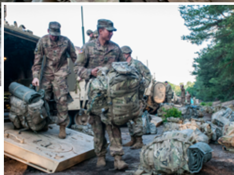
(top) Soldiers of Charlie Company, backup a M3 Bradley that has just been unloaded to a staging area at Camp Karliki, Poland