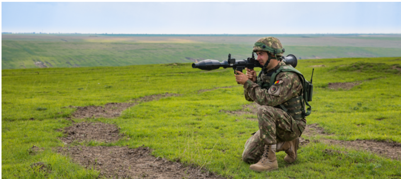
A Romanian soldier with the 631st Tank Battalion aims a simulated rocket launcher at the opposition force during a force on force exercise as part of Justice Eagle on a range near Smardan Training Area, Romania