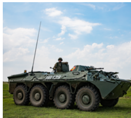
(right) A Romanian soldier with the 631st Tank Battalion mounted in a TAB-77 personnel carrier surveys the area during a force on force exercise as part of Justice Eagle