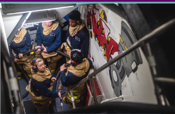
Sailors participate in a drill during General Quarters.