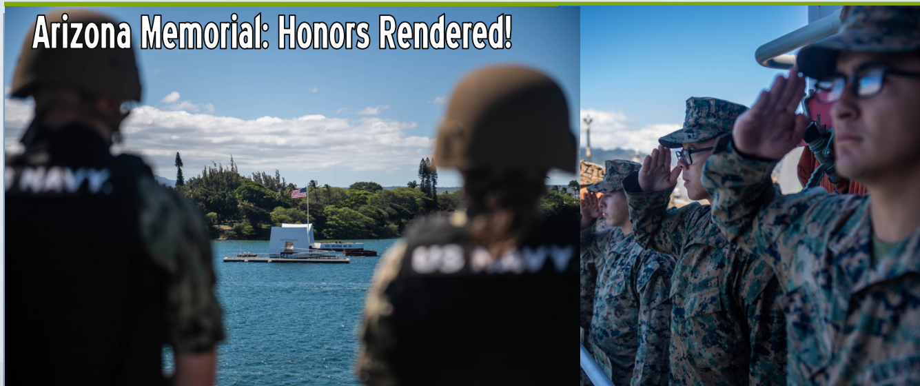
Sailors and Marines render honors as the ship transits past the USS Arizona Memorial after a port visit in Hawaii.