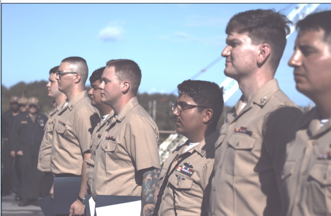
Some 42 Sailors who passed the March 2019, Cycle 243 of the Navy Wide Advancement Examination are pinned during a frocking ceremony on the flight deck aboard dock landing ship USS Harpers Ferry (LSD 49).