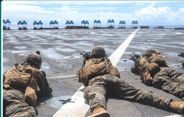
Embarked Marines conduct a gun shoot on the flight deck.