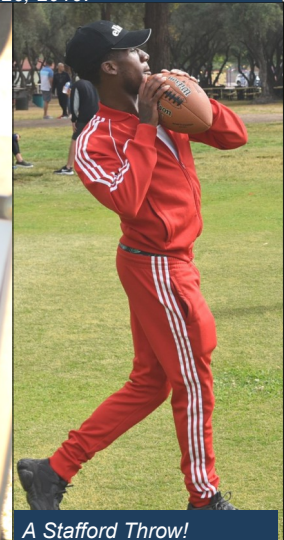
A Stafford Throw!