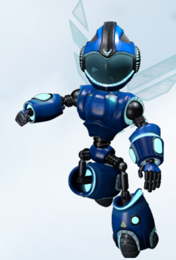
•••••• Train, Develop and Inspire Warriors: Combat Capability Starts Here