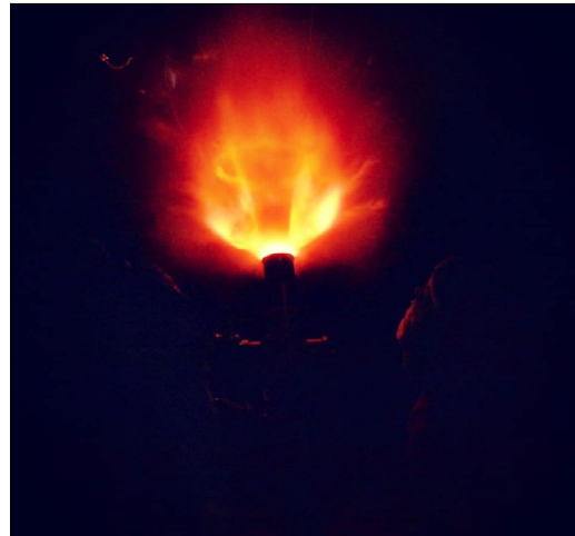
Soldiers from 2nd Brigade Combat Team use mortars and AT4s during a training exercise in The Republic of North Macedonia.