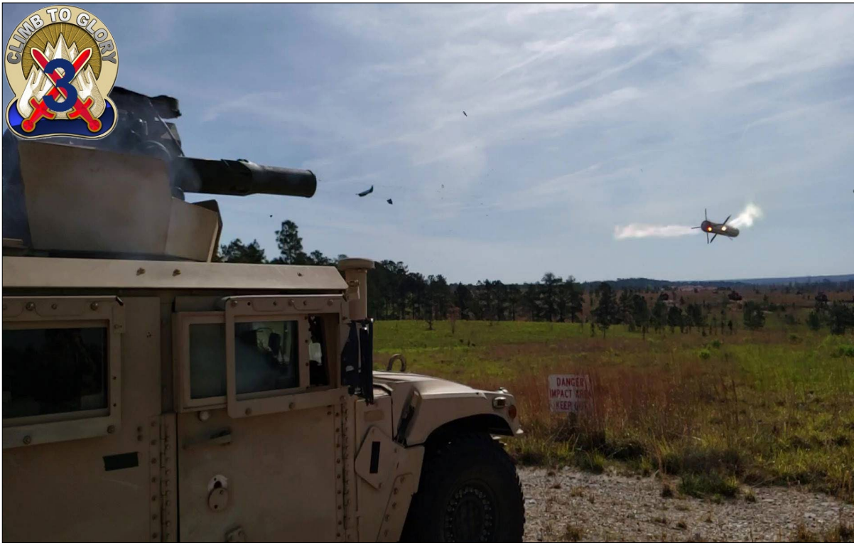
Soldiers from 3rd Brigade Combat Team fire a TOW missile during a live-fire training exercise.