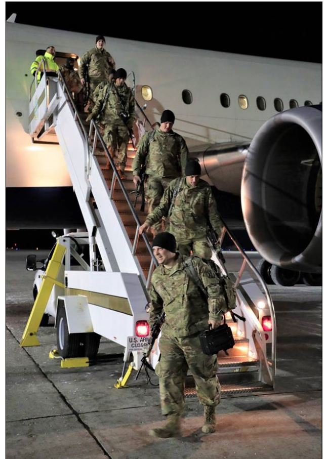
More than 100 1st Brigade Combat Team Soldiers arrived at Fort Drum's Wheeler-Sack Army Airfield in the final return flight from the Joint Readiness Training Center in Fort Polk, Louisiana.