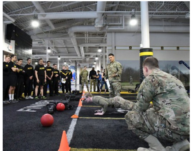
1st Brigade Combat Team Soldiers were pulling weighted sleds, running with kettlebells and doing deadlifts at Atkins Functional Fitness Facility to prepare for the upcoming change to the Army Physical Fitness Test. The Army Combat Fitness Test is due to replace the APFT by October 2020.