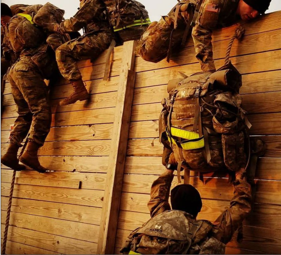
1st Brigade Combat Team Soldiers climb over a high wall on Fort Drum during tactical physical training.