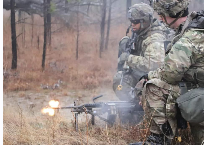
Soldiers assigned to 1-87IN, 1BCT, 10MTNDIV conduct battle training, February 20, 2019, during JRTC rotation 19-04.