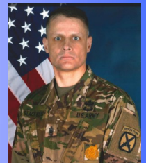
CSM Blackwell Centaur 7