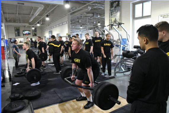
Soldiers pulled weighted sleds, ran with kettlebells and cranked out deadlifts at the gym one recent frosty morning at Fort Drum in preparation for the Army Combat Fitness Test, Feb 29, 2019.

Story by Mike Strasser 10th Mountain Division Public Affairs