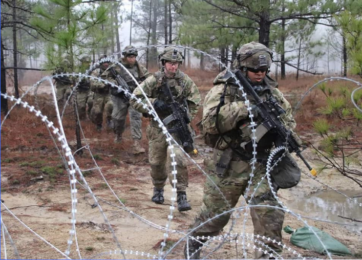
Soldiers assigned to 1-87IN breach through concertina wire, February 20, 2019, during JRTC rotation 19-04.