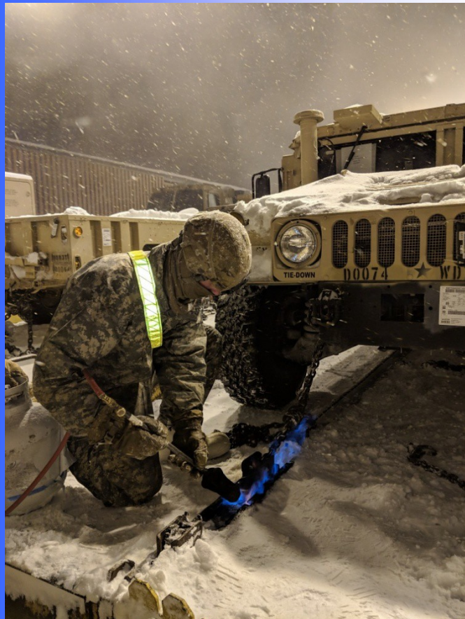
A Soldier from 1BCT uses a torch to melt the ice build up on a chain that connects the vehicle to the railhead car, Jan 28, 2019.

The 1st Brigade Combat Team, 10th Mountain Division, launched their Rail Load Operations in preparation for their deployment to the Joint Readiness Training Center in Fort Polk, Louisiana, Jan. 22. Weather conditions played a major role throughout the mission. The unit fought through a historic polar vortex where wind chills reached -30 degrees, intermittent white-out conditions affected visibility, and constant ice made roads treacherous.