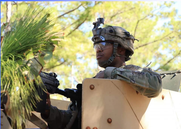
A Soldier assigned to 2-22 IN, pulls security with his M249 Squad Automatic Weapon from the gunner's hatch of a High Mobility Multipurpose Wheeled Vehicle (HMMWV), February 13, 2019, during JRTC rotation 19-04 .