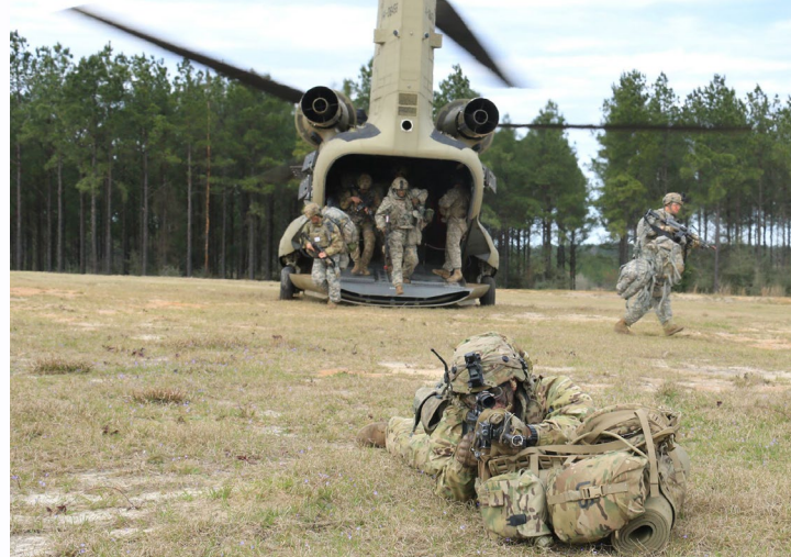
A Soldier assigned to 1BCT pulls guard after exiting an Boeing CH-47 Chinook helicopter during an air assault February 18, 2019 during rotation 19-04 at JRTC.