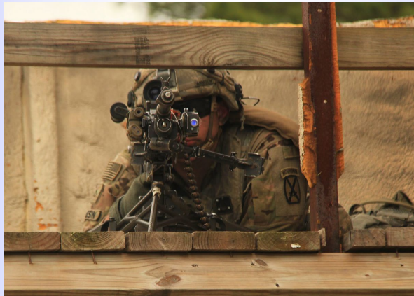
A Soldier assigned to 1-32IN secures the "village of Batoor" with his M240B Light Machine Gun, February 11, 2019 during rotation 19-04 at JRTC.