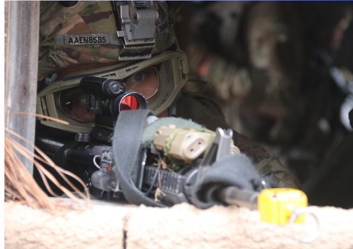
A Soldier assigned to 2-22IN secures the "village of Marjani" with his M4 Carbine, February 10, 2019 during JRTC rotation 19-04 .