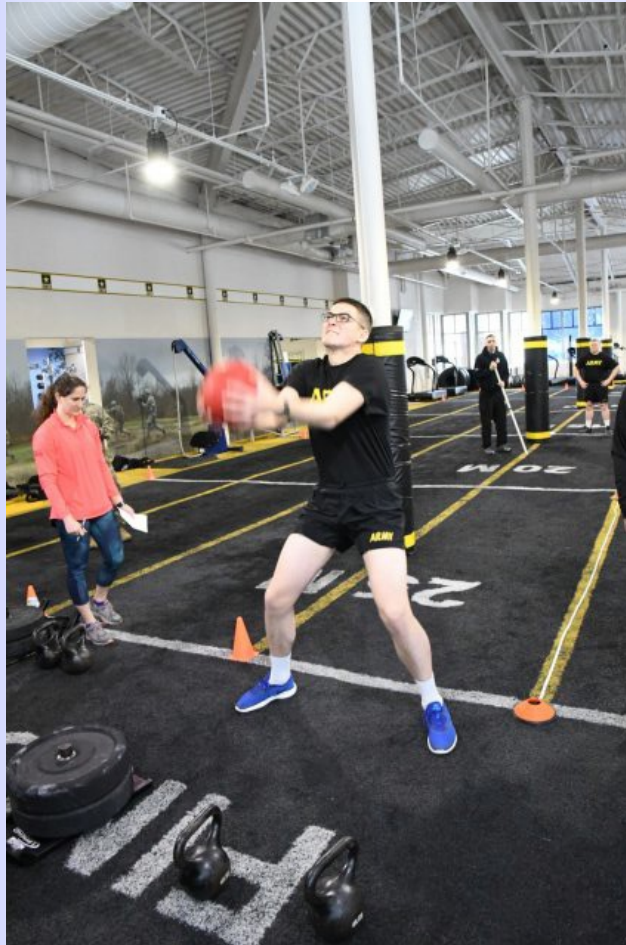
A Soldier attempts the standing power throw, an event in the new Army Combat Fitness Test due to roll out in 2020, Feb 29, 2019.

To learn more about the ACFT, visit https://www.army.mil/acft/ .