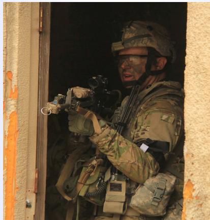
A Soldier assigned to 1-32IN secures the "village of Batoor," February 11, 2019 during JRTC rotation 19-04 .