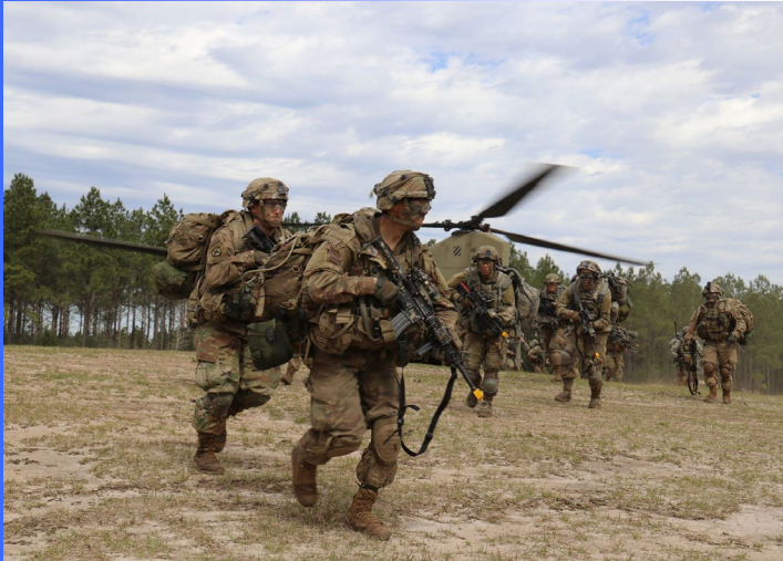
Soldiers assigned to 1BCT exit a Boeing CH-47 Chinook helicopter during an air assault February 18, 2019 during JRTC rotation 19-04 .