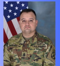
CSM Sanchez Ghost 7