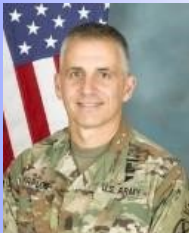
CSM Farlow Courage 7