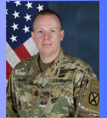
CSM Palmer Hammer 7