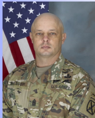
CSM Weaver Chosin 7