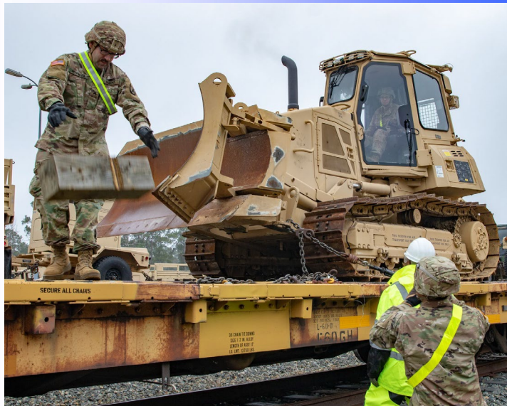
Sgt. Melendez removes a wooden block from a rail car during the 1BCT, 10MTNDIV training rotation at the Joint Readiness Training Center, Fort Polk, Feb 1, 2019.