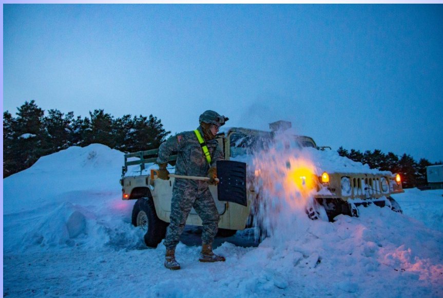
A 1BCT Soldier digs his vehicle out of the snow after a blizzard hit Fort Drum, New York, Jan 28, 2019.