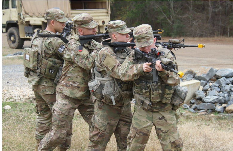
Soldiers assigned to 1-87IN rehearse at FOB Black Jack, February 4, 2019 during JRTC rotation 19-04.