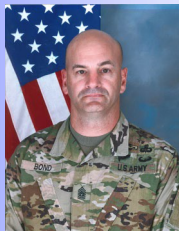
CSM Bond Summit 7