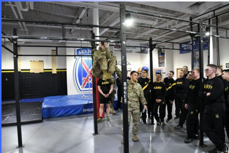
Soldiers learn the leg tuck event for the new Army Combat Fitness Test due to roll out in 2020, Feb 29, 2019.

Adequate - but not excessive - hydration is also key for performing well on physical competitions such as the ACFT. A Soldier can typically expect to see a decrease in performance with as little as two to three percent of their body weight loss from sweat.