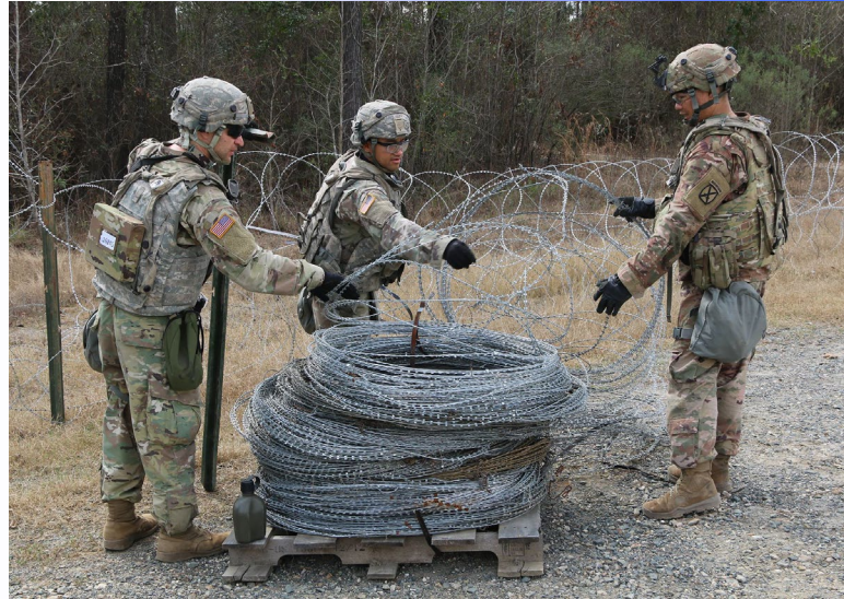
Soldiers assigned to 10th BSB, 1st Brigade Combat Team, 10th Mountain Division (LI) prepare to string concertina, February 7, 2019 during rotation 19-04 at JRTC.