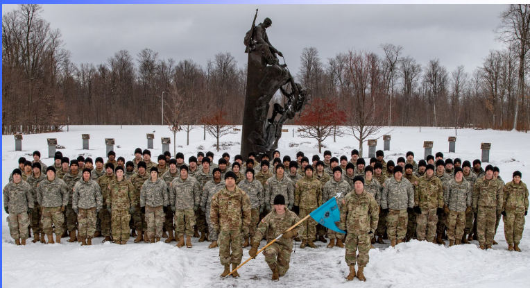
Delta Company stands proud in front of the 10th Mountain Division's Military Mountaineer Statue at Fort Drum's Memorial Park. The company won FORSCOM's 2019 MG Dillard Award for the best Military Intelligence Company in a Brigade Combat Team.