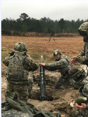
3-71CAV Mortars conduct live fire operations during JRTC rotation 19-04 at Fort Polk, LA, Feb. 23, 2019.