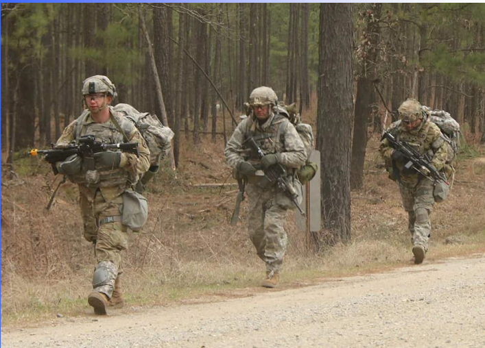
Soldiers assigned to 1-32IN on patrol, February 9, 2019 during JRTC rotation 19-04.