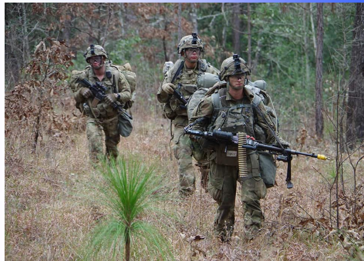
Soldiers assigned to 2-22 IN, patrol "Atropia," February 16, 2019, during rotation 19-04 at JRTC.