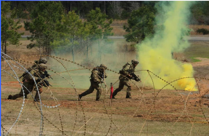
Soldiers assigned to 1-32IN, 1BCT, 10MTNDIV conduct battle training, February 20, 2019, during rotation 19-04 at JRTC.