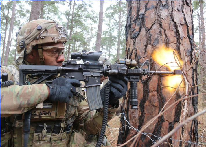
A Soldier with 1BCT fires on enemy combatants with his M4 Carbine during JRTC rotation 19-04 at Fort Polk, LA, Feb. 23, 2019.