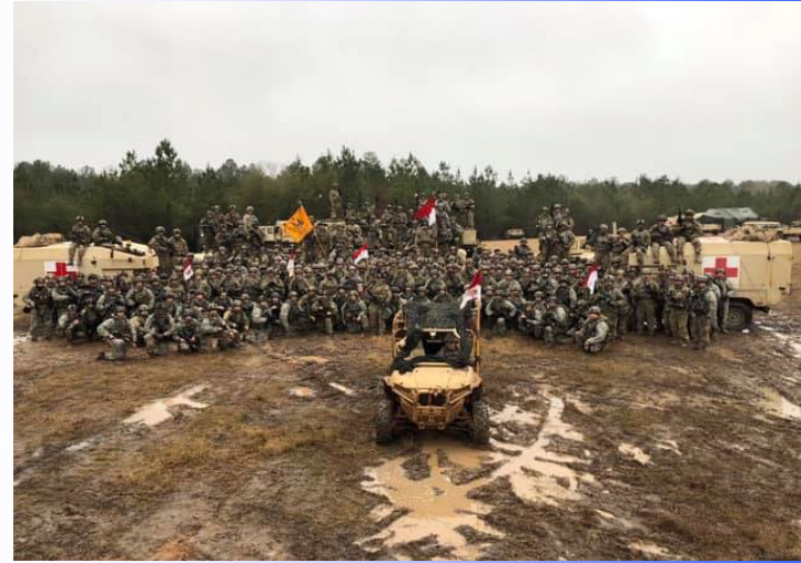
Our 3-71CAV, 1st Brigade Combat Team, 10th Mountain Division Soldiers assemble after a successful JRTC rotation 19-04. The Army's new tech vehicle, the Squad Multipurpose Equipment Transport (SMET) is in foreground.