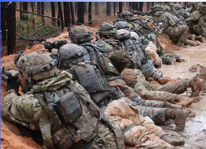
Soldiers assigned to 1-87IN, 1BCT, 10MTNDIV prepare to assault over a berm, February 20, 2019, during rotation 19-04 at JRTC.