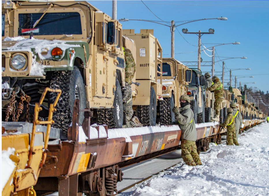
Soldiers from 1BCT conduct rail load operations at the Fort Drum rail yard to prepare for deployment to the Joint Readiness Training Center at Fort Polk, La, Jan 26, 2019.

They will return to Fort Drum — and presumably more north country winter — later this month.