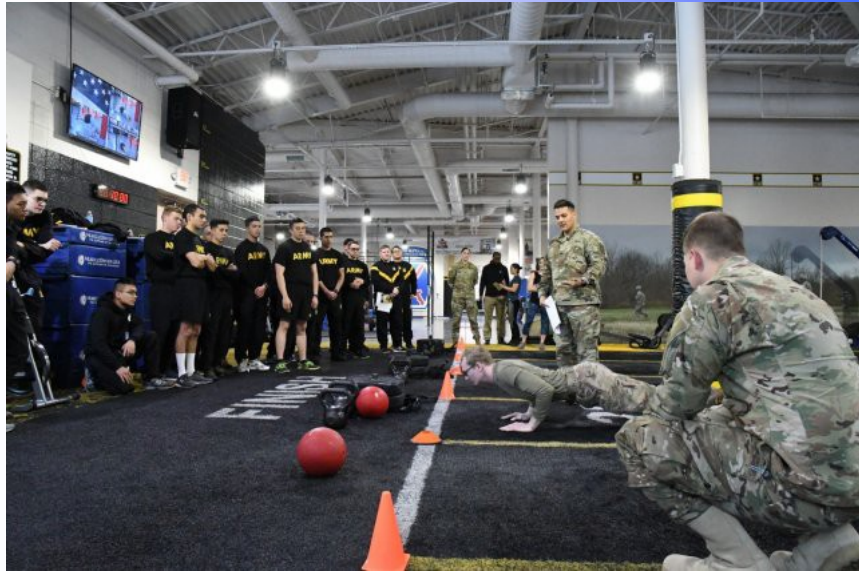
A Soldier demonstrates the new style of push-ups required for the Army Combat Fitness Test due to roll out in 2020, Feb 28, 2019.

"We have found that the Soldiers - regardless of rank and time in service - who have a higher fitness level and positive attitude toward the new test are thriving with the new standards," she said. "The Soldiers who have lower fitness levels and negative attitudes toward the test are more resistant to the change."