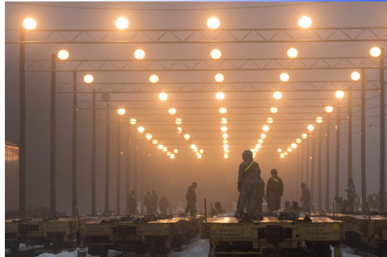
Soldiers from the 1st Brigade Combat Team work on securing equipment to the railhead in preparation for transport to Fort Polk, Louisiana, Jan 28, 2019.

In addition to the rail yard portion of the movement, there is also another aspect to the deployment to a training area: the line haul. Most of the line-haul portion of the operation is taken care of by civilians who drive military equipment to their destination. Since there was a state of emergency called for the county Fort Drum is located on, most of the trucks tasked to haul the equipment couldn’t make it in until after the emergency was lifted. On top of the state of emergency, the amount of snow made it difficult to move equipment and load it once the trucks were able to move. The cold days of preparing equipment for transportation is behind them, and 1 BCT can concentrate on perfecting their profession through the rigorous training at JRTC.