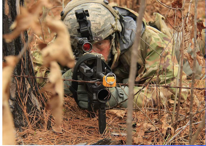
A Soldier assigned to 1-32IN keeps a watchful eye while holding security with his M4 Carbine, February 9, 2019 during JRTC rotation 19-04.