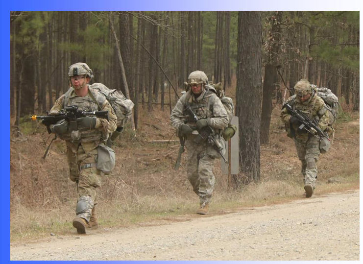
Soldiers assigned to 1-32IN on patrol, February 9, 2019 during JRTC rotation 19-04.