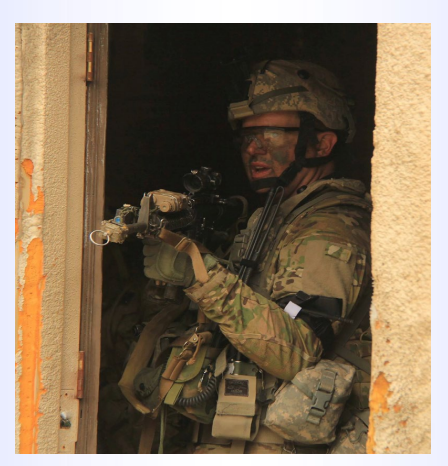
A Soldier assigned to 1-32IN secures the "village of Batoor," February 11, 2019 during JRTC rotation 19-04 .