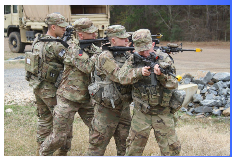
Soldiers assigned to 1-87IN rehearse at FOB Black Jack, February 4, 2019 during JRTC rotation 19-04.