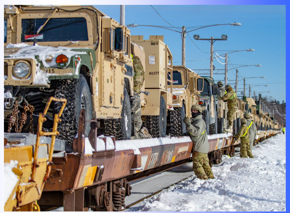
Soldiers from 1BCT conduct rail load operations at the Fort Drum rail yard to prepare for deployment to the Joint Readiness Training Center at Fort Polk, La, Jan 26, 2019.

"When the trains are under three feet of snow and on the tracks, it's just time-consuming."