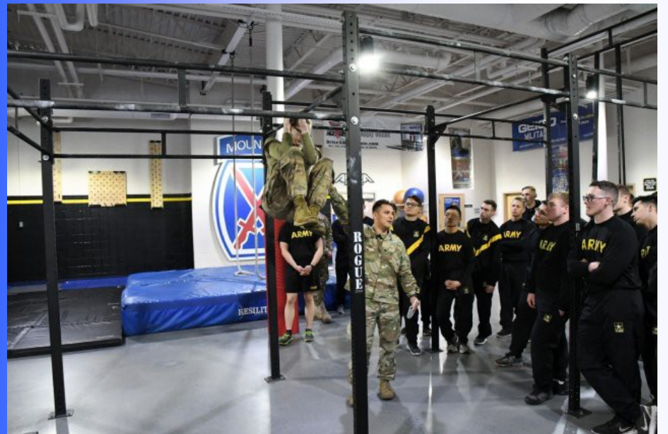
Soldiers learn the leg tuck event for the new Army Combat Fitness Test due to roll out in 2020, Feb 29, 2019.

Adequate - but not excessive - hydration is also key for performing well on physical competitions such as the ACFT. A Soldier can typically expect to see a decrease in performance with as little as two to three percent of their body weight loss from sweat.