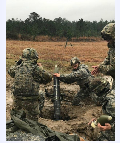
3-71CAV Mortars conduct live fire operations during JRTC rotation 19-04 at Fort Polk, LA, Feb. 23, 2019.