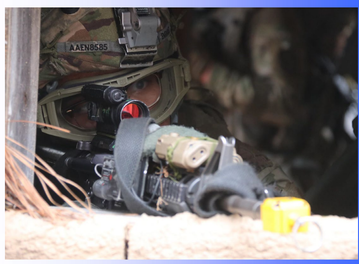
A Soldier assigned to 2-22IN secures the "village of Marjani" with his M4 Carbine, February 10, 2019 during JRTC rotation 19-04.