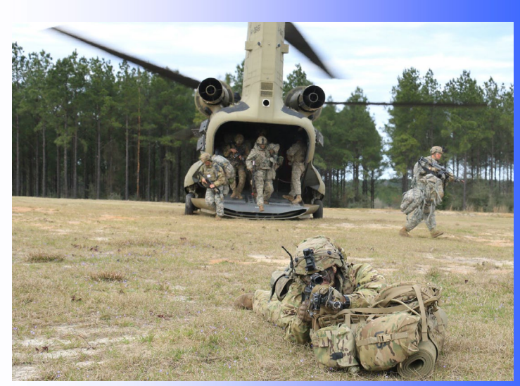
A Soldier assigned to 1BCT pulls guard after exiting an Boeing CH-47 Chinook helicopter during an air assault February 18, 2019 during rotation 19-04 at JRTC.