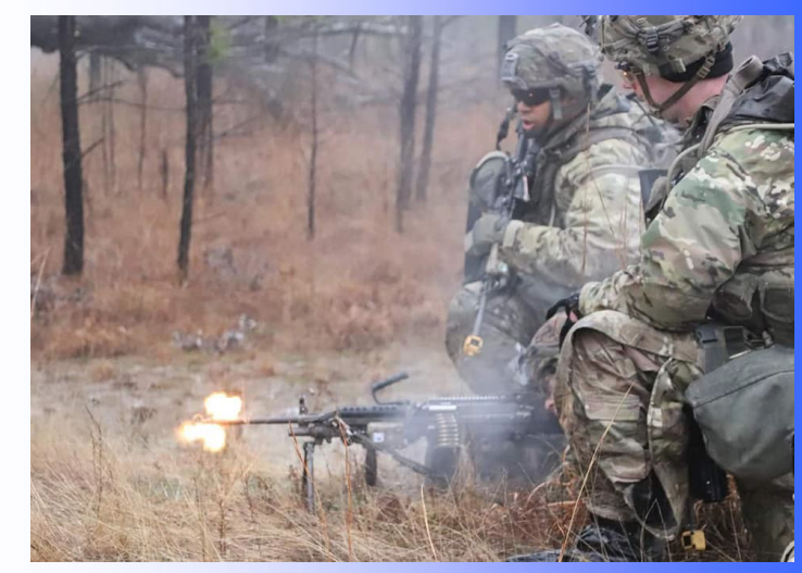
Soldiers assigned to 1-87IN, 1BCT, 10MTNDIV conduct battle training, February 20, 2019, during JRTC rotation 19-04.