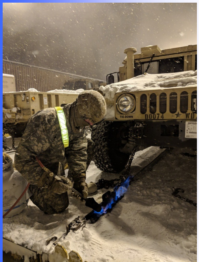
A Soldier from 1BCT uses a torch to melt the ice build up on a chain that connects the vehicle to the railhead car, Jan 28, 2019.