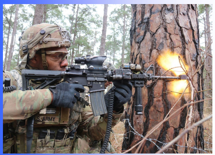
A Soldier with 1BCT fires on enemy combatants with his M4 Carbine during JRTC rotation 19-04 at Fort Polk, LA, Feb. 23, 2019.