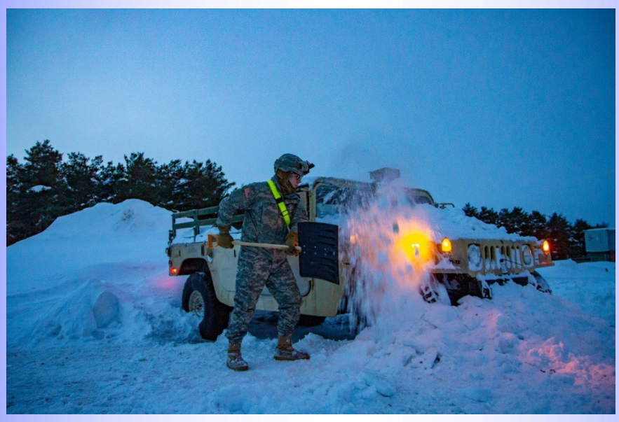
A 1BCT Soldier digs his vehicle out of the snow after a blizzard hit Fort Drum, New York, Jan 28, 2019.

In addition to the rail yard portion of the movement, there is also another aspect to the deployment to a training area: the line haul. Most of the line-haul portion of the operation is taken care of by civilians who drive military equipment to their destination. Since there was a state of emergency called for the county Fort Drum is located on, most of the trucks tasked to haul the equipment couldn't make it in until after the emergency was lifted. On top of the state of emergency, the amount of snow made it difficult to move equipment and load it once the trucks were able to move. The cold days of preparing equipment for transportation is behind them, and 1 BCT can concentrate on perfecting their profession through the rigorous training at JRTC.