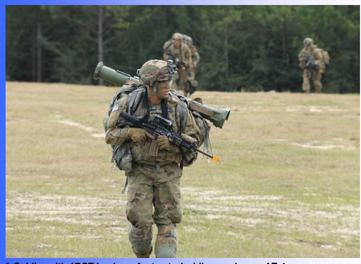
A Soldier with 1BCT begins a foot patrol while carrying an AT-4 Single-use anti-tank recoilless rifle during an air assault February 18, 2019 JRTC rotation 19-04.