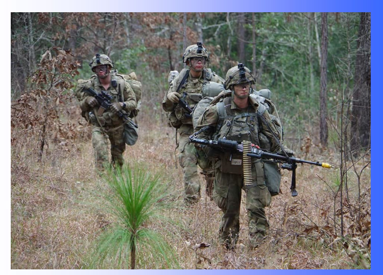
Soldiers assigned to 2-22 IN, patrol "Atropia," February 16, 2019, during rotation 19-04 at JRTC.