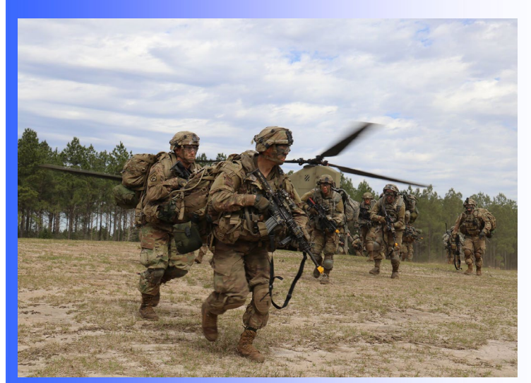
Soldiers assigned to 1BCT exit a Boeing CH-47 Chinook helicopter during an air assault February 18, 2019 during JRTC rotation 19-04.