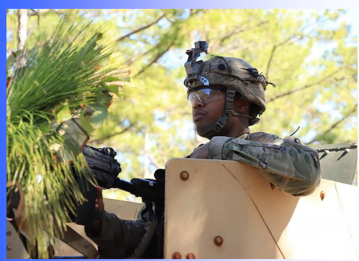
A Soldier assigned to 2-22 IN, pulls security with his M249 Squad Automatic Weapon from the gunner's hatch of a High Mobility Multipurpose Wheeled Vehicle (HMMWV), February 13, 2019, during JRTC rotation 19-04.