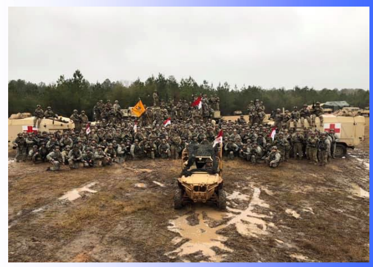
Our 3-71CAV, 1st Brigade Combat Team, 10th Mountain Division Soldiers assemble after a successful JRTC rotation 19-04. The Army's new tech vehicle, the Squad Multipurpose Equipment Transport (SMET) is in foreground.