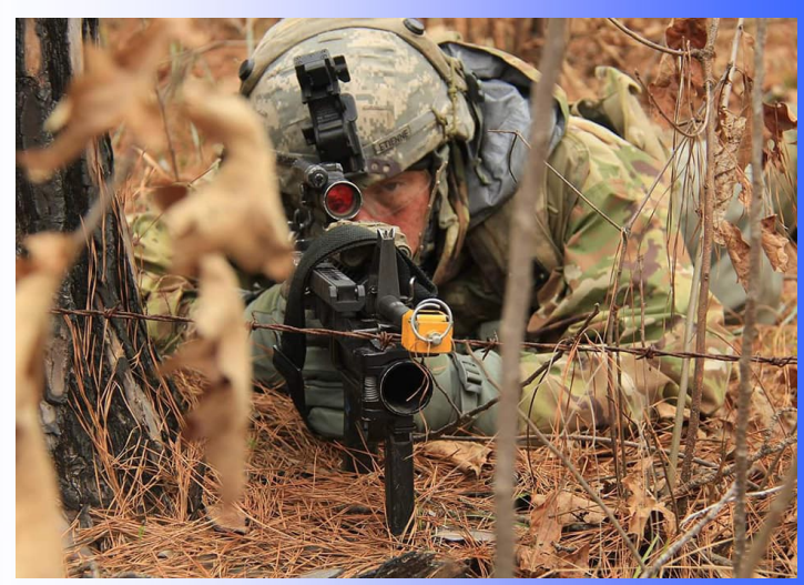
A Soldier assigned to 1-32IN keeps a watchful eye while holding security with his M4 Carbine, February 9, 2019 during JRTC rotation 19-04.