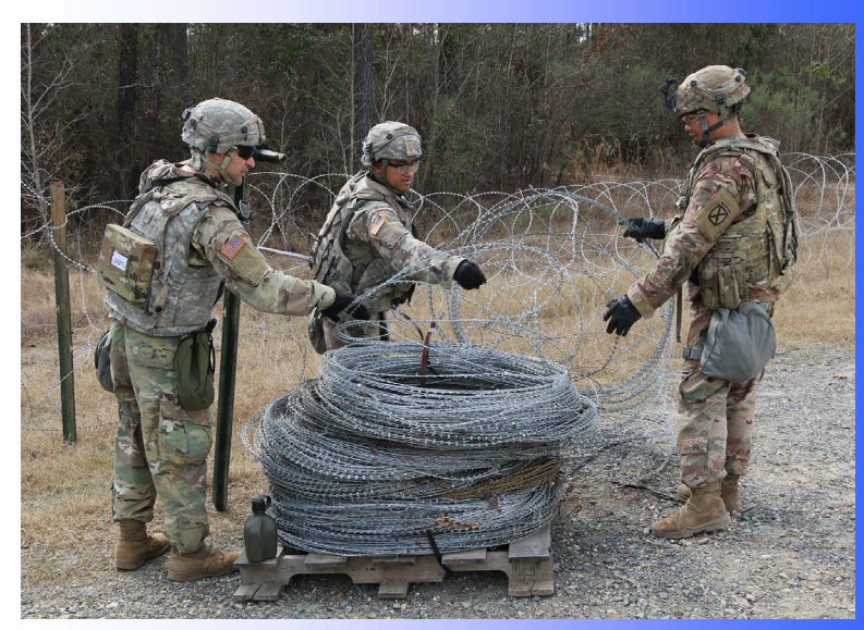
Soldiers assigned to 10th BSB, 1st Brigade Combat Team, 10th Mountain Division (LI) prepare to string concertina, February 7, 2019 during rotation 19-04 at JRTC.