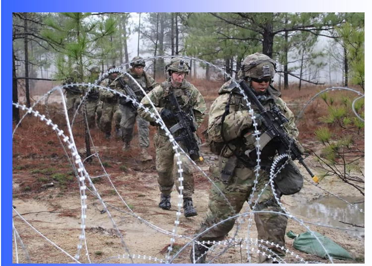
Soldiers assigned to 1-87IN breach through concertina wire, February 20, 2019, during JRTC rotation 19-04.