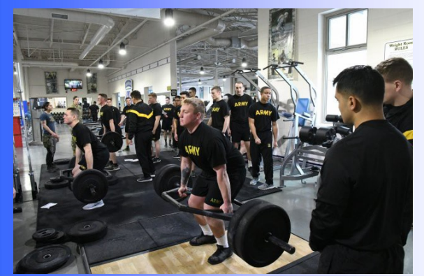
Soldiers pulled weighted sleds, ran with kettlebells and cranked out deadlifts at the gym one recent frosty morning at Fort Drum in preparation for the Army Combat Fitness Test, Feb 29, 2019.

Story by Mike Strasser 10th Mountain Division Public Affairs