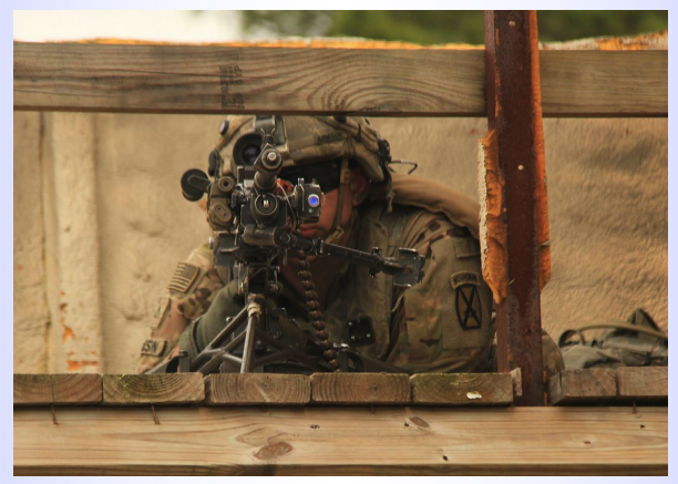
A Soldier assigned to 1-32IN secures the "village of Batoor" with his M240B Light Machine Gun, February 11, 2019 during rotation 19-04 at JRTC.