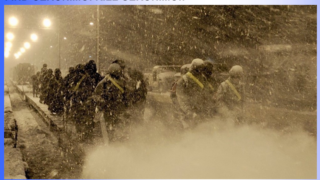
Brave 1BCT Warriors withstand a polar vortex to complete railhead operations in preparation for JRTC Rotation 19-04, Fort Drum, N.Y., Jan 26, 2019. Several blizzards rolled through Fort Drum, dumping more than four feet of snow on the North Country, but the 1BCT out load stayed on schedule.