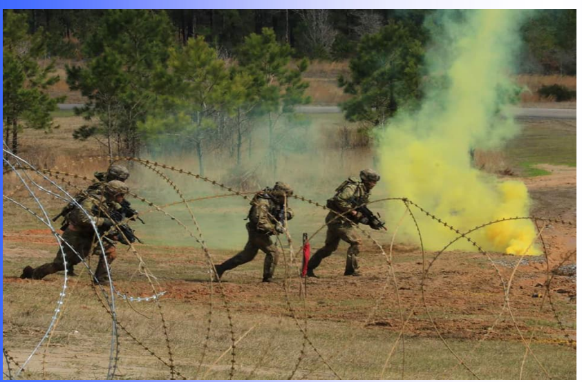
Soldiers assigned to 1-32IN, 1BCT, 10MTNDIV conduct battle training, February 20, 2019, during rotation 19-04 at JRTC.