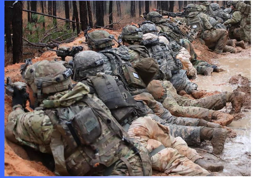
Soldiers assigned to 1-87IN, 1BCT, 10MTNDIV prepare to assault over a berm, February 20, 2019, during rotation 19-04 at JRTC.