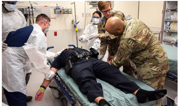
Members of Brooke Army Medical Center's medical staff simulate providing emergency care to an exercise role player during the 2018 San Antonio Mass Casualty Exercise and Evaluation at Brooke Army Medical Center Oct. 11. SAMCEE is an annual exercise designed to test the capabilities of hospitals and emergency responders in the San Antonio area.

BAMC's relationship with its local partners extends far beyond patient