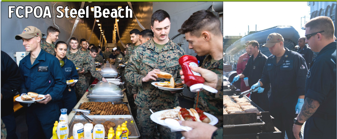
Harpers Ferry Sailors and Marines from MEU11 enjoy a steel beach picnic hosted by the First Class Petty Officer Association.