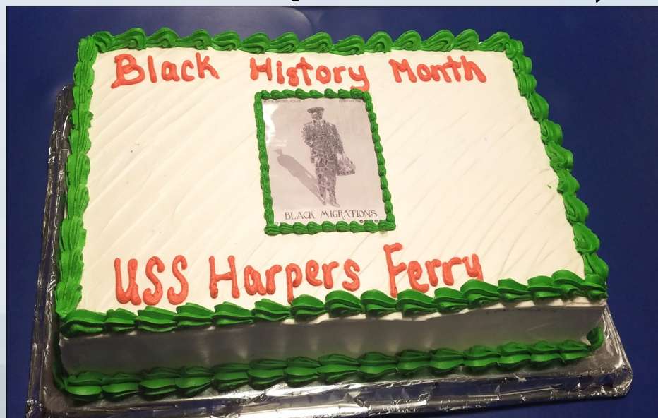
A unique cake for a unique occasion—Black History Month aboard USS HARPERS FERRY.