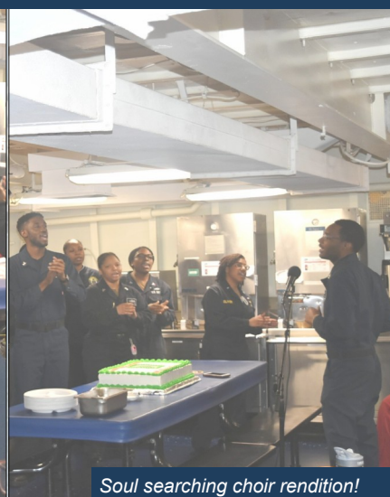
Soul searching choir rendition!