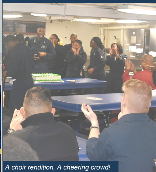
A choir rendition, A cheering crowd!