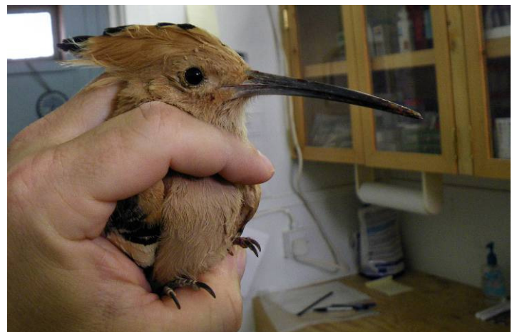
Above: a Hoopoe injured during migration at Al Asad

Left: "The Concourse of the Birds" by Habib Allah, circa 1600. Note the Hoopoe center right instructing the other birds on the Sufi path, where the birds find religious truth by looking within themselves after many trials.