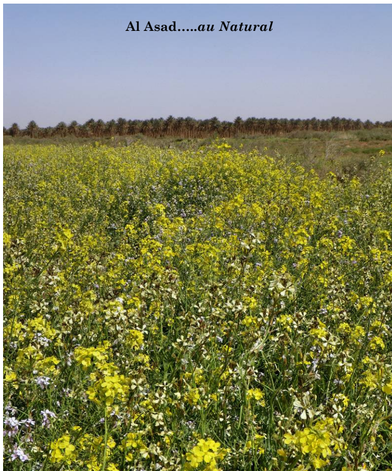
Al Asad.....au Natural