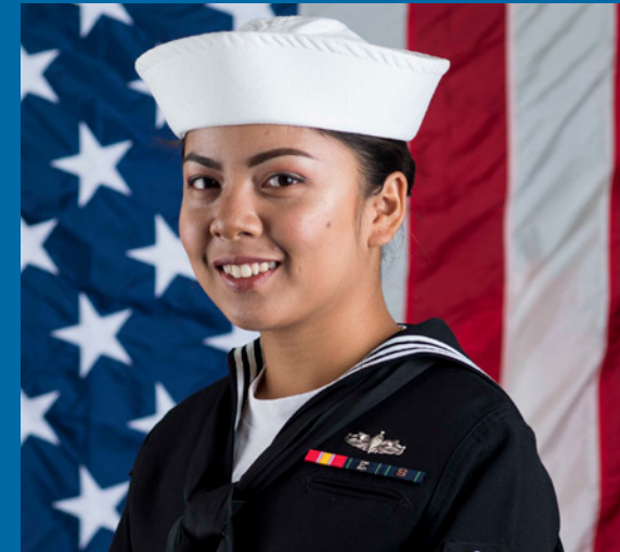
SN HENESSEY ALBA USS RUSHMORE (LSD 47)