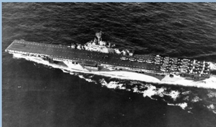
FEB. 1, 1942 - FIRST U.S. AIRCRAFT CARRIER OFFENSIVE OF THE WAR AS YORKTOWN AND ENTERPRISE CONDUCT AIR RAIDS ON JAPANESE BASES IN THE GILBERT AND MARSHALL ISLANDS.