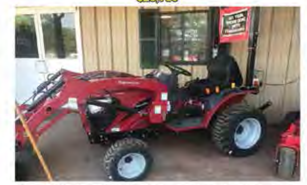
Emax 22HST - 22 HP, 4WD, Hydrostat, Quick Attach Loader w/ Bucket, Industrial Tires, 7 Year Powertrain Warranty - 391,2800