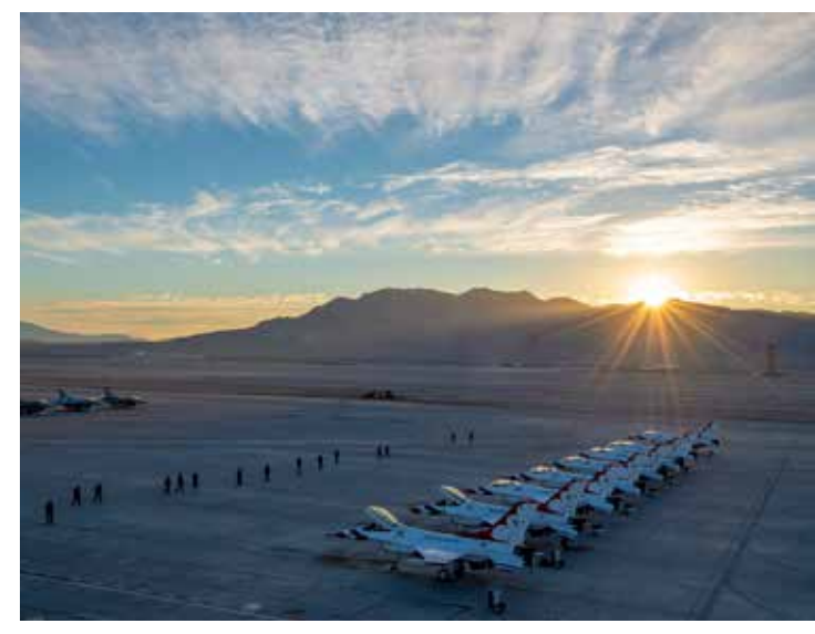
• Airmen assigned to the U.S. Air Force Air Demonstration Squadron Thunderbirds conduct the first official launch of the Thunderbird Diamond formation Jan. 9, 2019, at Nellis Air Force Base, Nev. This training flight represents a key milestone for the 2019 Thunderbird team as members prepare to showcase the pride, precision and professionalism of the Air Force during the upcoming show season.