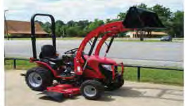
Emax 22HST - 22 HP, 4WD, Hydrostat, Quick Attach Loader w/ Bucket, Industrial Tires, 7 Year Powertrain Warranty, 60" Belly Mower - $13,500