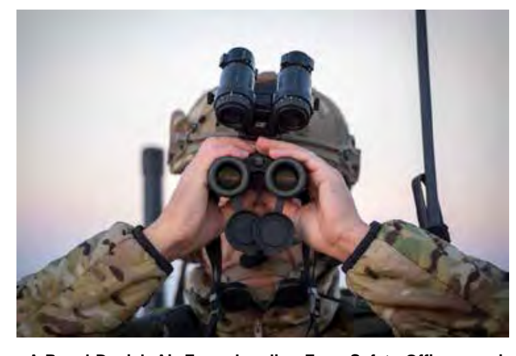
• A Royal Danish Air Force Landing Zone Safety Officer monitors an inbound Danish C-130J Super Hercules preparing to land at Field Six on Eglin Air Force Base, Fla., Jan. 15, 2019, during Exercise Emerald Warrior 19. Emerald Warrior 19 provides annual realistic and relevant pre-deployment training. It encompasses multiple joint operating areas to prepare special operations forces, conventional force enablers, partner nations and interagency elements to integrate with and execute full-spectrum special operations. All aspects of live, virtual and constructive training assets are used.

mission.