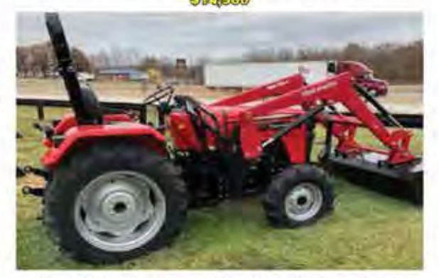
Mahindra 4550 Tractor w/ Loader · 50 HP, 4WD, Gear Shift, 7 Year Powertrain Warranty, 1 Set Of Remotes.