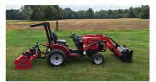
Mahindra Max 26 HST - 26 HP, Hydrostat, 4WD, 7 Year Powertrain Warranty, O/A Loader And Skid Steer Bucket

LOSE CASH REBATES IF YOU ARE TRADING IN! Leftover 2018 SALE – Making Room For 2019s