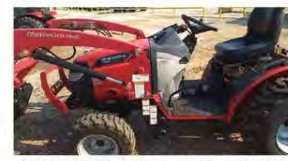
Mahindra Max 26 Shintle Shift Demo Model - 26 HP, 4WD, 7 Year Powertrain Warranty, Q/A Loader And Skid Steer Bucket 814,000

2 Implements = $500 OFF 3 Implements = $1,000 OFF