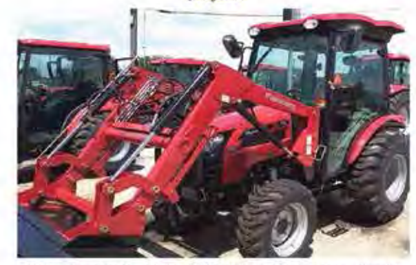
Mahindra 2545C = 45 HP, 4WD, Cab w/AC And Heat, Shuttle Shift, Radio, 7 Year Powertrain Warranty, 1 Set Of Remotes