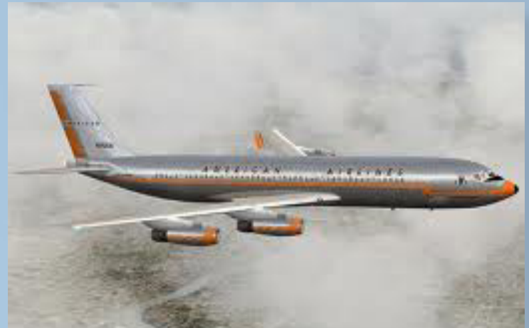
JAN. 25, 1959: THE FIRST TRANSCONTINENTAL COMMERCIAL JET TRIP WAS MADE BY AN AMERICAN AIRLINES BOEING 707 FROM LOS ANGELES TO NEW YORK.

Sign up by Feb. 1 Feb. 9 2 p.m.-midnight Outdoor Recreation