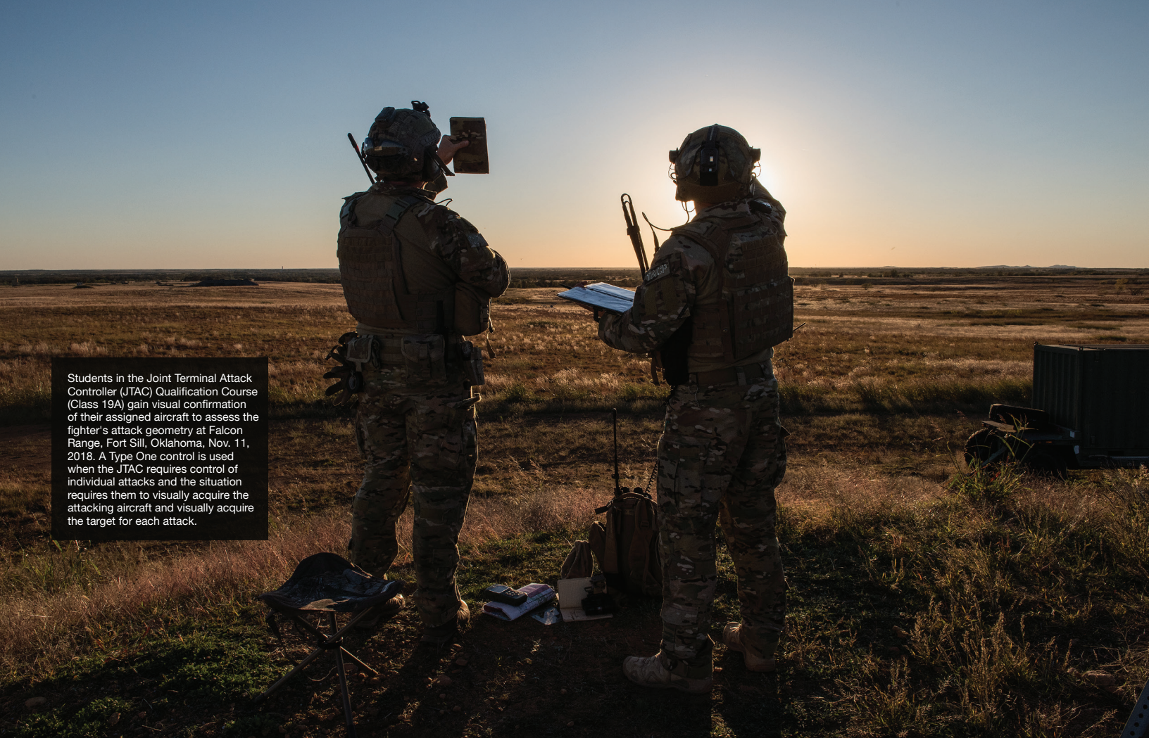
Students in the Joint Terminal Attack Controller (JTAC) Qualification Course (Class 19A) gain visual confirmation of their assigned aircraft to assess the fighter's attack geometry at Falcon Range, Fort Sill, Oklahoma, Nov. 11, 2018. A Type One control is used when the JTAC requires control of individual attacks and the situation requires them to visually acquire the attacking aircraft and visually acquire the target for each attack.