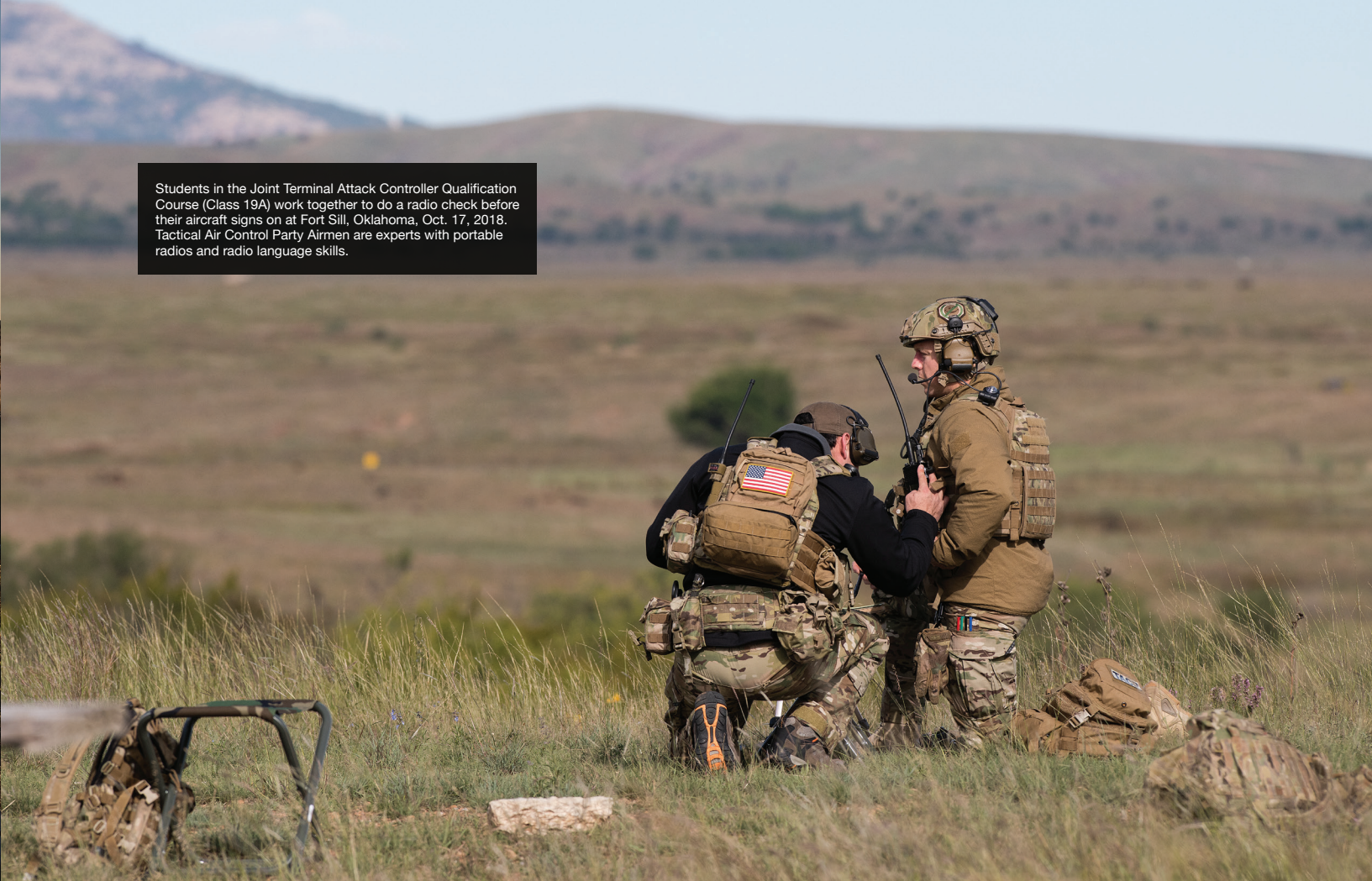
Students in the Joint Terminal Attack Controller Qualification Course (Class 19A) work together to do a radio check before their aircraft signs on at Fort Sill, Oklahoma, Oct. 17, 2018. Tactical Air Control Party Airmen are experts with portable radios and radio language skills.