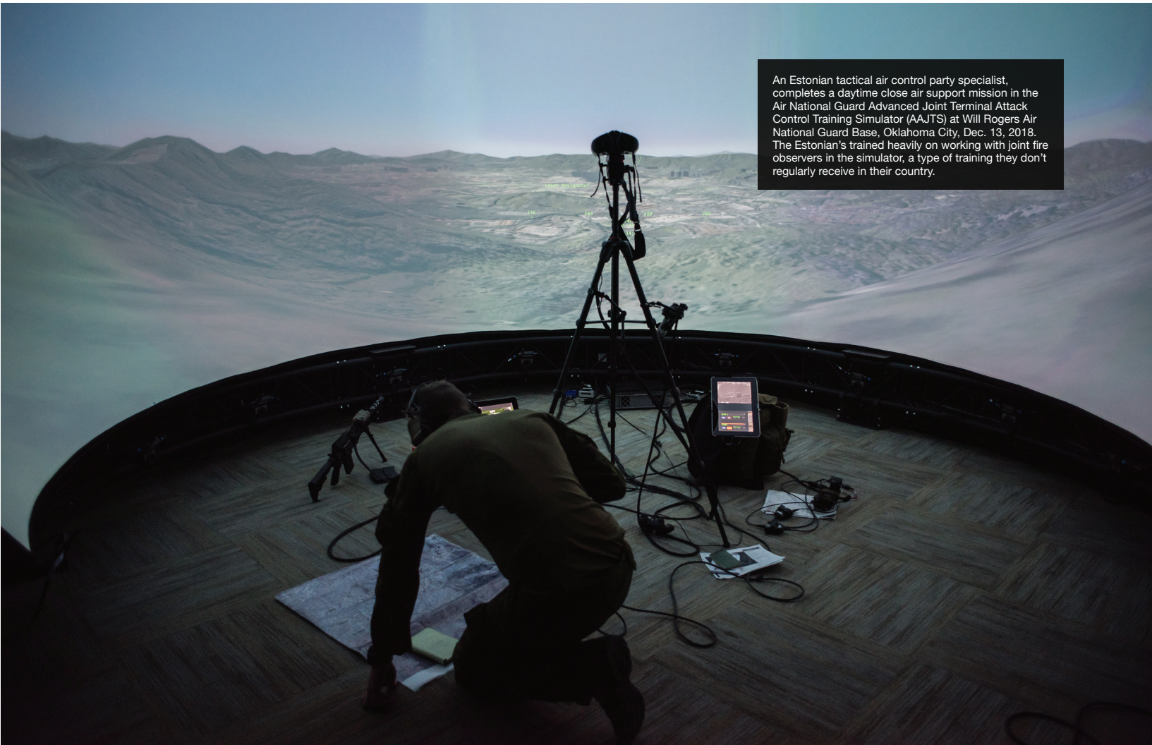
An Estonian tactical air control party specialist, completes a daytime close air support mission in the Air National Guard Advanced Joint Terminal Attack Control Training Simulator (AAJTS) at Will Rogers Air National Guard Base, Oklahoma City, Dec. 13, 2018. The Estonian’s trained heavily on working with joint fire observers in the simulator, a type of training they don’t regularly receive in their country.