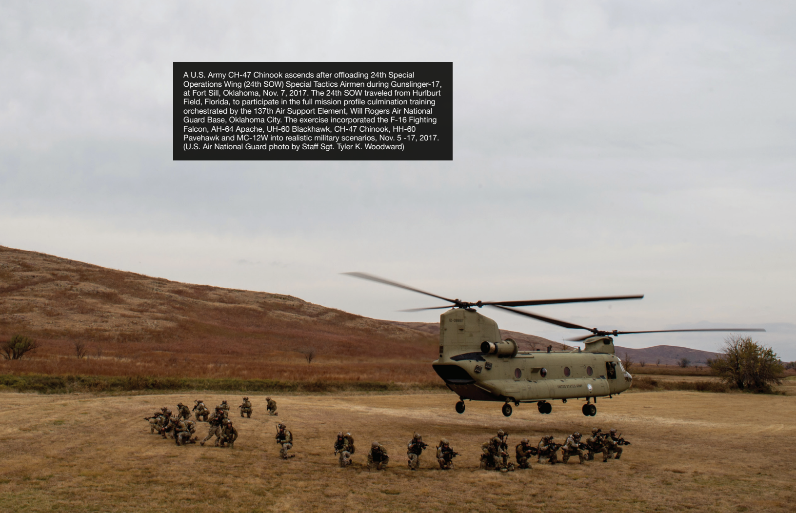
A U.S. Army CH-47 Chinook ascends after offloading 24th Special Operations Wing (24th SOW) Special Tactics Airmen during Gunslinger-17, at Fort Sill, Oklahoma, Nov. 7, 2017. The 24th SOW traveled from Hurlburt Field, Florida, to participate in the full mission profile culmination training orchestrated by the 137th Air Support Element, Will Rogers Air National Guard Base, Oklahoma City. The exercise incorporated the F-16 Fighting Falcon, AH-64 Apache, UH-60 Blackhawk, CH-47 Chinook, HH-60 Pavehawk and MC-12W into realistic military scenarios, Nov. 5 -17, 2017.

tedious like lodging for every participant, and even the minute like the color of a shirt on a simulated enemy.