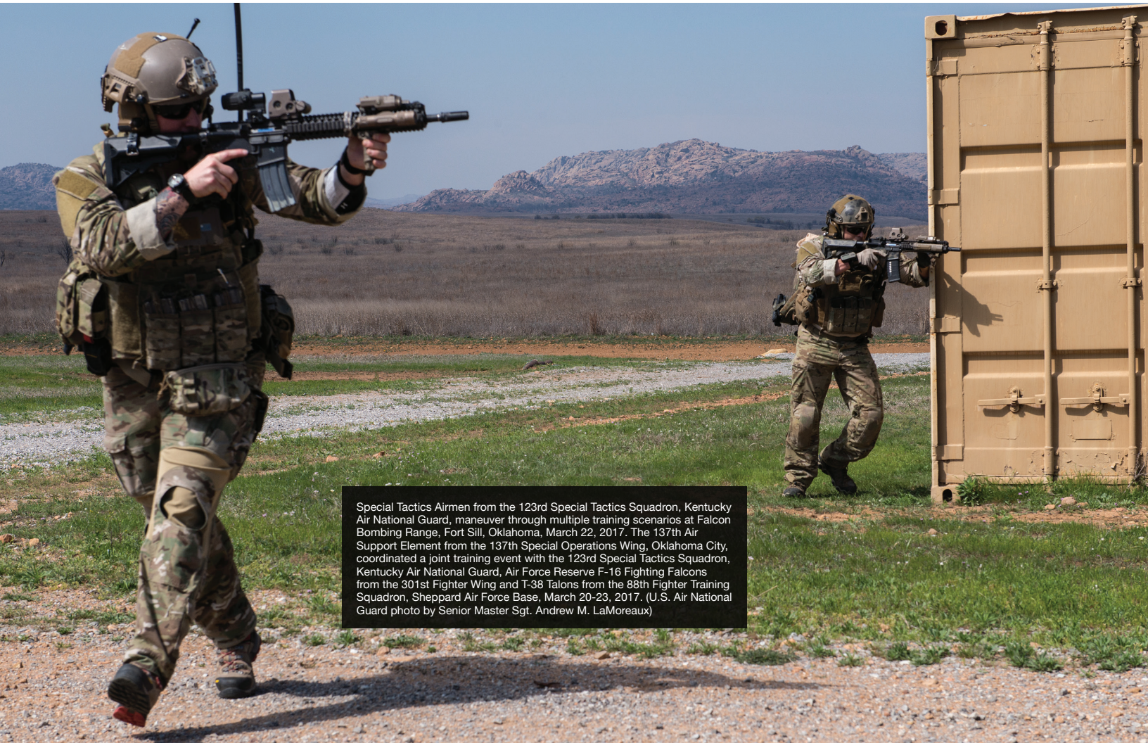
Special Tactics Airmen from the 123rd Special Tactics Squadron, Kentucky Air National Guard, maneuver through multiple training scenarios at Falcon Bombing Range, Fort Sill, Oklahoma, March 22, 2017. The 137th Air Support Element from the 137th Special Operations Wing, Oklahoma City, coordinated a joint training event with the 123rd Special Tactics Squadron, Kentucky Air National Guard, Air Force Reserve F-16 Fighting Falcons from the 301st Fighter Wing and T-38 Talons from the 88th Fighter Training Squadron, Sheppard Air Force Base, March 20-23, 2017.