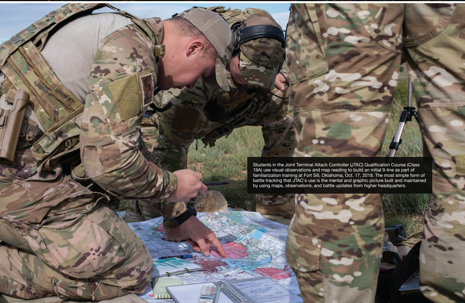
Students in the Joint Terminal Attack Controller (JTAC) Qualification Course (Class 19A) use visual observations and map reading to build an initial 9-line as part of familiarization training at Fort Sill, Oklahoma, Oct. 17, 2018. The most simple form of battle tracking that JTAC's use is the mental and graphic picture built and maintained by using maps, observations, and battle updates from higher headquarters.