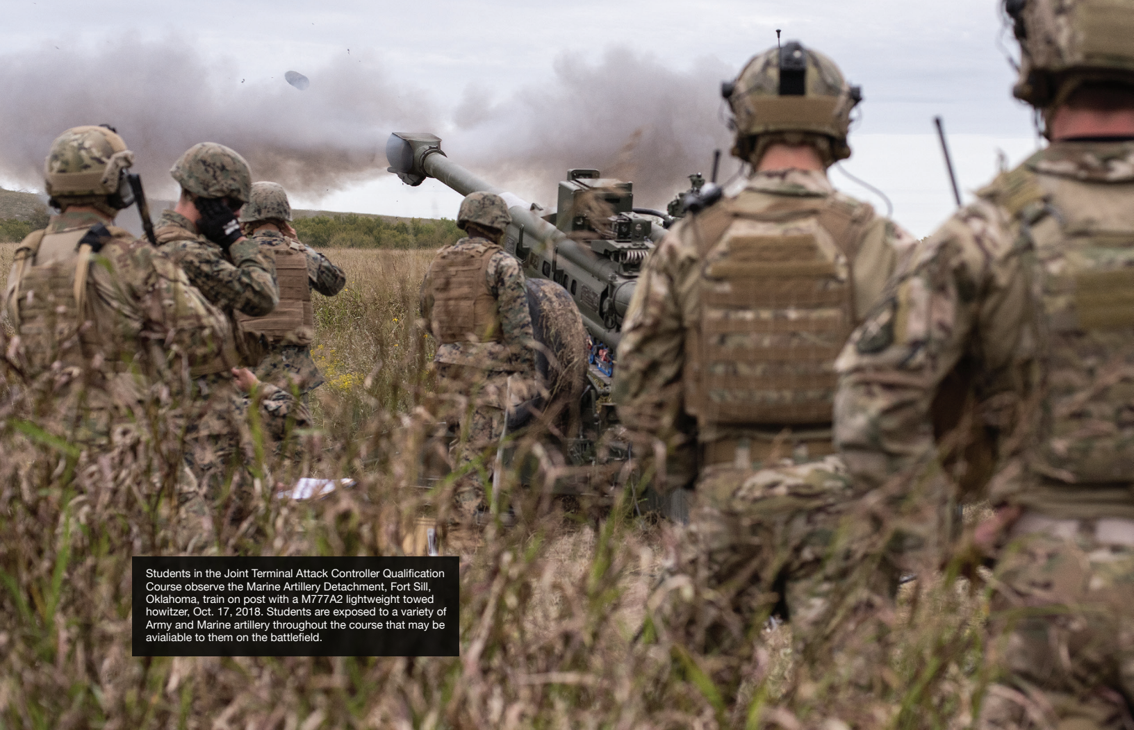
Students in the Joint Terminal Attack Controller Qualification Course observe the Marine Artillery Detachment, Fort Sill, Oklahoma, train on post with a M777A2 lightweight towed howitzer, Oct. 17, 2018. Students are exposed to a variety of Army and Marine artillery throughout the course that may be available to them on the battlefield.