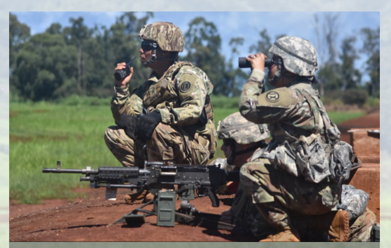
SCHOFIELD BARRACKS, Hawaii-Soldiers work together to put M240B rounds effectively on targets downrange during Operation Pacific Steel at Schofield Barracks October 14, 2018.

The Pacific Press page 14 December 20, 2018 The Pacific Press page 15 December 20, 2018