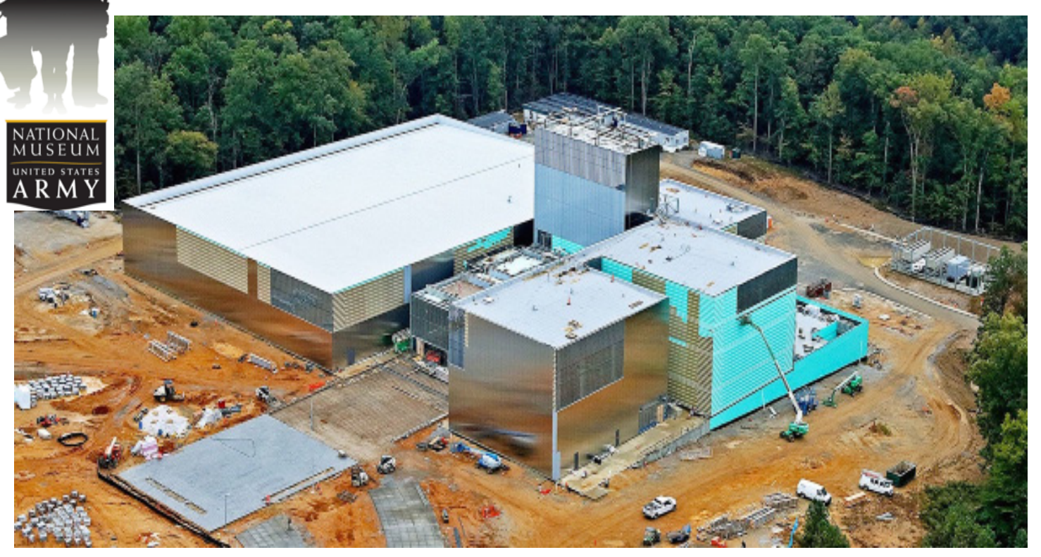
Story by Maj. Christina Rudolph 30th Military History Detachment

In 2016, site preparation began for the National Museum of the United States Army. Located on an 84 acre parcel of land at Fort Belvoir, VA. The 185,000 square foot main building will house a series of galleries, meeting areas, interactive exhibits, 360 degree Theater Experience, as well as a dining facility. The surrounding grounds will be home to a Medal of Honor Memorial Garden, outdoor Amphitheater, and Parade Ground with Grandstand. Guests will also be able to learn survival techniques as they navigate the interactive Army Trail Experience.