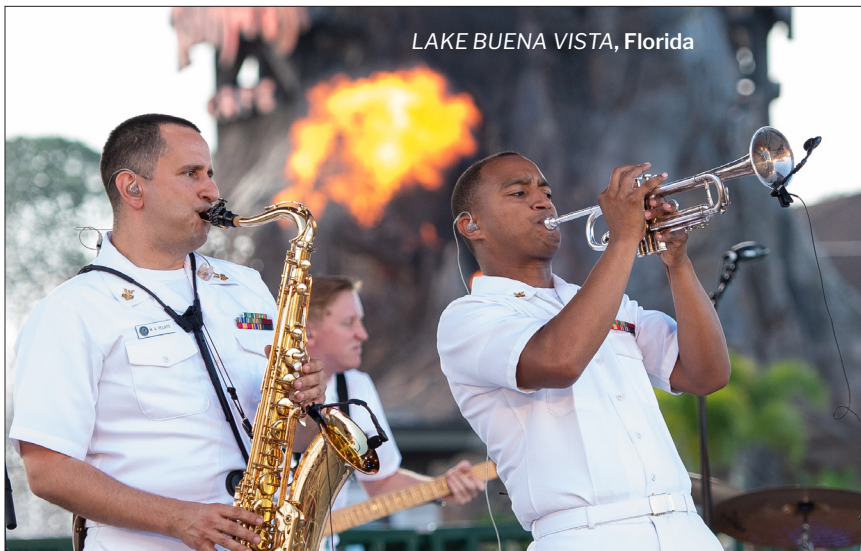
LAKE BUENA VISTA, Florida

Béla Bartók I. Bot tãnc/Jocul c II. Brail III. Topogó/Pe loc IV. Bucsumí tãnc/Buciumeana V. Român polka/Poarga Românească VI. Aprózó/Mărunțel