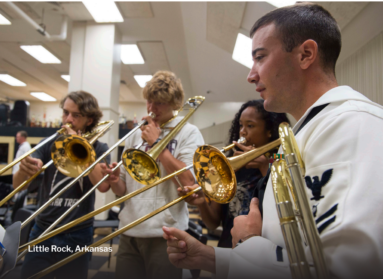
Little Rock, Arkansas

For more information, call Fleet Band Activities at 901-874-4351.