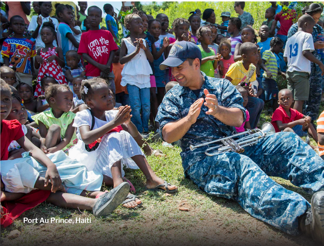
Port Au Prince, Haiti

Whether performing for school children in Asia, entertaining crowds in the Midwest, or participating in funerals at Arlington National Cemetery, your Navy bands are connecting people from all walks of life to America's Navy.