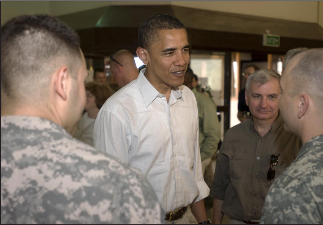
U.S. Senator Barack Obama, D-Ill., center, speaks with a U.S. Soldier in Basra, Iraq, July 21, 2008, during a visit to Headquarters, Multi-National Division (South East).