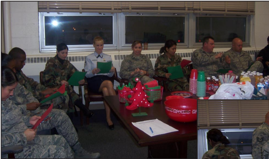
111th MSF personnel break tradition and hold a Christmas "Breakfast Party" and gift card exchange on Dec. 6.