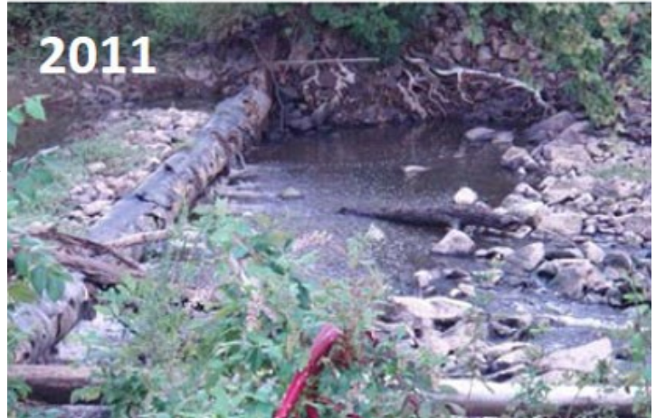
In 2007, the city of Goldsboro repaired the weir structure with rock stabilization.

flow sheet pile weir near the upstream end of the channel. The weir has often been in a state of disrepair due to inadequate USACE