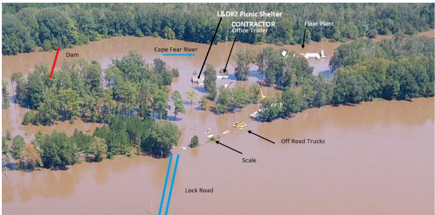
This aerial view of Lock and Dam 2 shows the severity of flooding.

the dam. Without completed with the scour hole repair