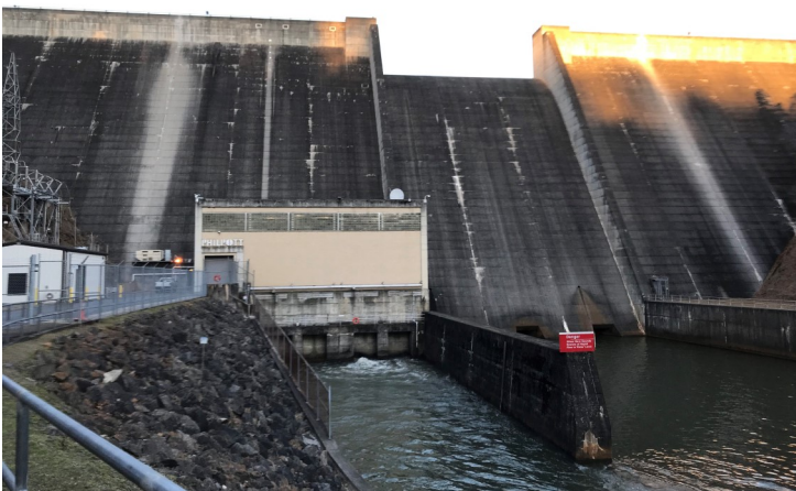
Philpott Dam requires a thorough inspection on the inside and on the outside every year.

simply involve future monitoring, such as a small soil slide along a stream valley slope, which is near the dam.”