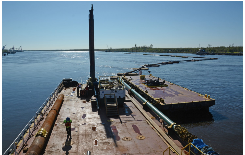
Dredged material from the Cherokee is pumped over to the Wilmington District's Eagle Island Confined Disposal Facility (CDF).

In order to keep commercial shipping vessels navigating safely and efficiently to and from the Port of Wilmington, the Wilmington District conducts daily surveys of the federal channel and periodically dredges it to remove debris. The Cape Fear River carries tons of sediment that gradually settles along the way of its 202-mile path to the Atlantic Ocean. When its flows reach Wilmington, some of that material ends up in the federal channel that stretches