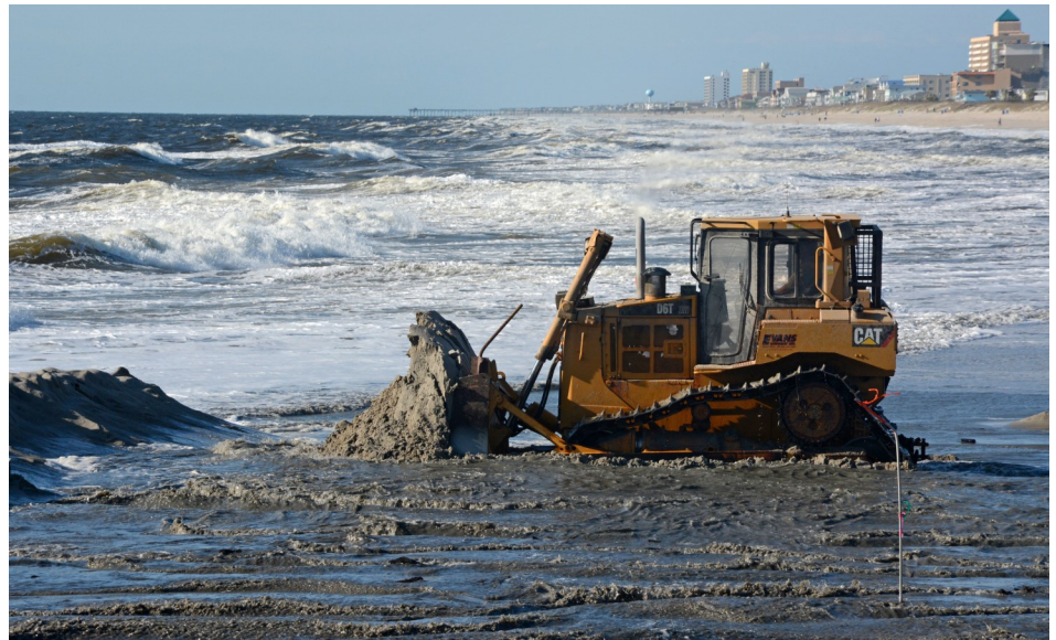
A bulldozer moves dredged material on the north end of Carolina Beach.

Periodic nourishment, or placement of additional sand along the shoreline, helps ensure that the project continues to provide authorized storm risk reduction benefits to homes, businesses, and critical