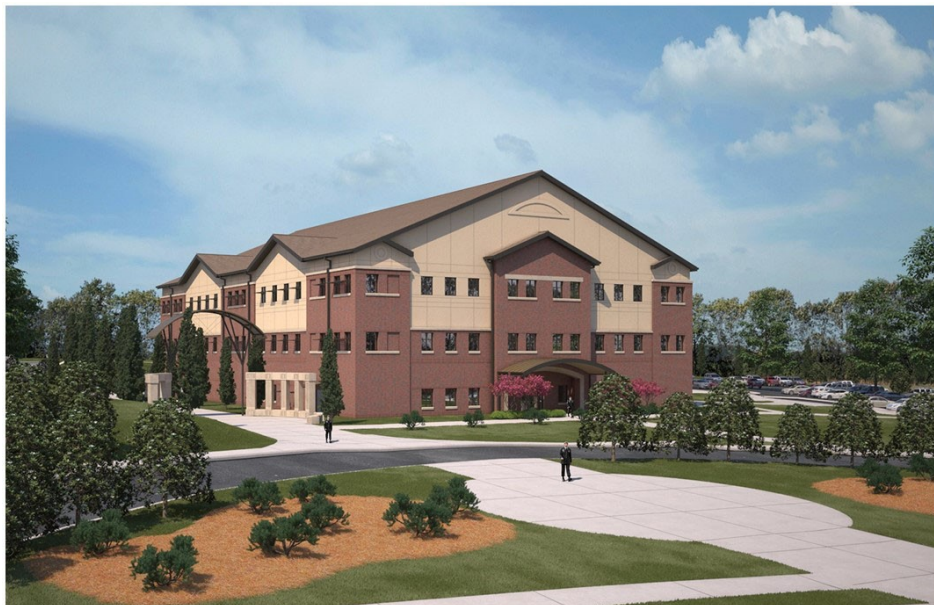
Artist rendition of a building on the SWCS Fort Bragg campus.