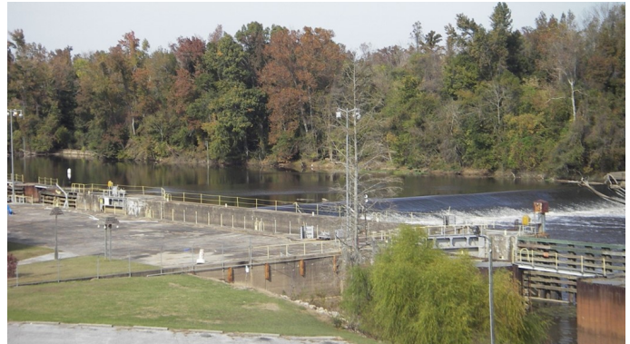
Lock and Dam 1 is located near Riegelwood on the Cape Fear River.

“The second and third lock and dam structures are each more than 80 years old