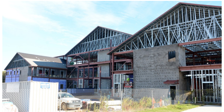
This future building will provide rooms for training Special Warfare Training Group command and staff.

“The museum is located at a temporary location while the customer is designing its new location, features and layout,” Whitley said. “We are told it will