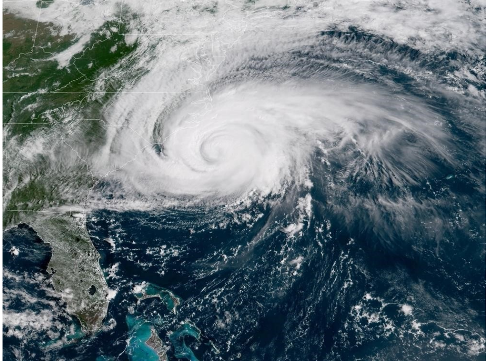
Hurricane Florence made landfall in southeastern North Carolina on Sept. 14 and left thousands of people homeless.