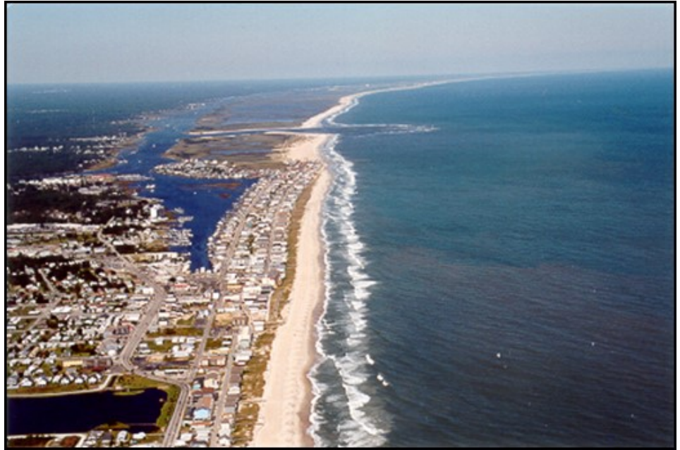
Periodic nourishment helps ensure that the project continues to provide authorized storm risk reduction benefits to homes, businesses, and critical infrastructure.

Medlock estimates that the Corps will be able to issue a notice to proceed to the contractor within 30 days of contract award. Actual start of construction has not been determined. This project must be completed no later than April 30, 2019, before the beginning of the turtle nesting season.