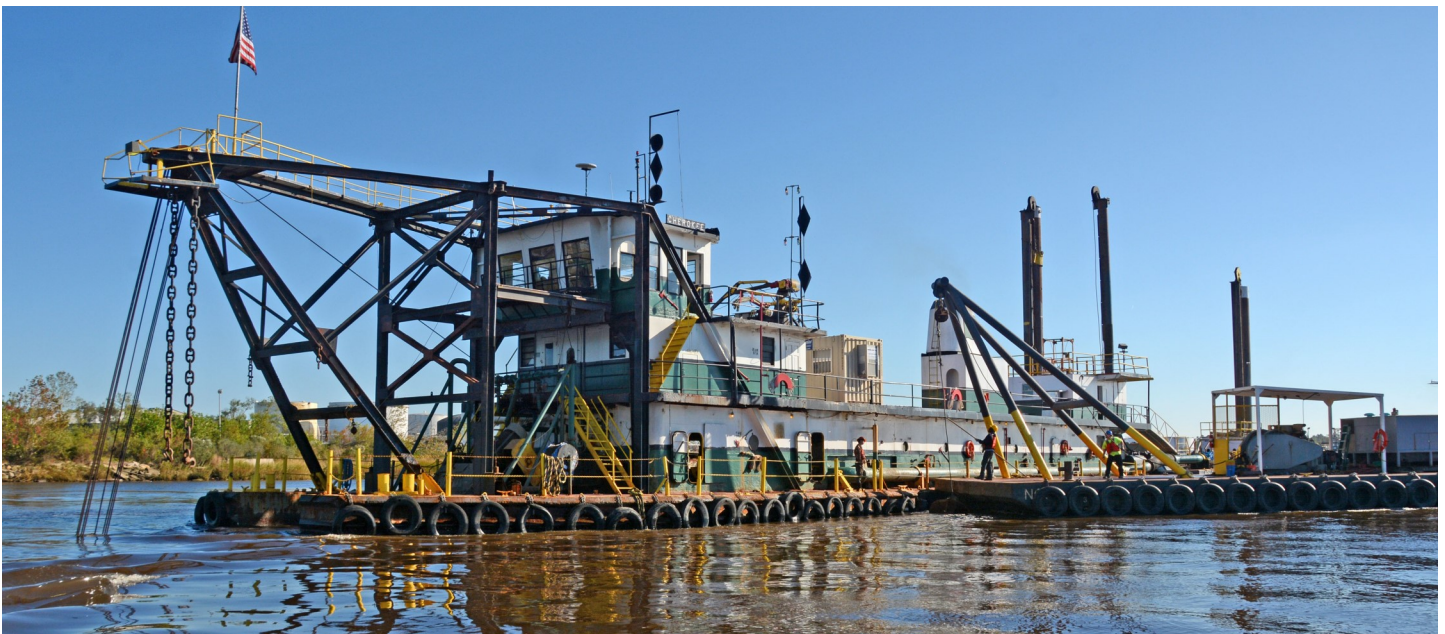
Contractor Southern Dredging's vessel Cherokee, a hydraulic cutter suction dredge, removes sediment near the Port of Wilmington.

Wilmington Harbor federal navigation channel reaches is Aug. 1, 2018 through Jan. 31, 2019.