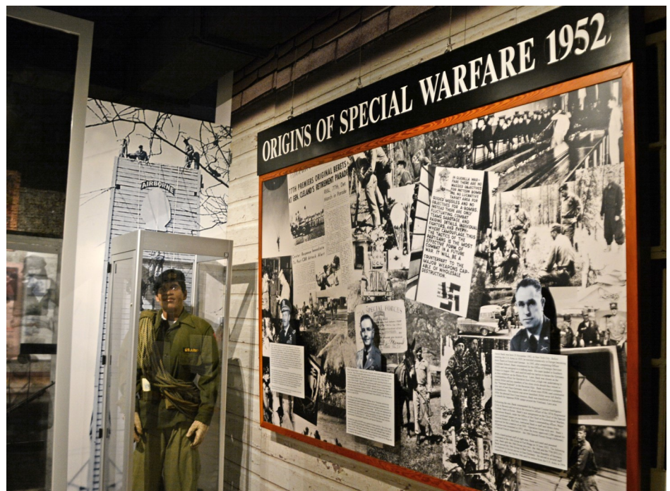
The Special Warfare Museum received external modifications by the Resident Engineer Office. It will remain in its temporary location near the campus until a new museum is built.