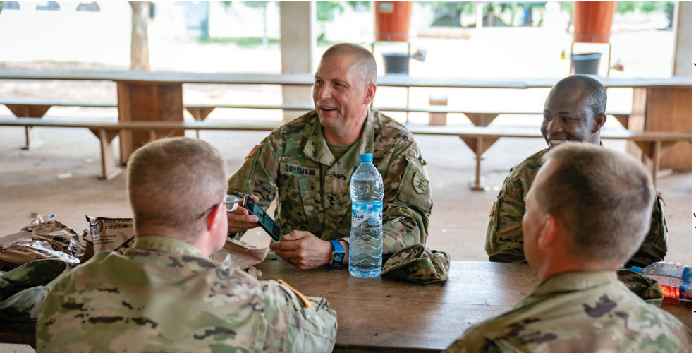
Maj. Gen. Al Dohrmann, North Dakota adjutant general, visits with Soldiers from the 188th Engineer Company in July during United Accord in Ghana, Africa. The multinational joint exercise was developed to allow the U.S. and its African partners to train together and build readiness across 22 different countries.