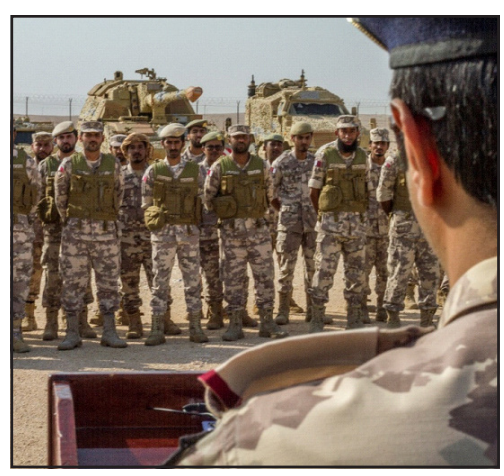
UM HATTAH, Qatar – Qatari Army Lt. Col. Khalifa Al-Suwaidi, Exercise Eastern Action 2019 director, Qatar Emiri Land Force, addresses U.S. and Qatari military forces at the opening ceremony of Exercise Eastern Action 2019, Nov. 4, 2018.