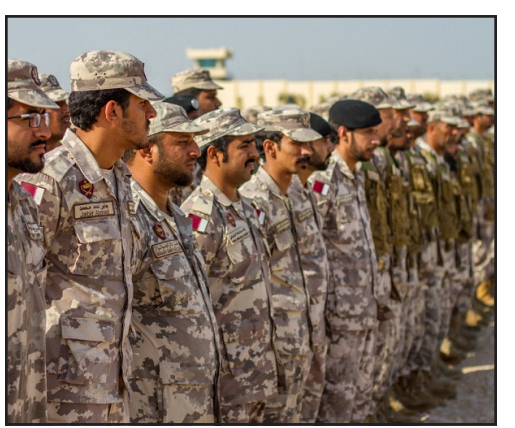
UM HATTAH, Qatar – (Above and right) U.S. and Qatari military forces participate in the opening ceremony of Exercise Eastern Action 2019, Nov. 4, 2018.