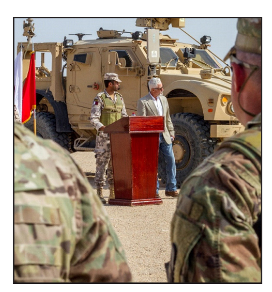
UM HATTAH, Qatar – Qatari Army Capt. Hamad Labda, the commander of Rapid Reaction Battalion, Qatar Emiri Land Force, addresses U.S. and Qatari military forces at the opening ceremony of Exercise Eastern Action 2019, Nov. 4, 2018.