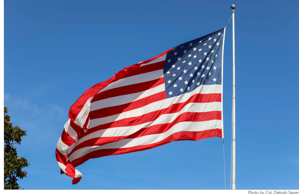
The national ensign flies aboard Marine Corps Air Station Beaufort Nov. 11. The date marked 100 years since world leaders signed the Armistice ending World War I.

significance. The Marine Corps was forged on the battlefields of France and