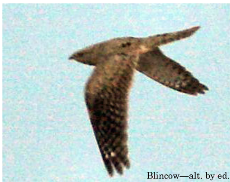
Blinco—alt. by ed.