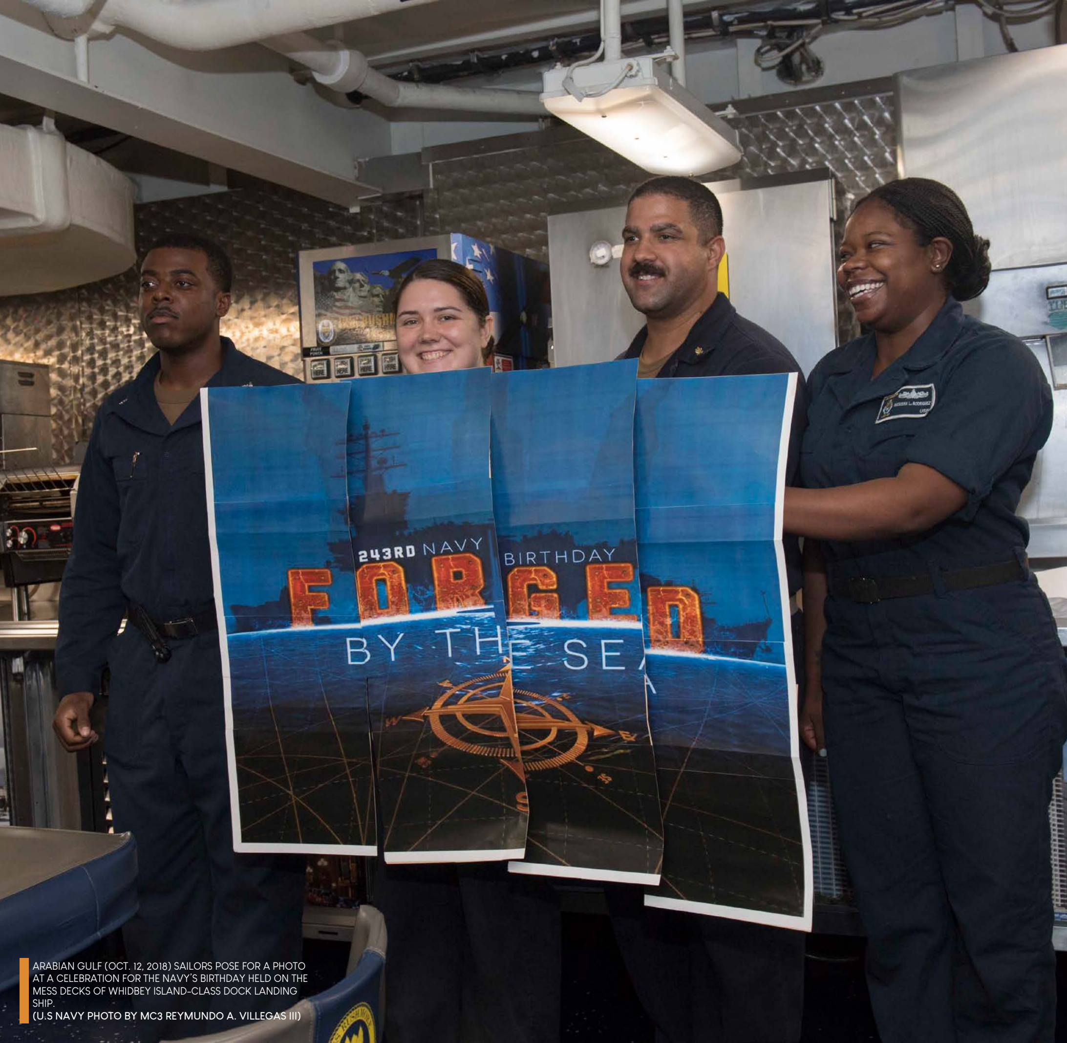
ARABIAN GULF (OCT. 12, 2018) SAILORS POSE FOR A PHOTO AT A CELEBRATION FOR THE NAVY'S BIRTHDAY HELD ON THE MESS DECKS OF WHIDBEY ISLAND-CLASS DOCK LANDING SHIP.

Emphasizing that how we invest our time and resources are important, Spencer also said that the National Defense Strategy provides guidelines in that regard.