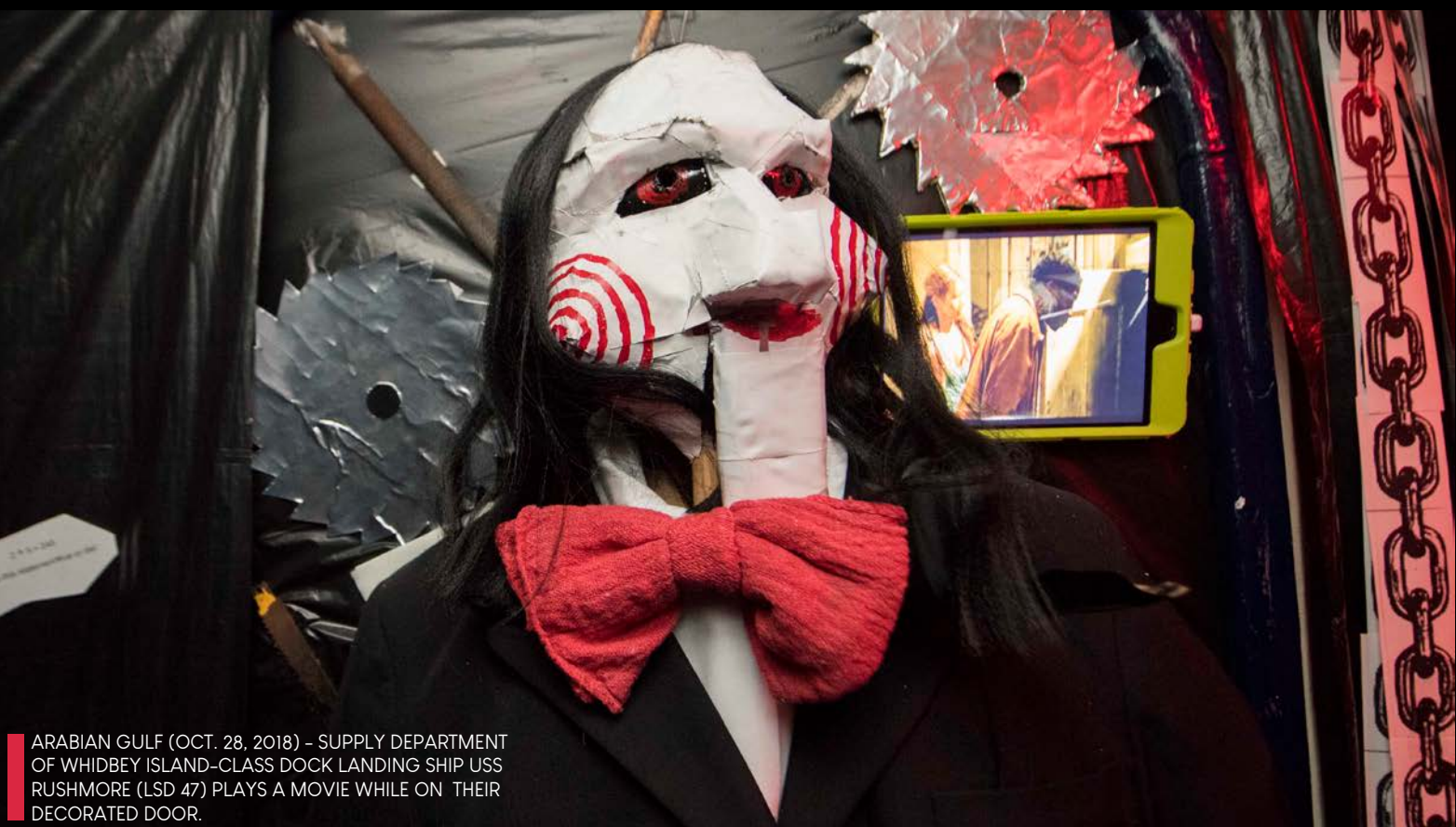
ARABIAN GULF (OCT. 28, 2018) - SUPPLY DEPARTMENT OF WHIDBEY ISLAND-CLASS DOCK LANDING SHIP USS RUSHMORE (LSD 47) PLAYS A MOVIE WHILE ON THEIR DECORATED DOOR.