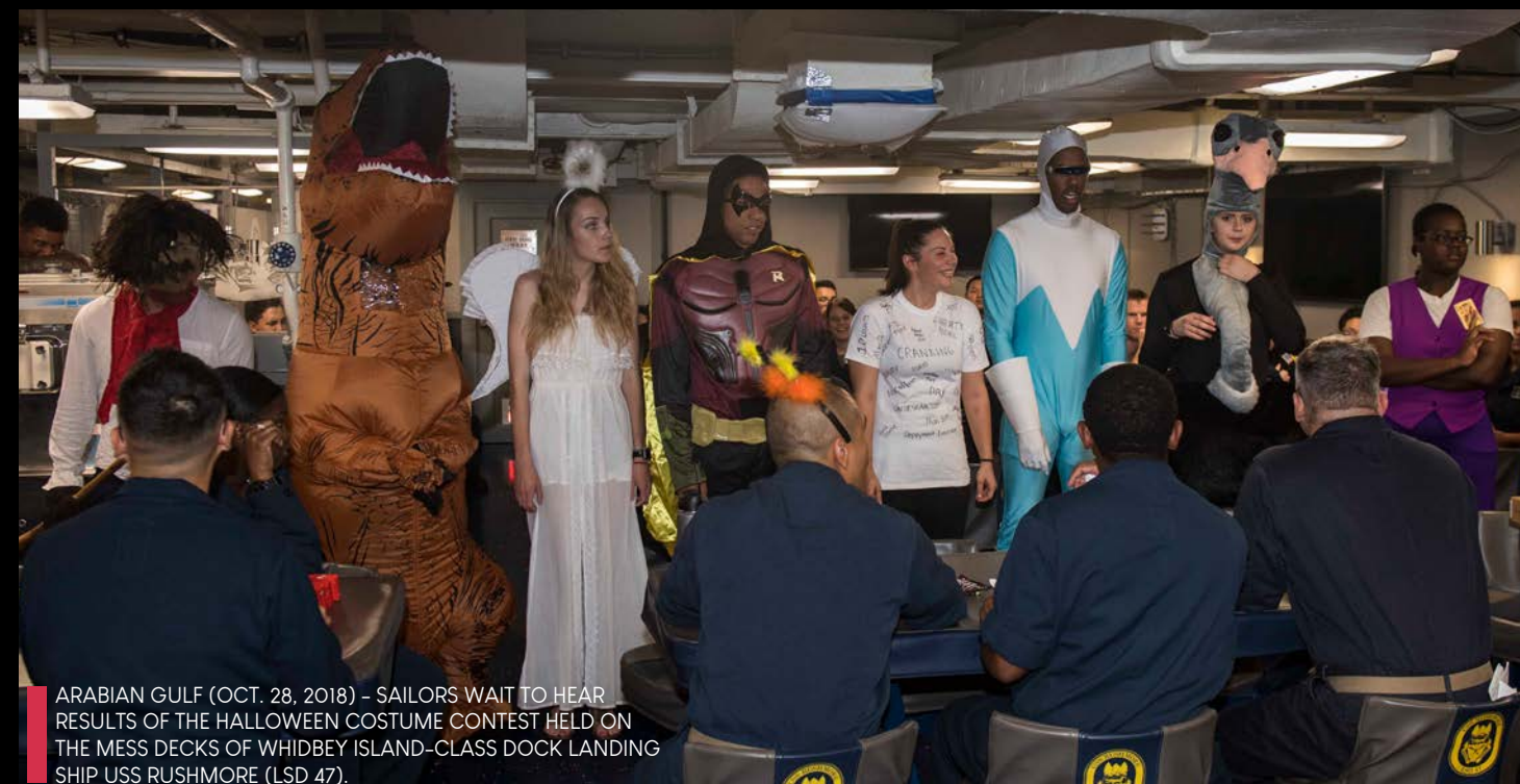
ARABIAN GULF (OCT. 28, 2018) – SAILORS WAIT TO HEAR RESULTS OF THE HALLOWEEN COSTUME CONTEST HELD ON THE MESS DECKS OF WHIDBEY ISLAND-CLASS DOCK LANDING SHIP USS RUSHMORE (LSD 47).

ARABIAN GULF (NNS) – Whidbey Island-class dock landing ship USS Rushmore (LSD 47) celebrated Halloween during the Western Pacific 2018 deployment with an animals, super heroes, and other creatures stirring about the ship, Oct. 28.