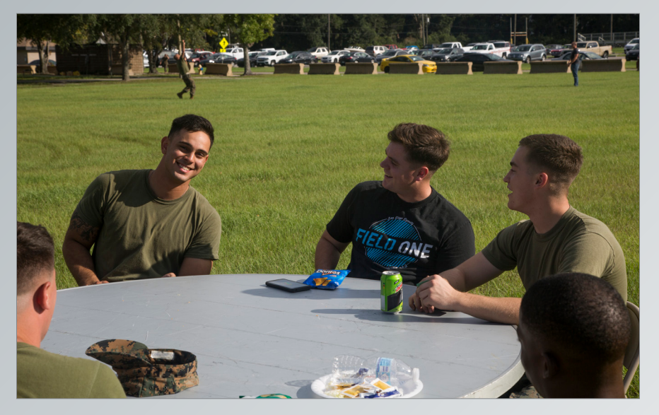
Marines and Sailors attended a "Barracks Bash" aboard Marine Corps Air Station Beaufort Oct. 11. The event was hosted by the Single Marine Program to show appreciation for the hard work and dedication of the Marines and Sailors who work to help Fightertown accomplish its mission.