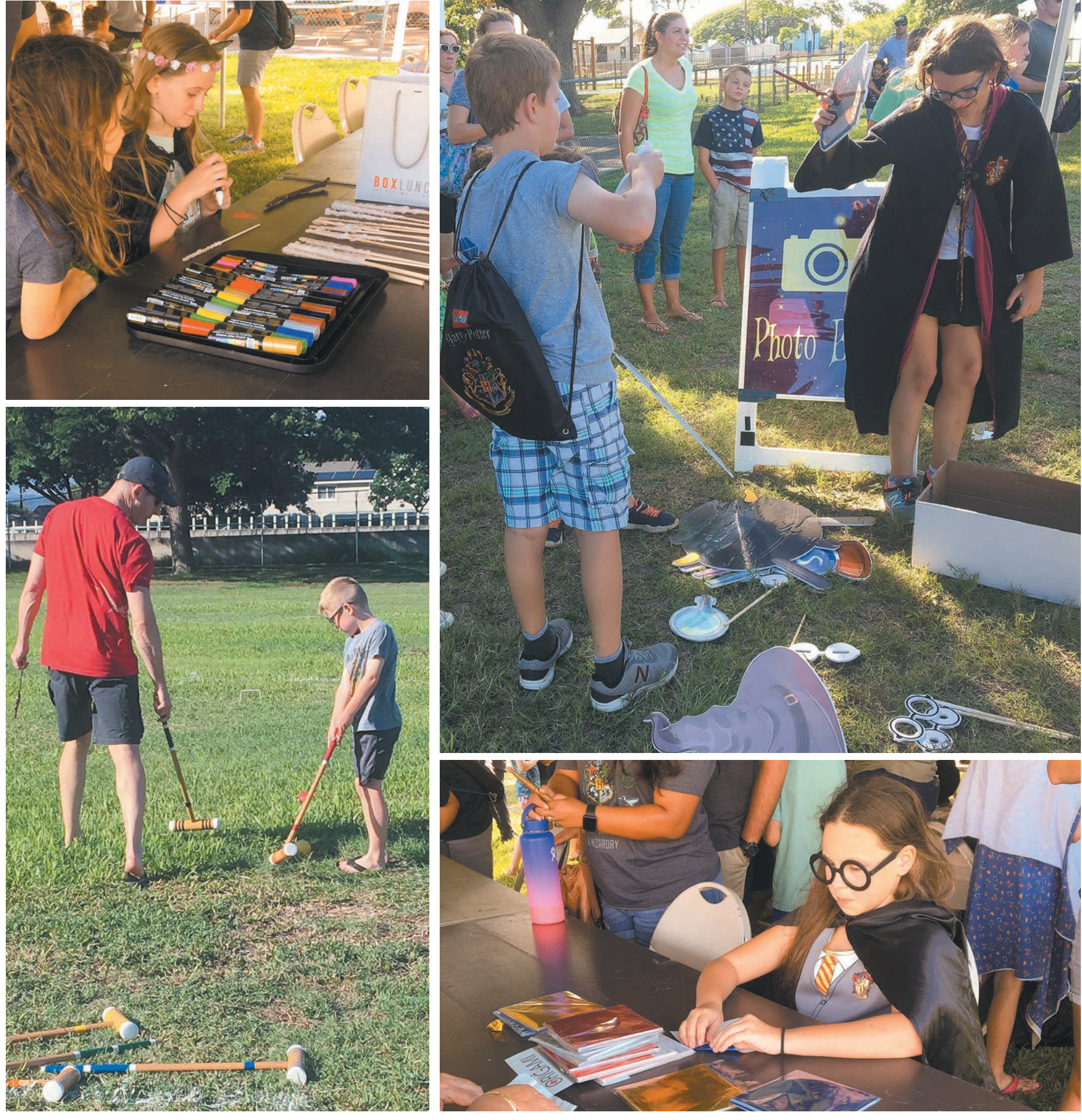
Families at the Day for Kids event, hosted by Joint Base Pearl Harbor-Hickam Morale, Welfare and Recreation, spent the day playing games, putting together arts and crafts and other activities, Sept. 15.

For more information about upcoming MWR events, visit https://www.greatlife-hawaii.com.