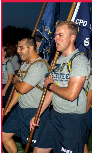
(Aug. 21, 2018) Chief petty officer selectees recite the Navy's fight song, 'Anchors Aweigh,' during CPO Heritage Days at the Hampton Roads Naval Museum.