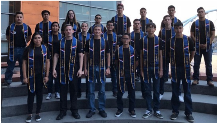
Tempe Company Future Soldiers pose outside of the Tempe Center for the Arts

Tempe Titans continued to get after mission, cultivate relations with our community partners and make it happen as we approach the close of FY18! This quarter, we supported a variety of community and Future Soldier events. From conducting mass Future Soldier Swear Ins with our ASU ROTC counterparts to strengthening our community relations and honoring our Future Soldiers with Tempe Community Salutes, Tempe Company's commitment to our community and dedication to mission success is indicative of our passion to our mission of recruiting the best and brightest young Americans to serve as Soldiers in our nation's Army. As the Arizona summer brings its usual mix of scorching heat, massive dust storms and monsoons, Tempe Company continues to excel as the top Company within the Battalion and one of the top ten companies in 5 th Brigade. We are still on glide path to meet our goal of ranking as one of the top five companies within the brigade at the close of the Fiscal Year, and eagerly look forward to representing Phoenix Battalion and 5 th Brigade as the "Best of the Midwest". We have a great team of young leaders who are ready to make our mission and close out FY 2018 with a bang!