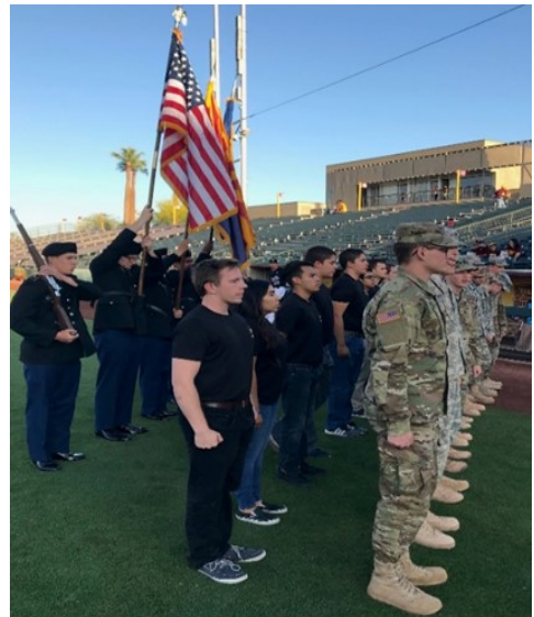
Tempe Company Future Soldiers and ASU ROTC Cadets prepare for a Swear In.