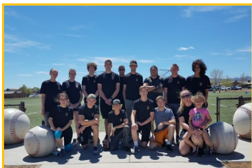
Prescott recruiters with their Future Soldiers at Pioneer Park

Recruiters from the Phoenix North Recruiting Company supported over 25 high school graduation events over the span of 12 days from 19 May to 3 June 2018. Future Soldiers and families welcomed the Army with open arms to support their sons and daughters during the ceremonies exhibit