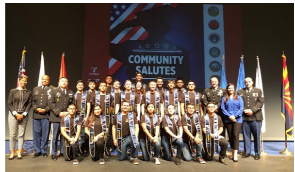
Tempe Company Recruiters stand proudly by their recognized Future Soldiers