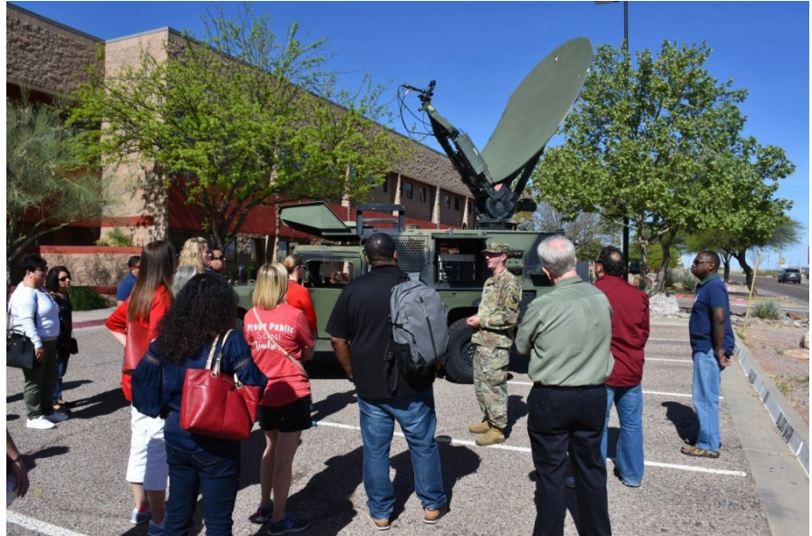
Attendees from the Phoenix Recruiting Battalion's Educators Tour receive a brief on systems maintenance, from a noncommissioned officer at the Military Intelligence School, April 11, Fort Huachuca, Ariz. The purpose of the two-day tour was to provide a comprehensive orientation and overview of Fort Huachuca for the 15 attendees, who included teachers, superintendents and school counselors from the battalion area of influence.