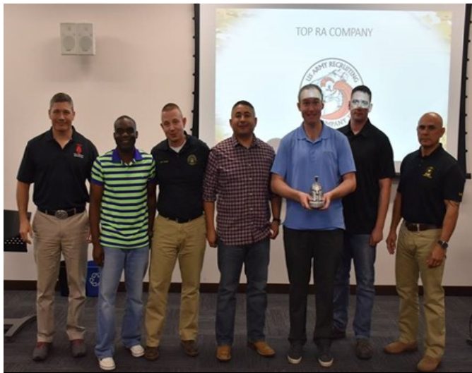
The Tempe Company Command Team is recognized as the Top Company in the Battalion for 3 rd QTR FY18