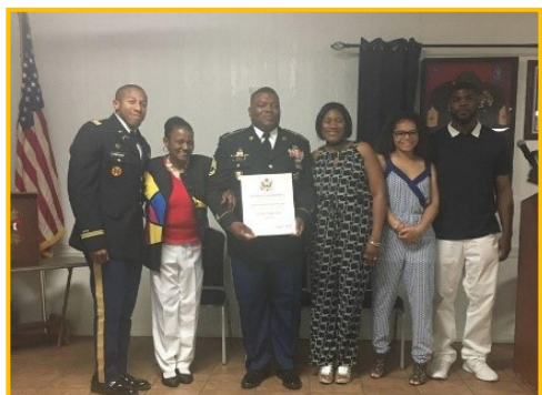
SFC Sides retired after 30 years of service