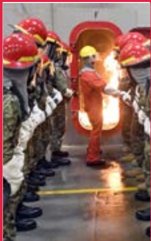
(Aug. 2, 2018) Naval Reserve Officers Training Corps (NROTC) midshipman candidates fight a fire in a simulated shipboard compartment in the USS Chief Recruit Fire Fighter Trainer at Recruit Training Command (RTC).