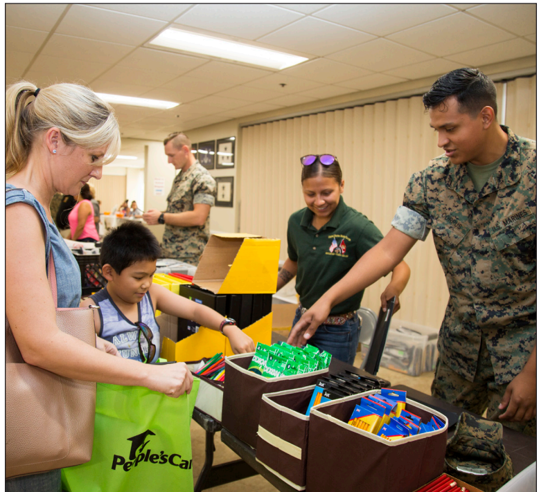
Marines volunteer to hand out donated school supplies to military families during the Back to School Brigade held at the Maj. James L. Day Conference Center aboard Marine Corps Logistics Base Barstow, Aug. 2.