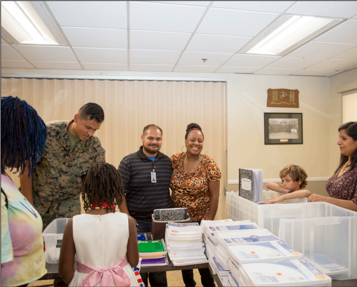
Marines, civilian personnel and volunteers assist families in selecting from a wide variety of school supplies during the Back to School Brigade event held at the Major Gen. James L. Day Conference Center aboard Marine Corps Logistics Base Barstow, Calif., Aug. 2.