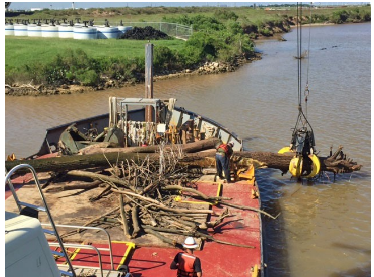
The SNELL crew hoists a sunken tree from a navigational channel.

"We have installed 90 mooring buoys so far and all of them are still on station and working properly. It has been many years since this type of work has been done for the Galveston District, and it has improved the operation and safety