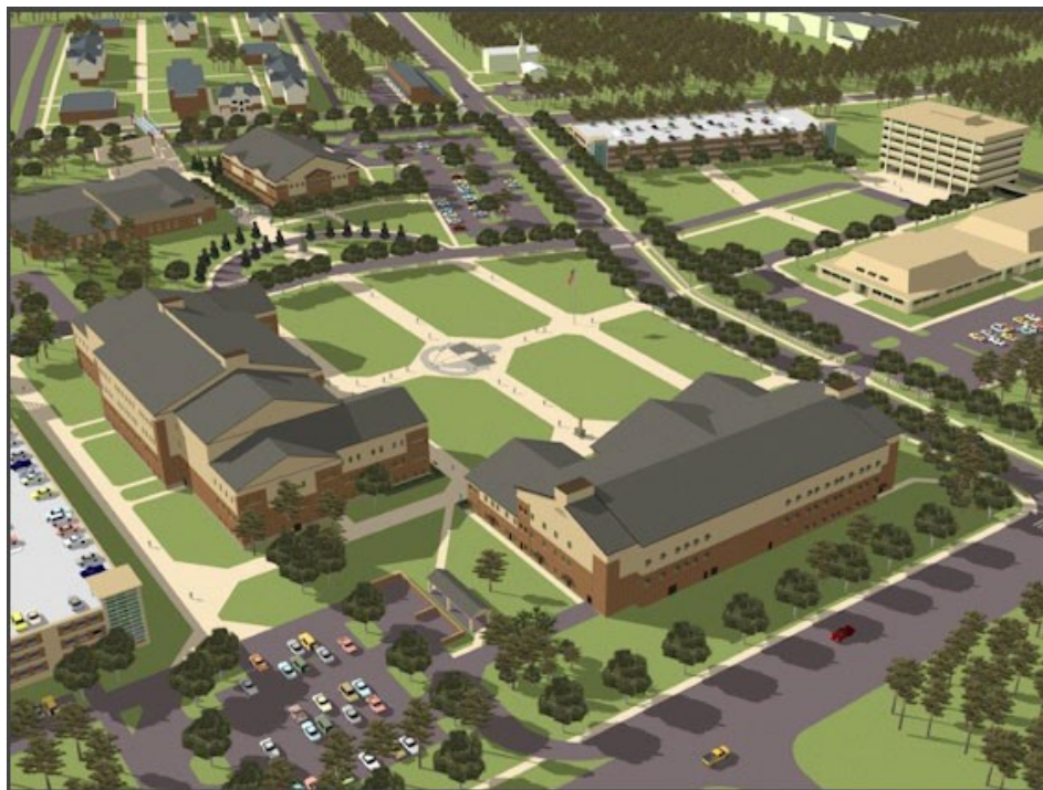
Artist rendition of the area near the newly-completed USASOC Language and Culture Center (center left) with additional buildings that are currently under construction (right).

What’s bringing the special operations community into a new