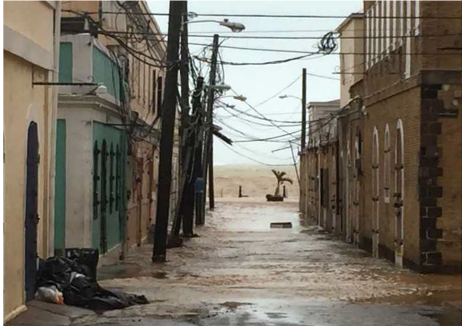
Hurricane Irma and Maria knocked out power throughout the U.S. Virgin Islands when it hit in September of last year.

that are part of Planning and Response Teams rotated throughout the U.S. Virgin Islands providing critical FEMA missions that were assigned to USACE such as: temporary blue roof, debris removal, critical public facilities, infrastructure assessments, and temporary power.