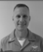
NAS Key West Command Chaplain

and that my words meant nothing if I didn’t back them up with my actions. This phrase was something my parents modeled as well. When I look back on my childhood, and even now in my adult years, my parents’ actions have been what I most remember. Now that I am a parent, my wife and I try to live this out as well but there are times that it can be harder than others.