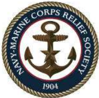
NAVY-MARINE CORPS RELIEF SOCIETY