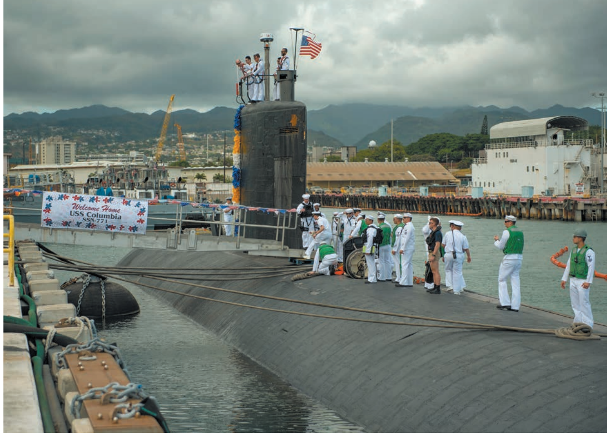
Sailors aboard the Los Angeles-class fast-attack submarine USS Columbia (SSN 771) prepare to moor at the historic submarine piers at Joint Base Pearl Harbor-Hickam following a six-month western Pacific deployment, June 6.

Throughout the deployment, 10 Columbia Sail-