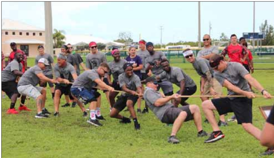
Fighter Squadron Composite (VFC) 111 above, and Coast Guard Sector Key West, at right, battle it out in tug-of-war.