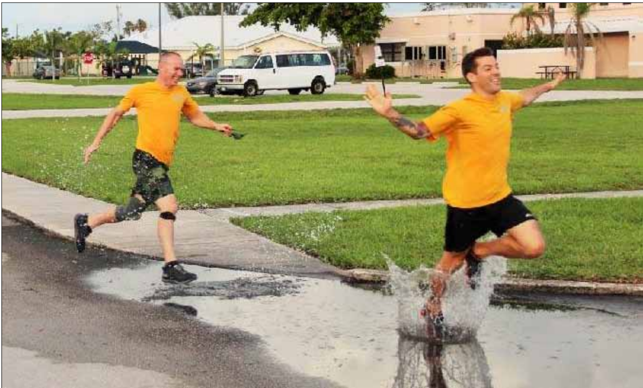
Sailors competing in the Command Challenge run take a moment to enjoy a run through a puddle.