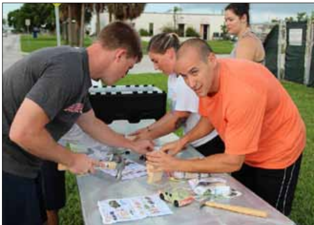
Team members, above, build a Home Depot Humvee kit during a competition at the Armed Forces Command Challenge June 1. Another competition, below, involved putting a puzzle together faster than the other competitors.

West, Saint Leo University Key West Center, Waste Management - Key West, FL, NAS Key West Homes, Key West Military Affairs Committee, Navy League Key West Council, Southernmost VFW Post 3911 and the Key West Area CPOA.