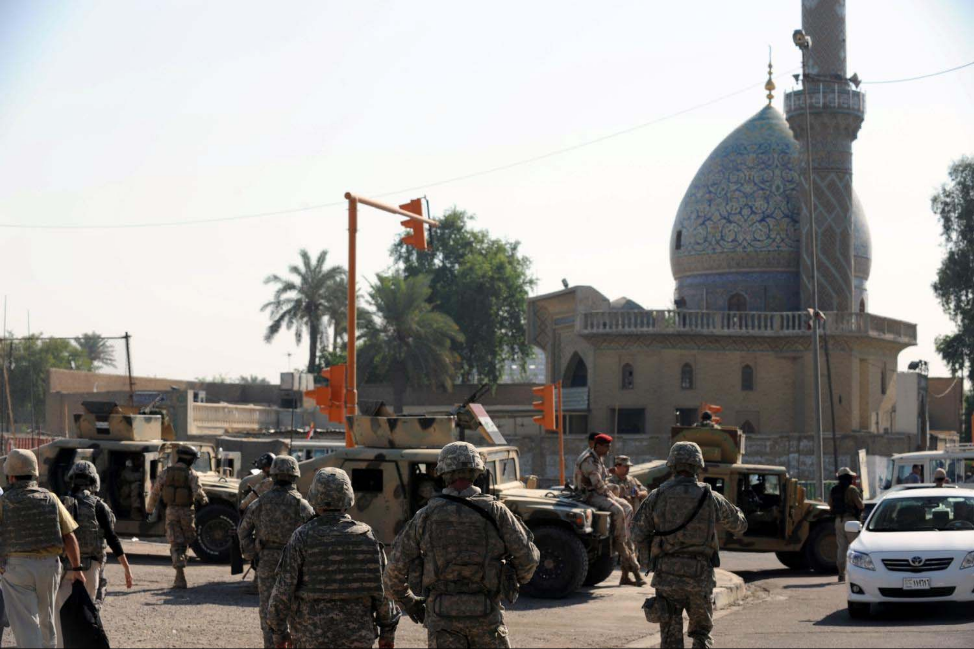
U.S. Soldiers from the 2nd Stryker Brigade Combat Team, 25th Infantry Division, Provincial Reconstruction Team, escort U.S. State Department officials back to their vehicles at the end of a meeting with Baghdad Council members while Iraqi soldiers provide security around the perimeter in Baghdad, Iraq, Nov. 06, 2008. 081106-A-5493S-041