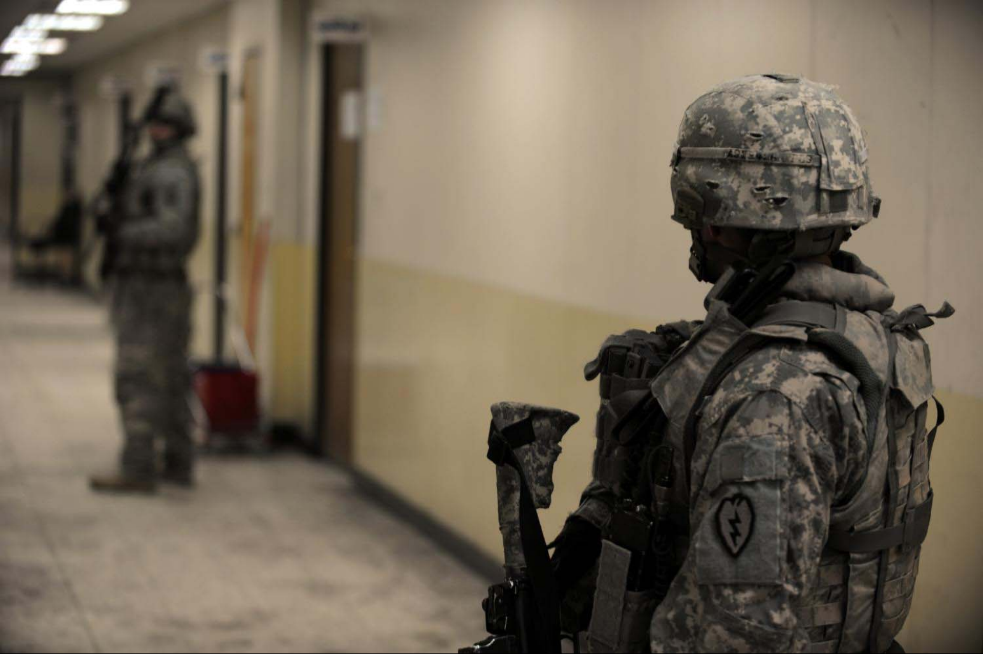
U.S. Soldiers from the 2nd Stryker Brigade Combat Team, 25th Infantry Division, Provincial Reconstruction Team, provide security outside a meeting with U.S. State Department officials in the city of Baghdad, Iraq, Nov. 06, 2008.

081106-A-5493S-019