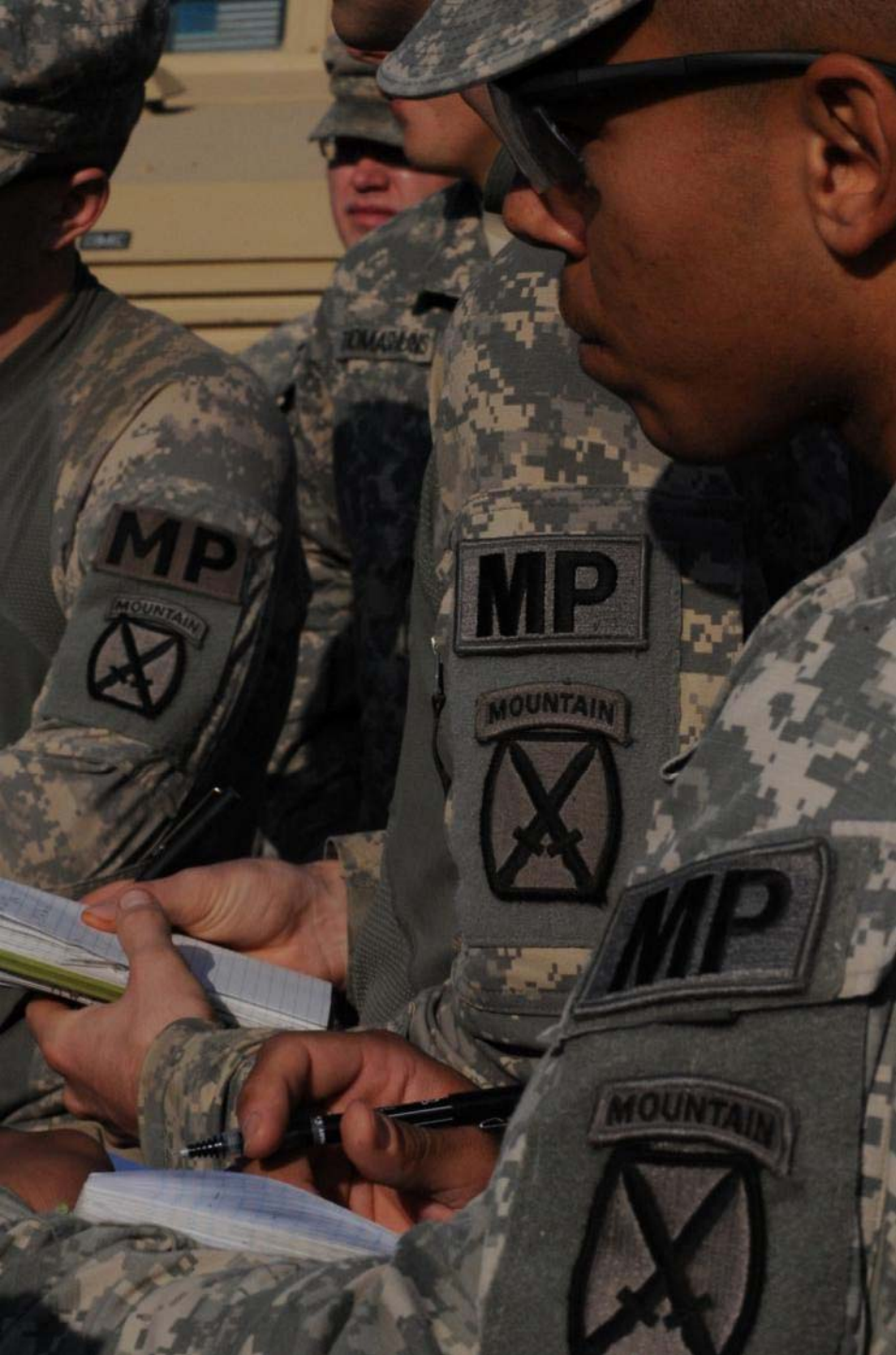
U.S. Army Military Policemen of Headquarters Company, Brigade Special Troops Battalion, 4th Brigade Combat Team, 10th Mountain Division, take notes during a convoy briefing at Forward Operating Base Loyalty, in Beladiyat, eastern Baghdad, Iraq, on Nov. 6, 2008. The Soldiers are supporting U.S. Air Force Explosive Ordnance Disposal personnel participating in Operation Baghdad Hawk.

081106-A-4676S-044