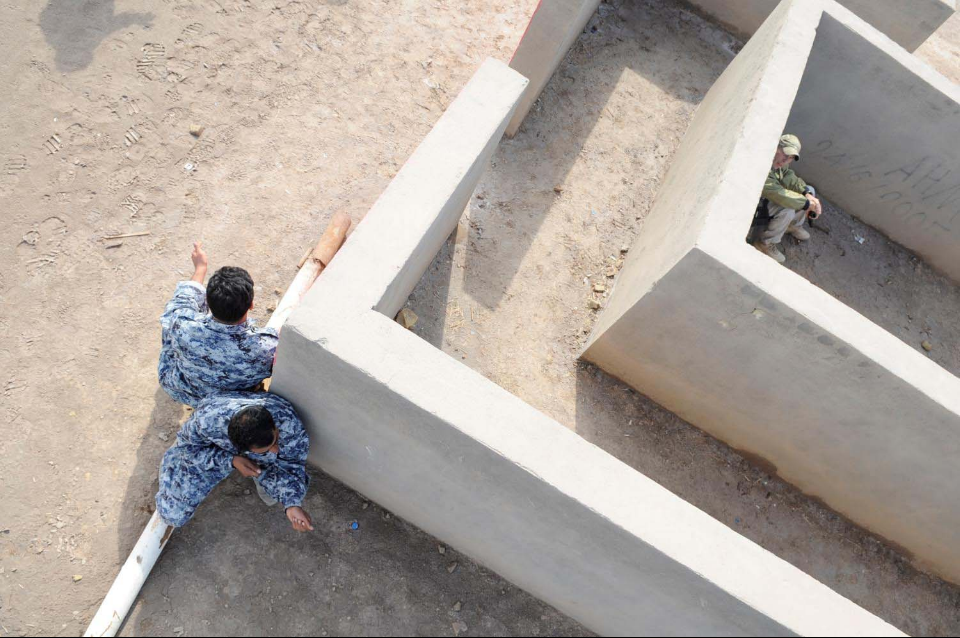
Iraqi police officers wait for orders to clear a training house during a training scenario at the Iraqi Police Academy, on Forward Operating Base Delta, in Al Kut, Iraq, Nov. 5, 2008. The Iraqi police are taught proper protocol and tactics in patrolling the streets of Al Kut, Iraq.

081105-F-4860D-029