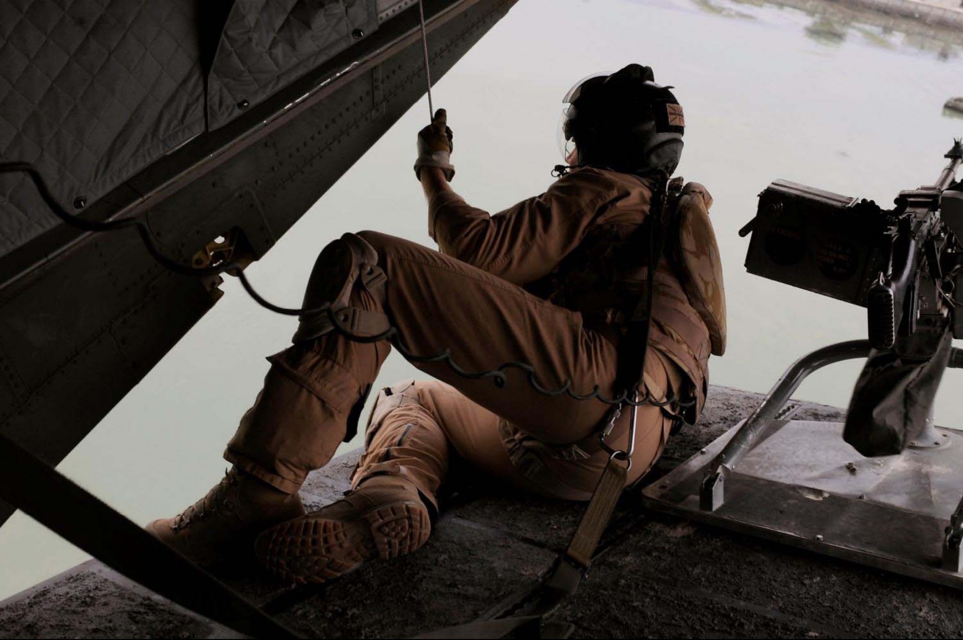
The Royal Air Force gunner of a Merlin HC3 cargo helicopter, looks for possible threats while on flight over the city of Basra, Iraq, on Nov. 6, 2008.