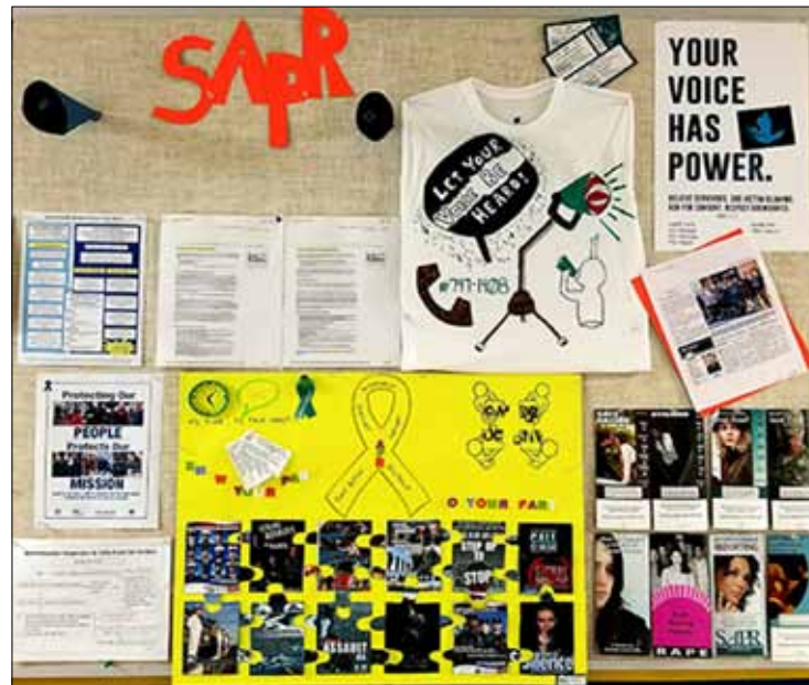
Fighter Squadron Composite (VFC) 111. is the first to enter the Unit SAPR Bulletin Board Challenge.

SAPR Sports Day is 9 a.m. - 1 p.m. at Sigsbee Field; everyone is encouraged to wear teal. Commands will compete in various games, followed by a barbecue.