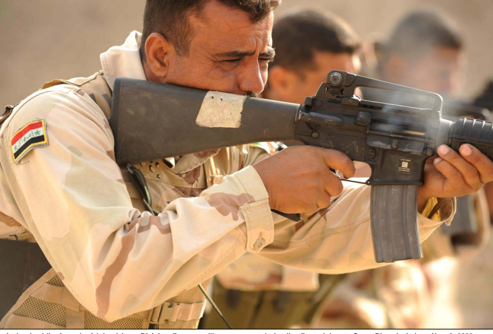
An Iraqi soldier from the 8th Iraqi Army Division, fires at a silhouette target during live fire training on Camp Diwaniyah, Iraq, Nov. 3, 2008. These exercises are in preparation for another live fire exercise where they will combine all the skills they have learned.