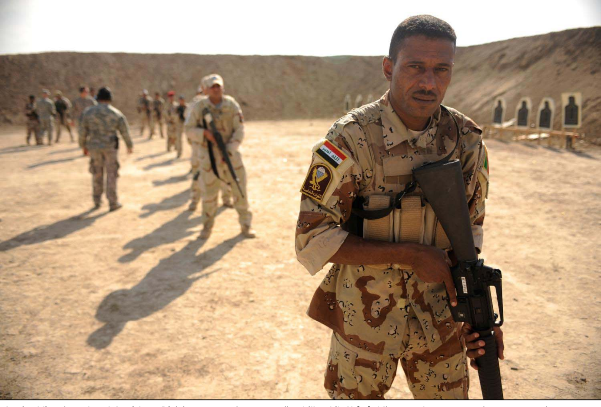
Iraqi soldiers from the 8th Iraqi Army Division, prepare for react to fire drills while U.S. Soldiers watch to ensure safe range operation on Camp Diwaniyah, Iraq, Nov. 3, 2008. U.S. Soldiers train with the Iraqi Army to provide them the skills necessary to defend their country.