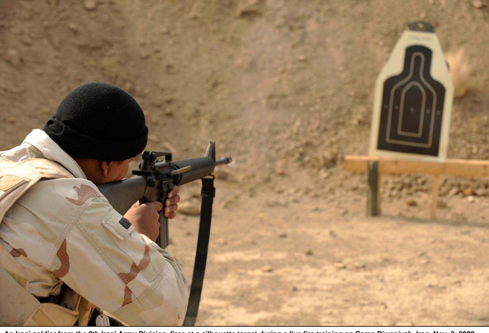
An Iraqi soldier from the 8th Iraqi Army Division, fires at a silhouette target during a live fire training on Camp Diwaniyah, Iraq, Nov. 3, 2008. These exercises are in preparation for another live fire exercise where they will combine all the skills they have learned.