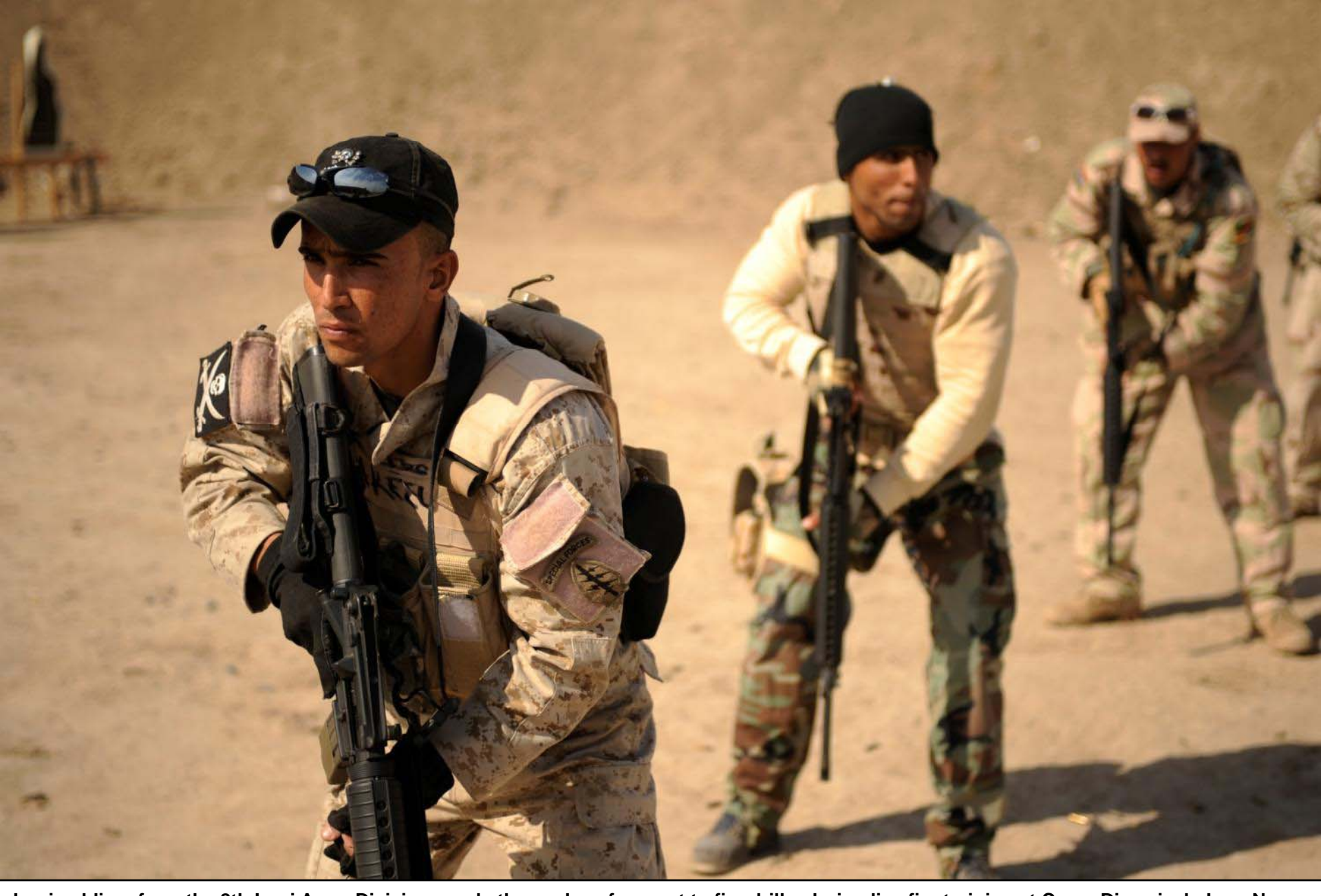
Iraqi soldiers from the 8th Iraqi Army Division, ready themselves for react to fire drills, during live fire training at Camp Diwaniyah, Iraq, Nov. 3, 2008. Iraqi soldiers practice drills constantly in order to be ready in case of a real-world situation.