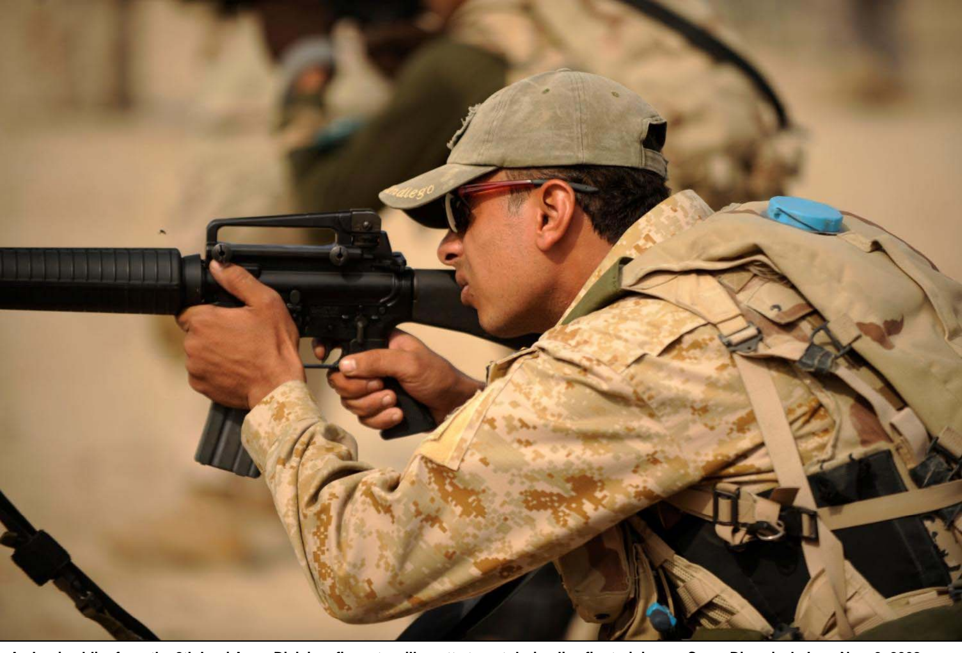
An Iraqi soldier from the 8th Iraqi Army Division, fires at a silhouette target during live fire training on Camp Diwaniyah, Iraq, Nov. 3, 2008. These exercises are in preparation for another live fire exercise where they will combine all the skills they have learned.