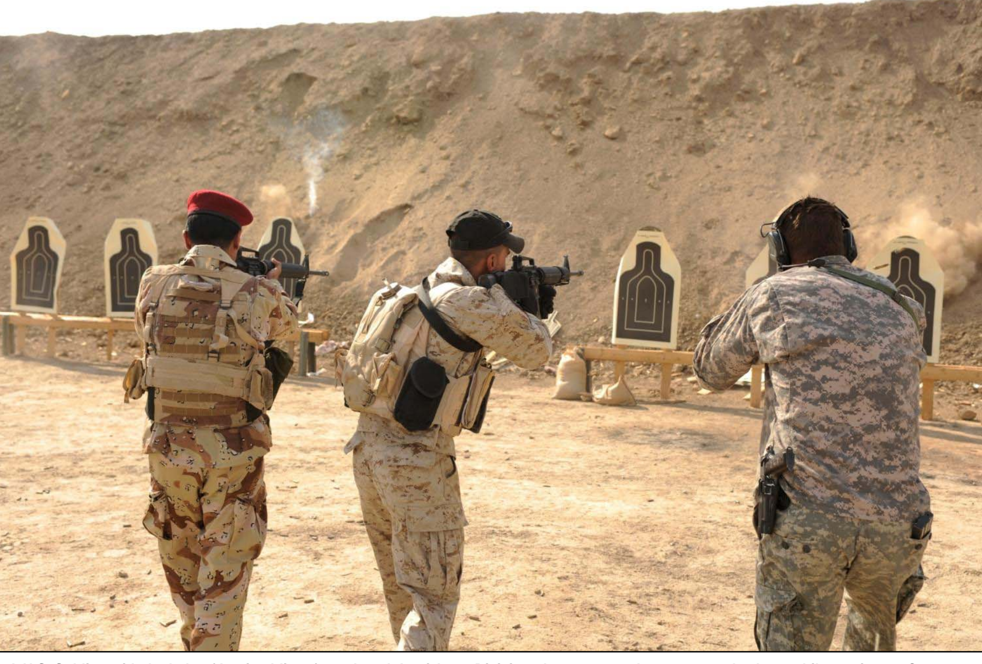
A U.S. Soldier, with the help of Iraqi soldiers from the 8th Iraqi Army Division, demonstrates how to properly shoot while moving on Camp Diwaniyah, Iraq, Nov. 3, 2008. Iraqi soldiers train with U.S. Soldiers so that they can be prepared to take over the security of their country.