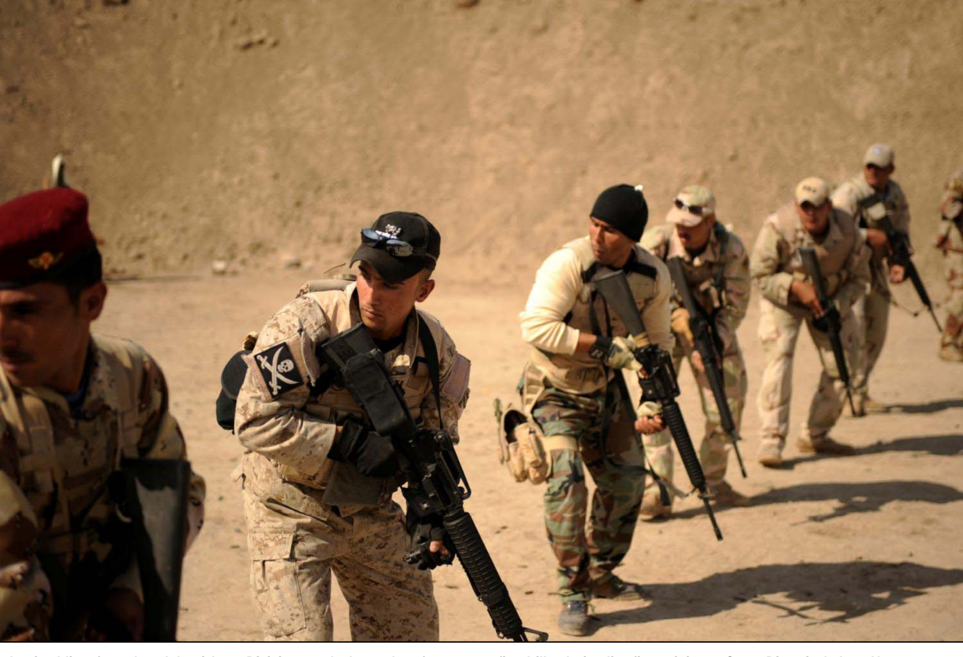
Iraqi soldiers from the 8th Iraqi Army Division, ready themselves for react to fire drills, during live fire training at Camp Diwaniyah, Iraq, Nov. 3, 2008. Iraqi soldiers practice drills constantly in order to be ready in case of a real-world situation.