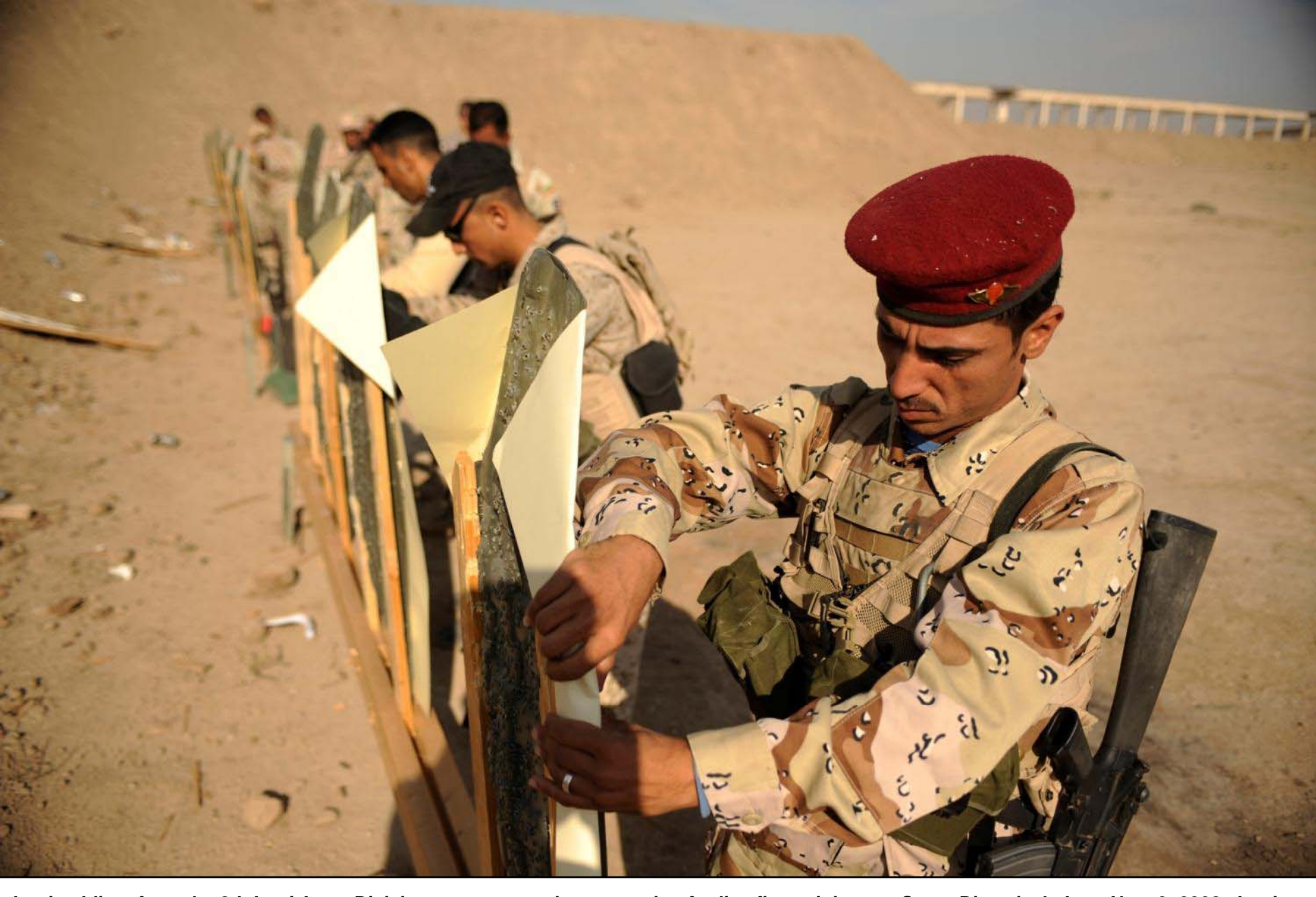
Iraqi soldiers from the 8th Iraqi Army Division, post targets in preparation for live fire training, on Camp Diwaniyah, Iraq, Nov. 3, 2008. Iraqi soldiers are training to improve marksmanship as well as learn how to react to contact.