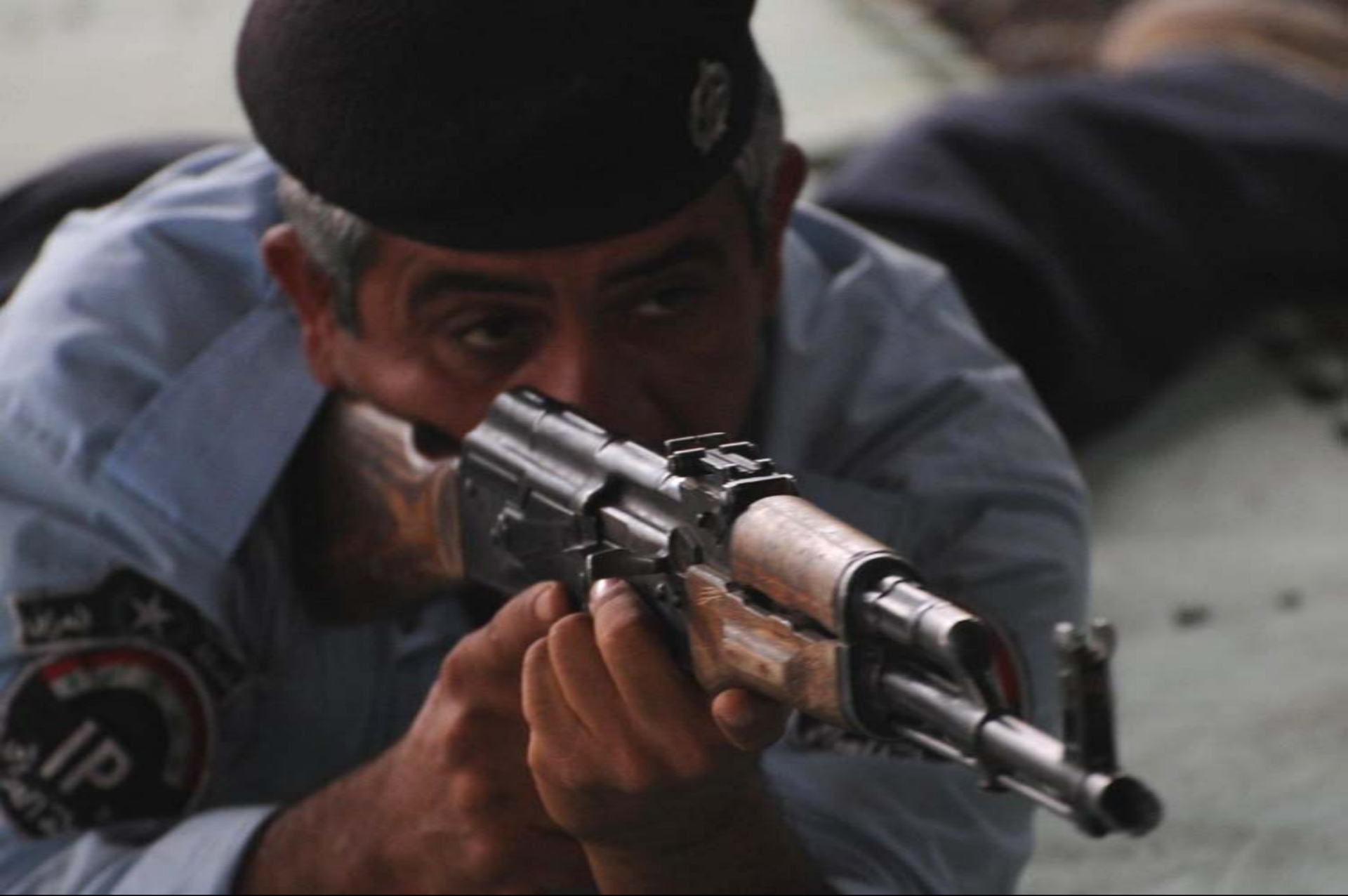
An Iraqi Police instructor demonstrates proper technique for firing a rifle in the prone position to Iraqi policemen during the Iraqi Police Leadership Course conducted at the Iraqi police patrol station in Karada, eastern Baghdad, on Oct. 29, 2008.