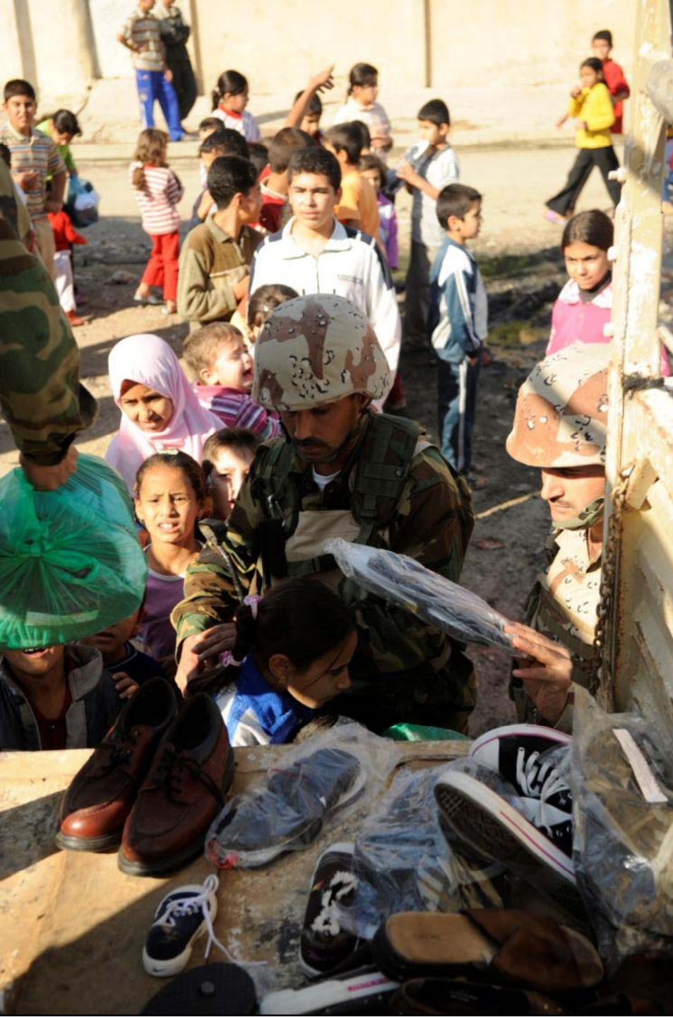
Iraqi soldiers from 3rd Battalion, 5th Brigade, 2nd Iraqi Army Division, conduct a "Good Neighbor Mission" passing out bags of clothes, shoes and soccer balls to children in Palestine, Iraq, Nov. 1, 2008.

081101-F-5855M-156