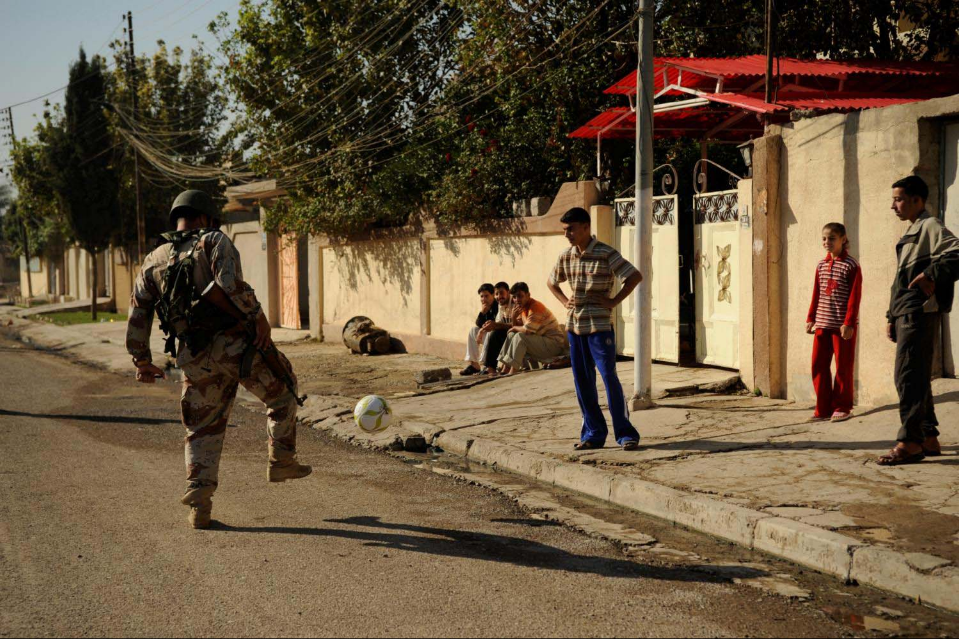
An Iraqi soldier from 3rd Battalion, 5th Brigade, 2nd Iraqi Army Division, plays soccer with children during a "Good Neighbor Mission" in Palestine, Iraq, Nov. 1, 2008. The purpose of the mission is to hand out bags of clothes, shoes and soccer balls to the children in that area.