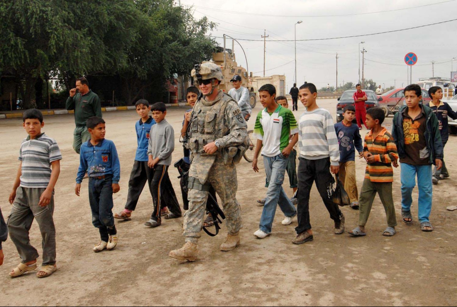
A U.S. Soldier from the 230th Military Police Company, 793rd Military Police Battalion, 18th Military Police Brigade Combat Team, walks with children outside the Jabella market in Jabella, Iraq, on October 31, 2008.

081031-N-1509W-035