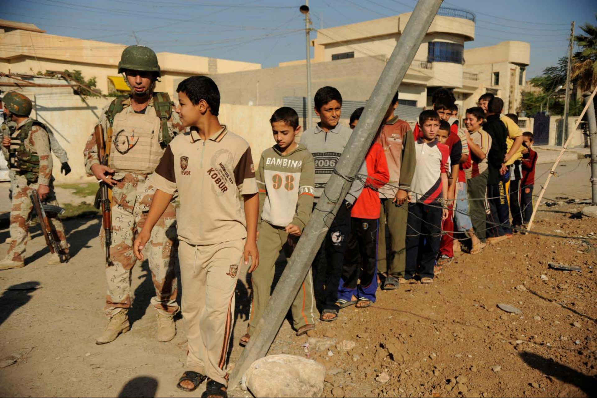
Iraqi children form a line to wait for hand-outs from Iraqi soldiers of the 3rd Battalion, 5th Brigade, 2nd Iraqi Army Division, in Palestine, Iraq, Nov. 1, 2008. The Iraqi soldiers conduct "Good Neighbor Missions" passing out bags of clothes, shoes and soccer balls to children.