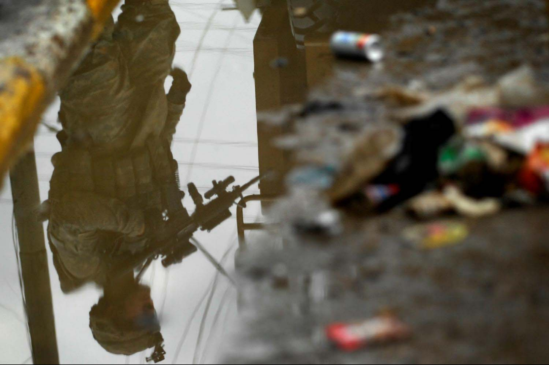
A U.S. Soldier attached to 2nd Battalion, 4th Infantry Regiment, 1st Brigade Combat Team, 4th Infantry Division, patrols along side Iraqi soldiers on Oct. 29, 2008, in the Doura community of southern Baghdad, Iraq.