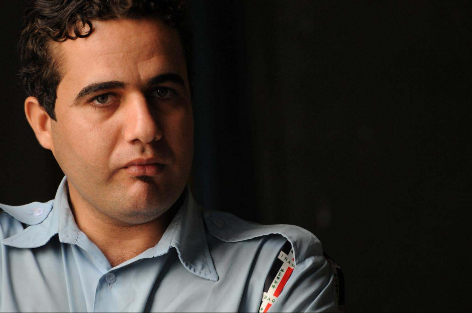
An Iraqi Policeman watches rifle and pistol marksmanship training being conducted during the Iraqi Police Leadership Seminar at the Iraqi police patrol station in Karada, eastern Baghdad, on Oct. 29, 2008.

081029-A-4676S-184