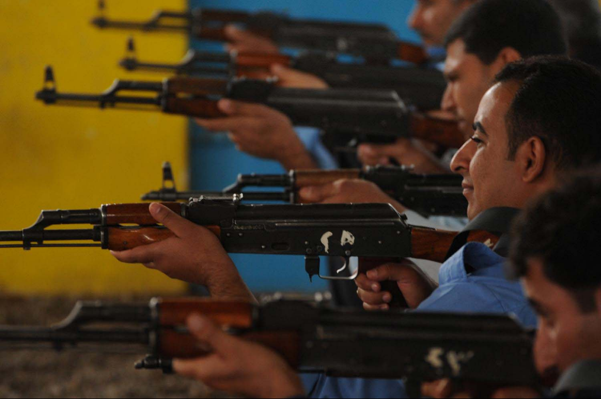
Iraqi Policemen conduct rifle drills while participating in rifle and pistol marksmanship training during the Iraqi Police Leadership Course conducted at the Iraqi police patrol station in Karada, eastern Baghdad, on Oct. 29, 2008.

081029-A-4676S-128