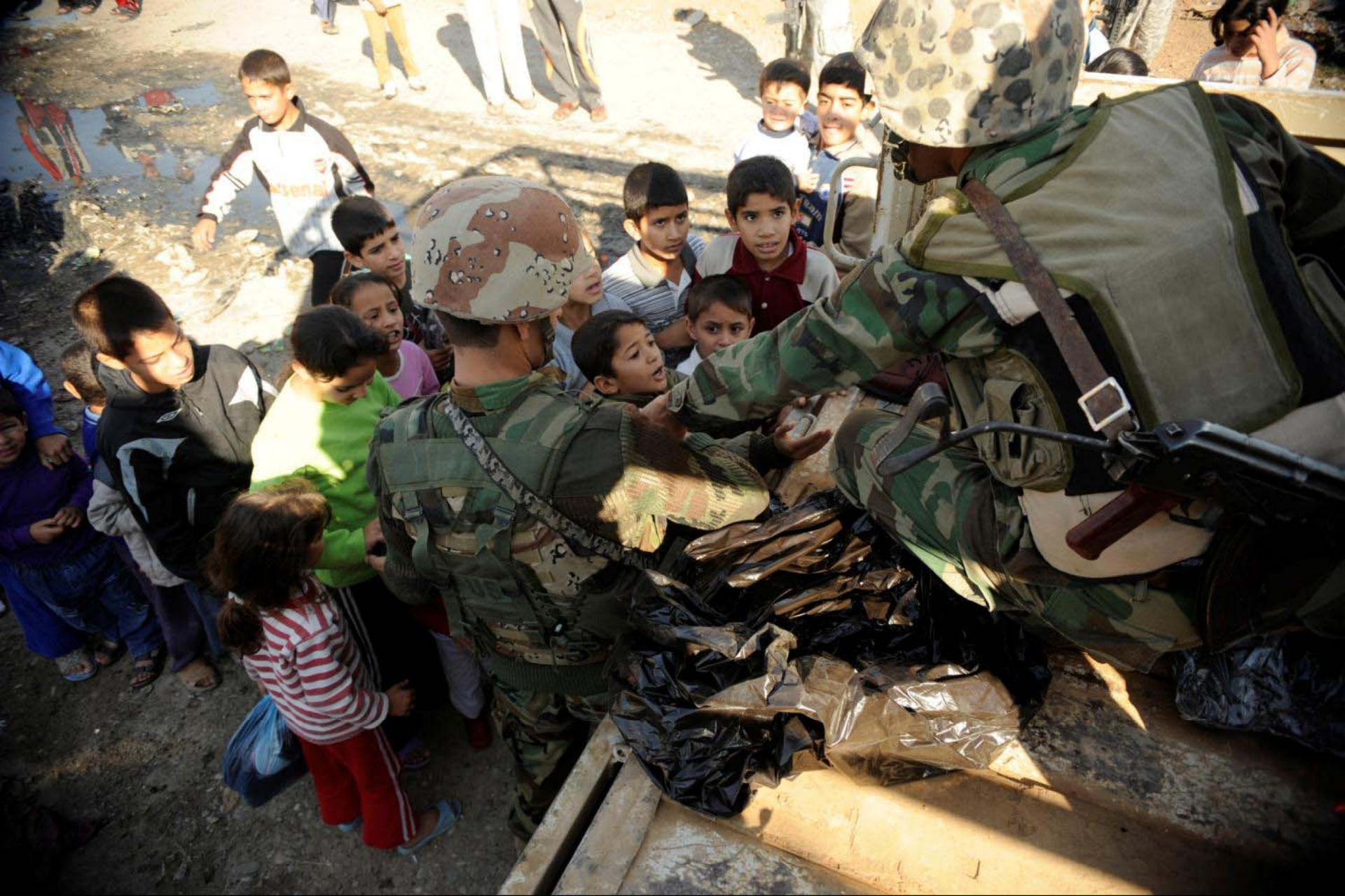
Iraqi soldiers from 3rd Battalion, 5th Brigade, 2nd Iraqi Army Division, conduct a "Good Neighbor Mission" passing out bags of clothes, shoes and soccer balls to children in Palestine, Iraq, Nov. 1, 2008.

081101-F-5855M-143