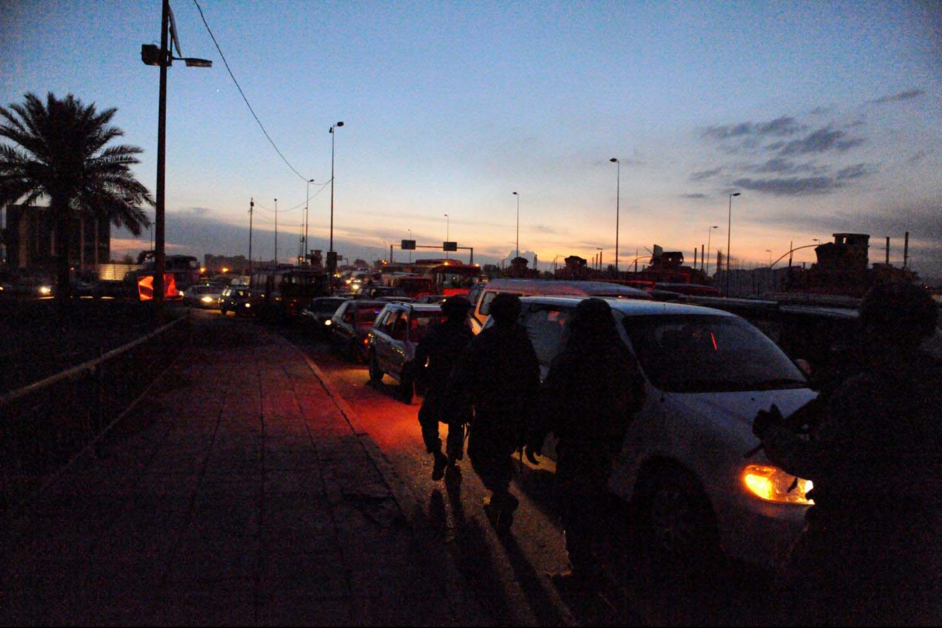
U.S. Soldiers from the Command Security Detachment, 3rd Brigade Combat Team, 4th Infantry Division, stop by a check point in the city of Baghdad, on Oct. 30, 2008. The U.S. Soldiers like to check up on the Iraqi army manning the post to see if they need supplies or equipment.

081030-A-6851P-007