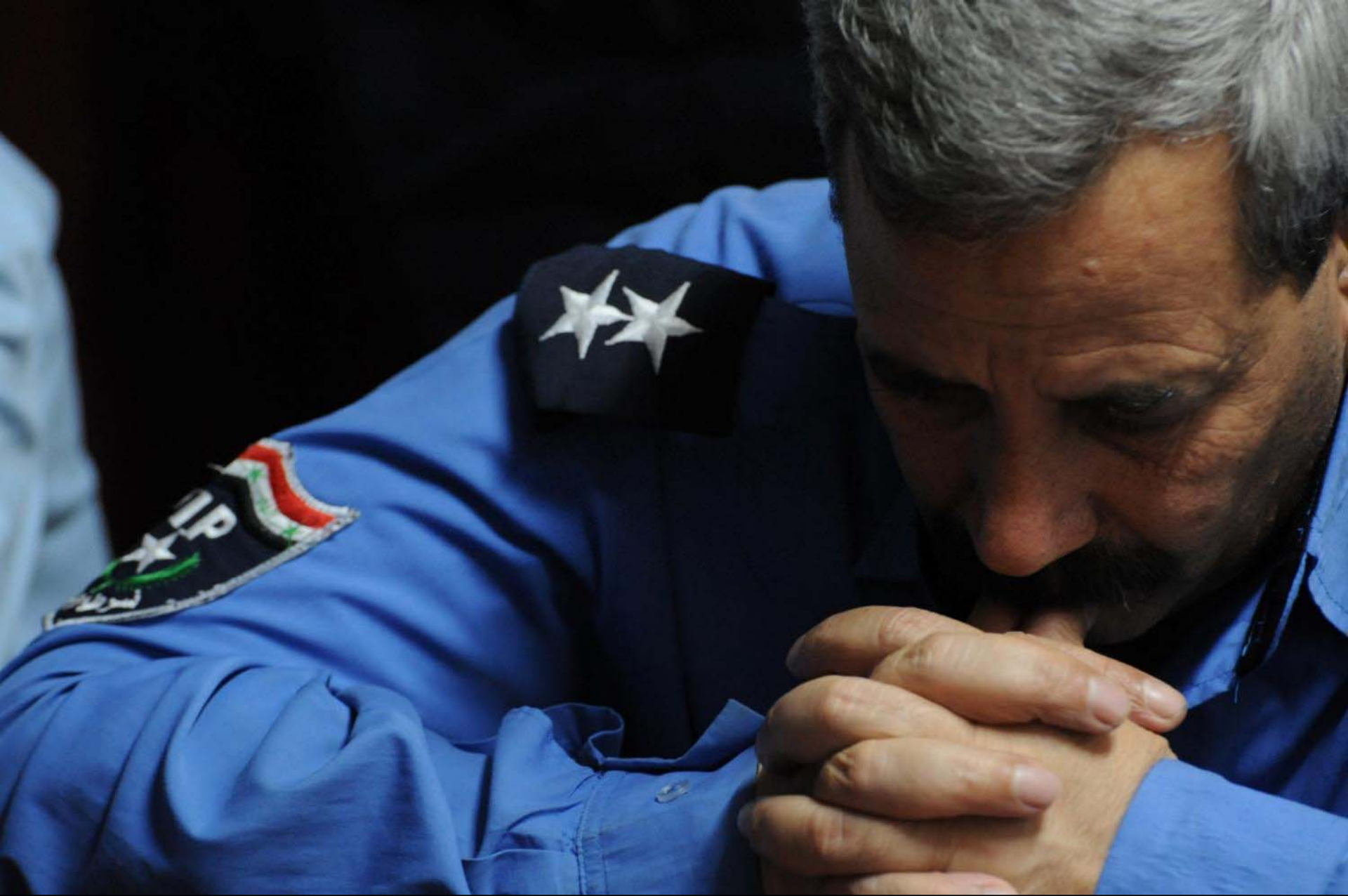
An Iraqi Policeman reflects on training for conducting high risk traffic stops at the Joint Security Station Al Khansa, in Muhallah 755, Fedaliyah, eastern Baghdad, on Oct. 30, 2008.