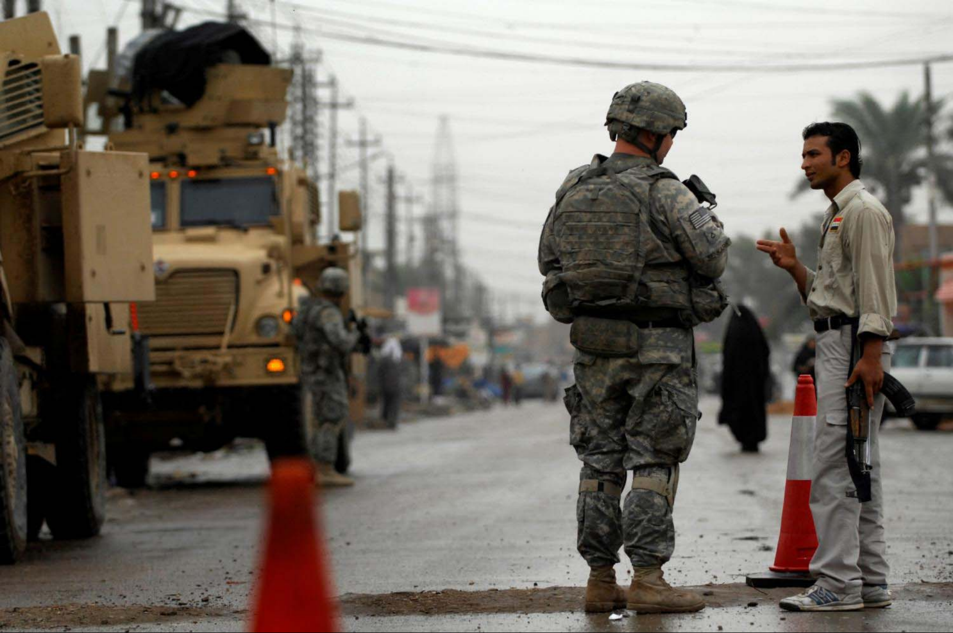
A member of the Sons of Iraq meets with a U.S. Soldier attached to 2nd Battalion, 4th Infantry Regiment, 1st Brigade Combat Team, 4th Infantry Division, at a security checkpoint in the Doura community of southern Baghdad, Iraq.

081229-N-1810F-019