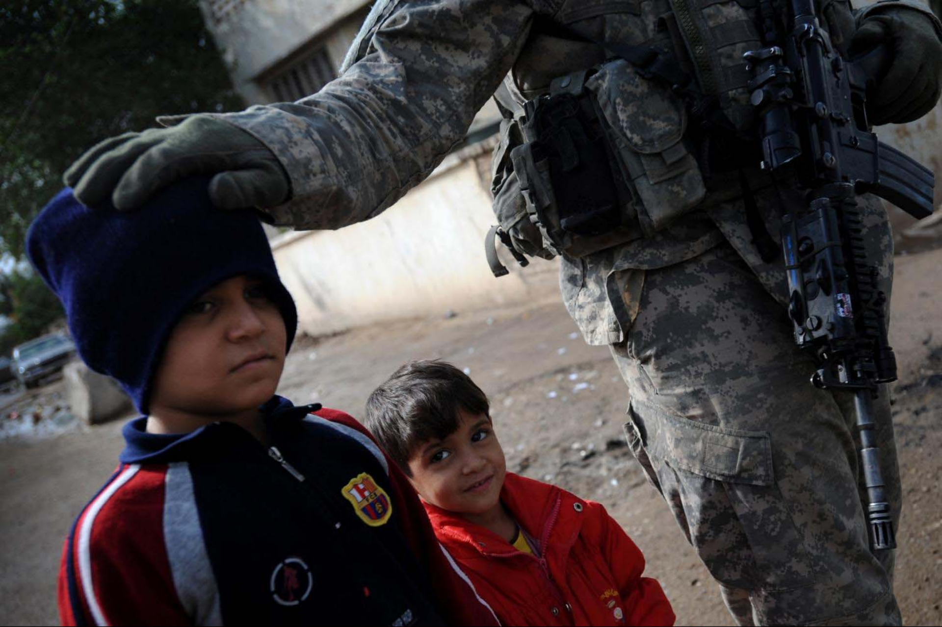
A U.S. Soldier attached to 2nd Battalion, 4th Infantry Regiment, 1st Brigade Combat Team, 4th Infantry Division, greets an Iraqi child, on Oct. 29, 2008, in the Doura community of southern Baghdad, Iraq.

081229-N-1810F-033