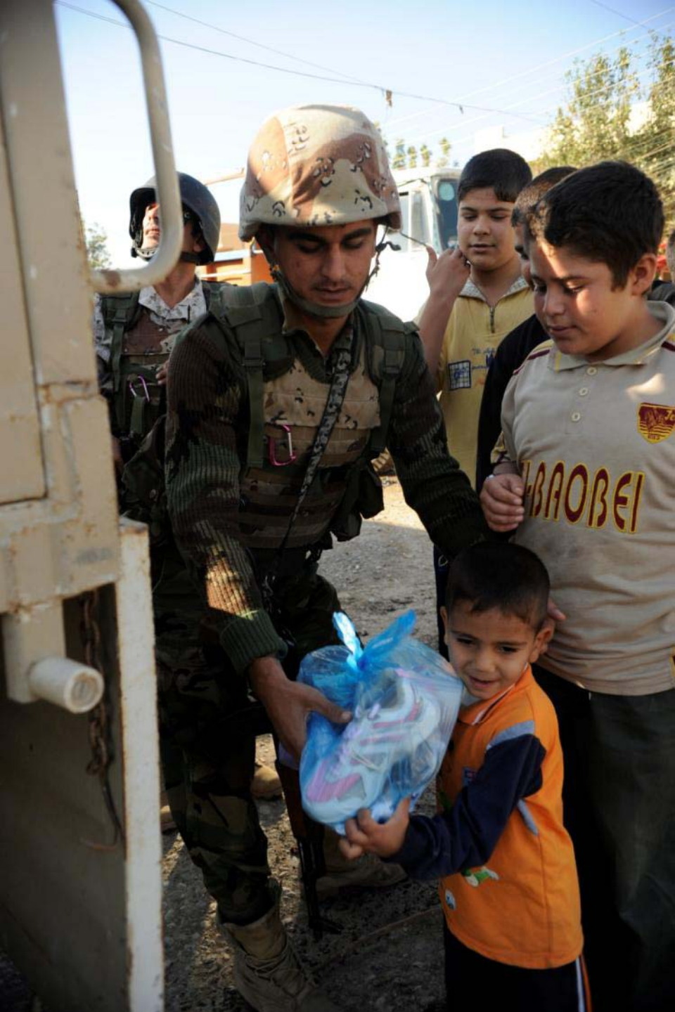
An Iraqi soldier from 3rd Battalion, 5th Brigade, 2nd Iraqi Army Division, passes out bags of clothes and shoes to children during a "Good Neighbor Mission" in Palestine, Iraq, Nov. 1, 2008.

081101-F-5855M-022