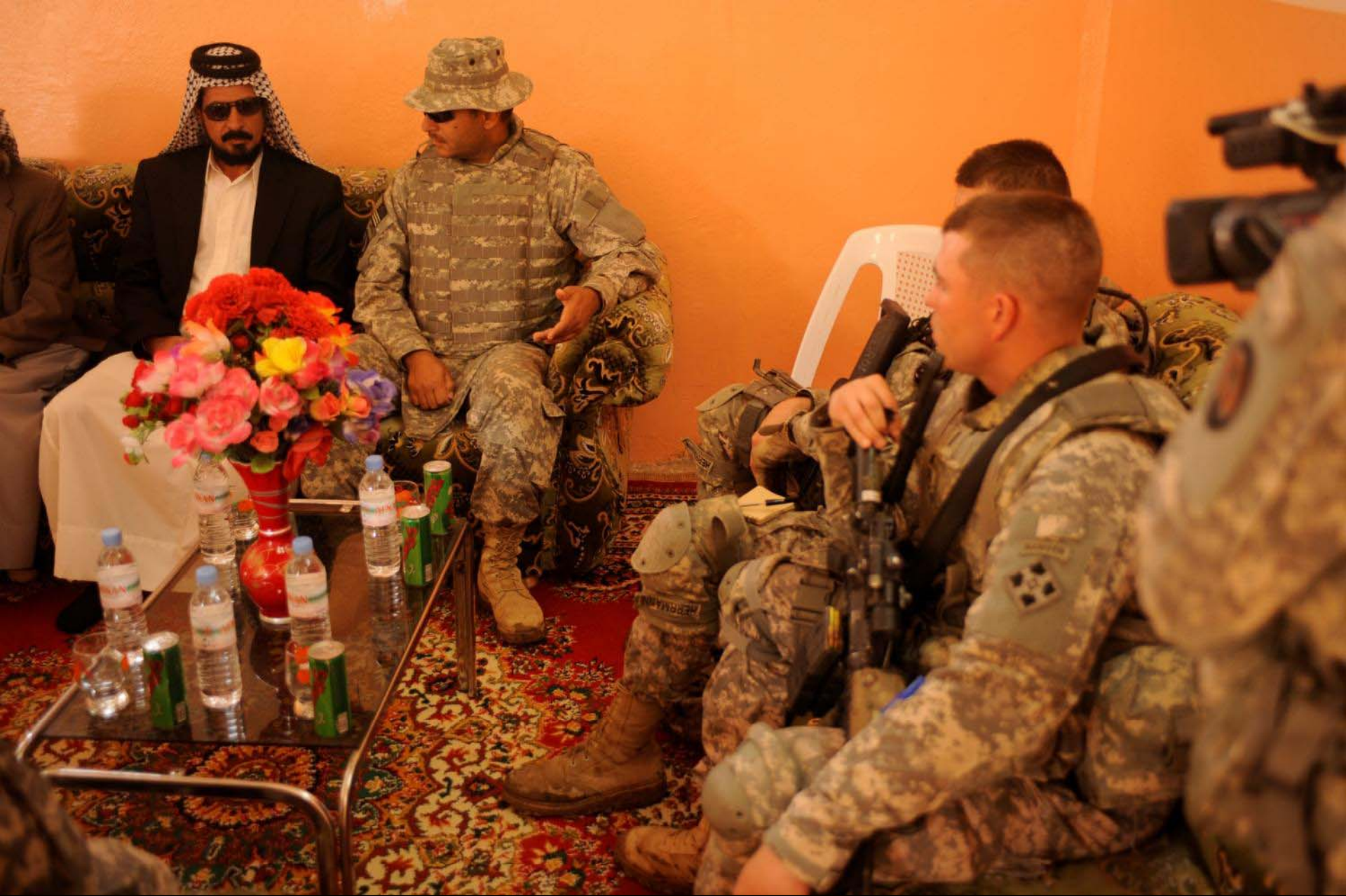
U.S. Army 1st Lt. Brian Galneau , from the 2nd Infantry Battalion, 8th Infantry Regiment, meets with a local leader during a patrol of Hamza, Iraq, Oct. 29, 2008. Lt. Galneau met to discuss the humanitarian needs of Hamza.