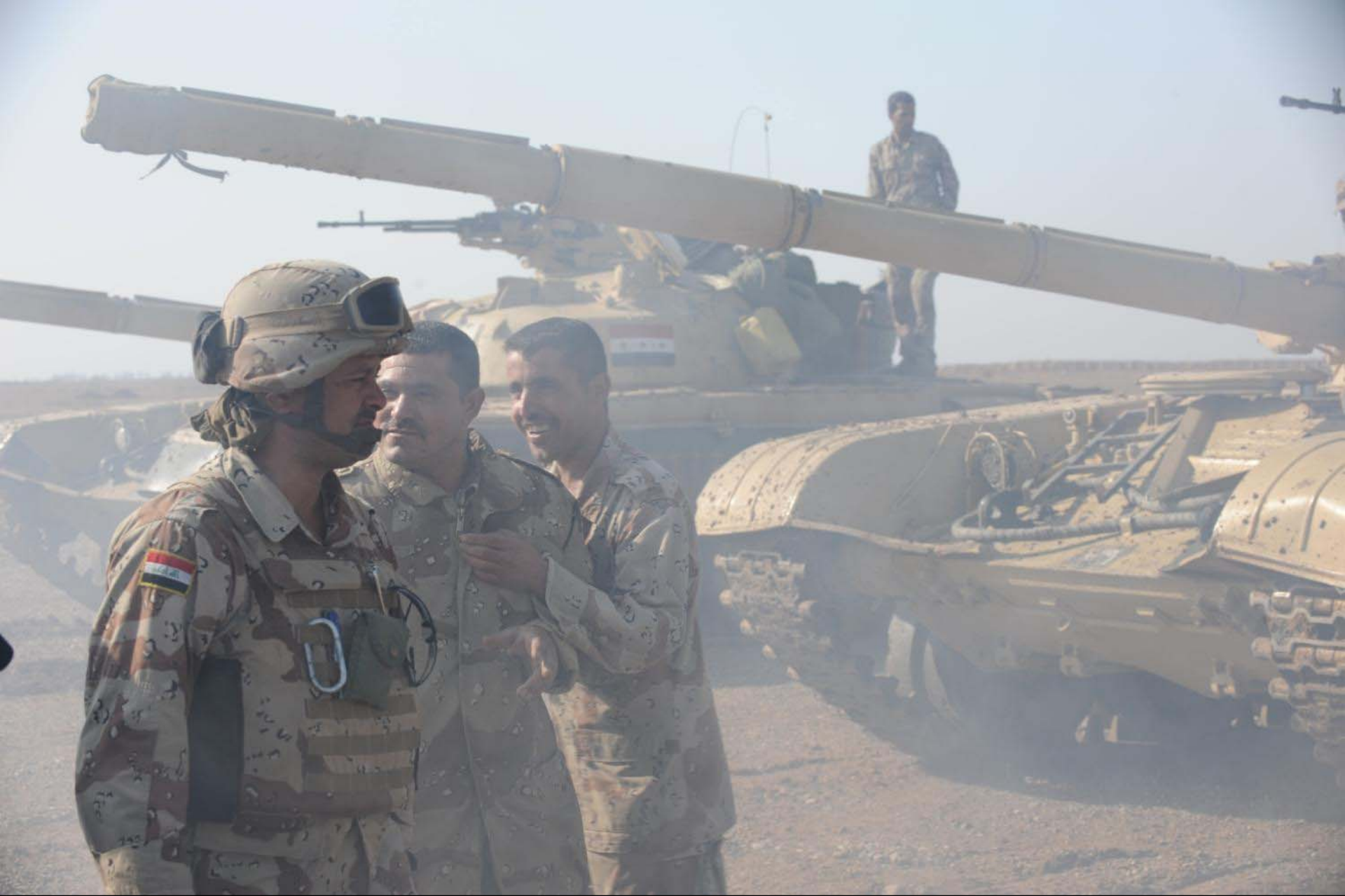
Iraqi soldiers from 2nd Battalion, 34th Brigade, 9th Iraqi Army Division (Mechanized), off-load their T-72 tanks at the Besmaya Gunnery Range, 27 Oct. 2008.

081027-A-5493S-119