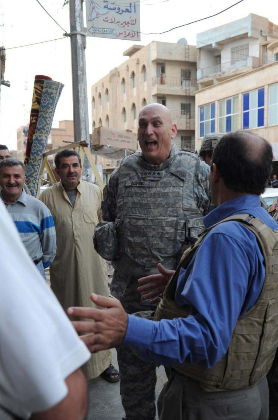
Gen. Ray Odierno, Commanding General, Multi-National Forces-Iraq, shares a laugh with an Iraqi citizen of Samarra, Iraq, during his visit here on Oct. 29, 2008.

081029-A-5049R-128