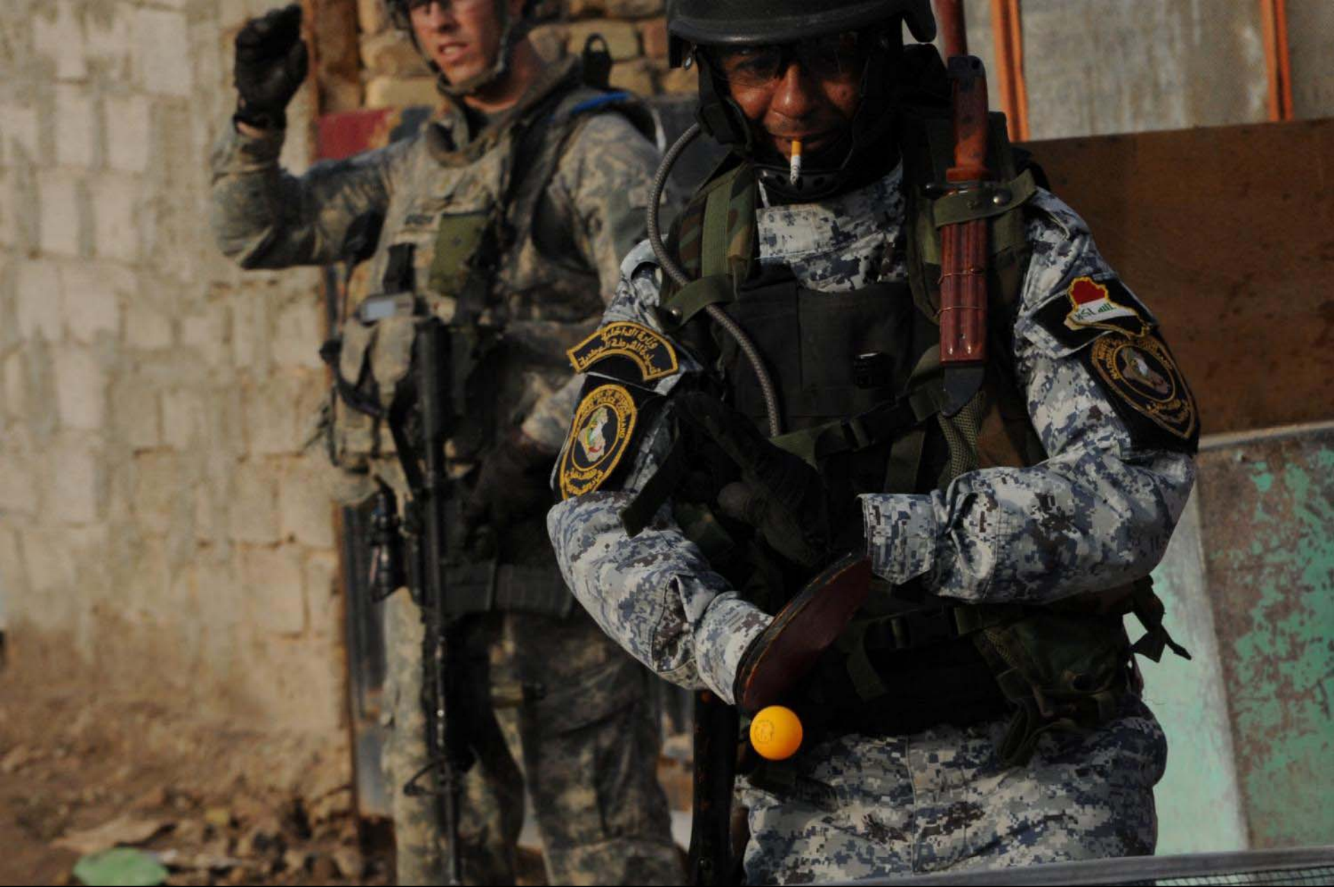
An Iraqi National Policeman stops to play table tennis with local residents during Operation Iron H1018, in Muhallah 741, Al Amin, eastern Baghdad, on Oct. 28, 2008. Iraqi National Police and U.S. Soldiers are working with local residents to locate and capture suspected insurgents.