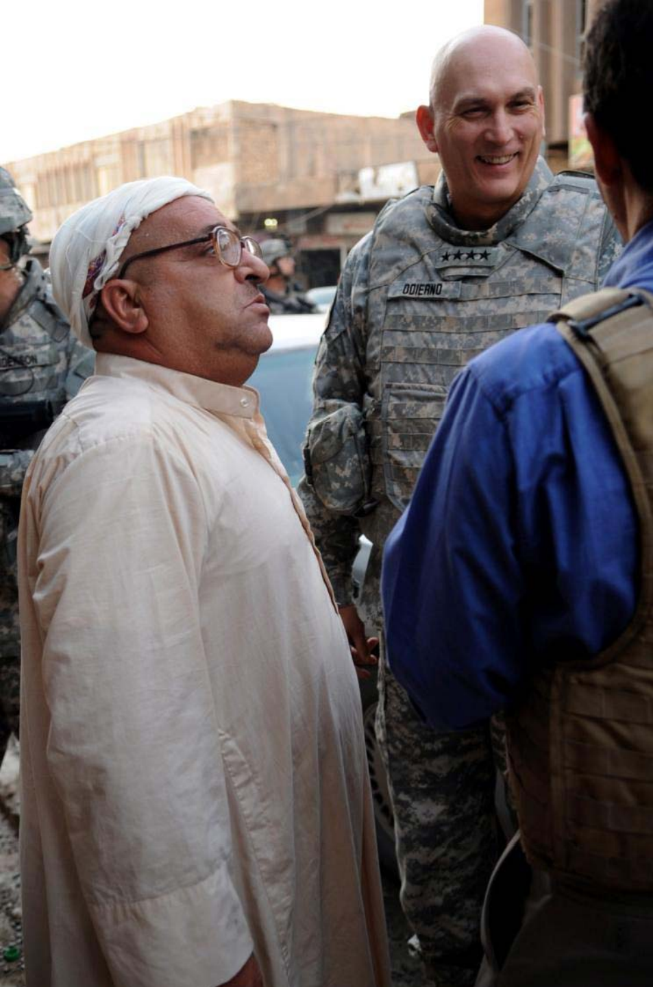
Gen. Ray Odierno, Commanding General, Multi-National Forces-Iraq, visits the city of Samarra, Iraq, to discuss the conditions of the town with the local citizens, on Oct. 29, 2008.

081029-A-5049R-087