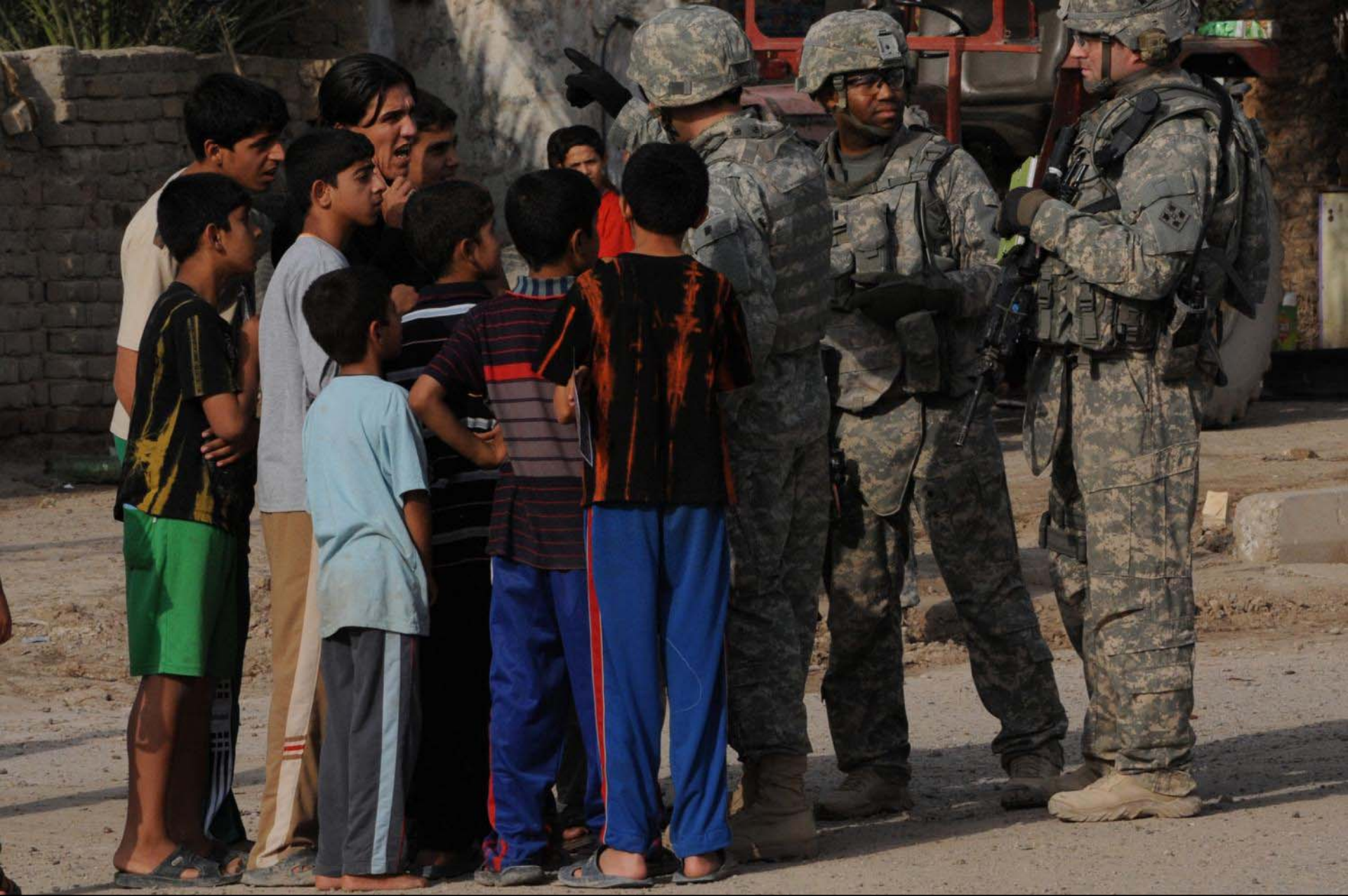
U.S. Soldiers of 1st Battalion, 66th Armored Regiment, 4th Brigade Combat Team, 10th Mountain Division, pass out fugitive information handbills to local children while participating in Operation Iron H1018, in Muhallah 741, Al Amin, eastern Baghdad, on Oct. 28, 2008.

081024-A-4676S-057