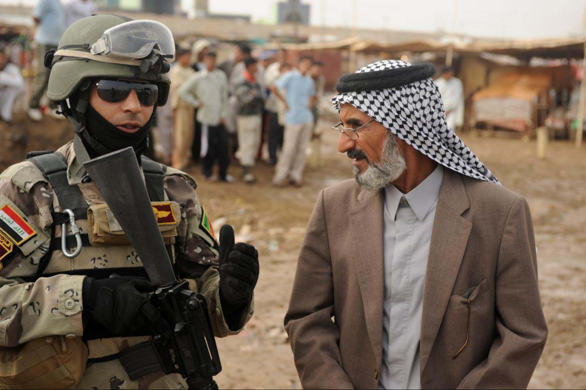
A soldier from the 8th Iraqi Army speaks with a local leader during a patrol of Hamza, Iraq, Oct. 29, 2008. The Iraqi Army patrols to ensure security and provide humanitarian relief to the areas that need it.