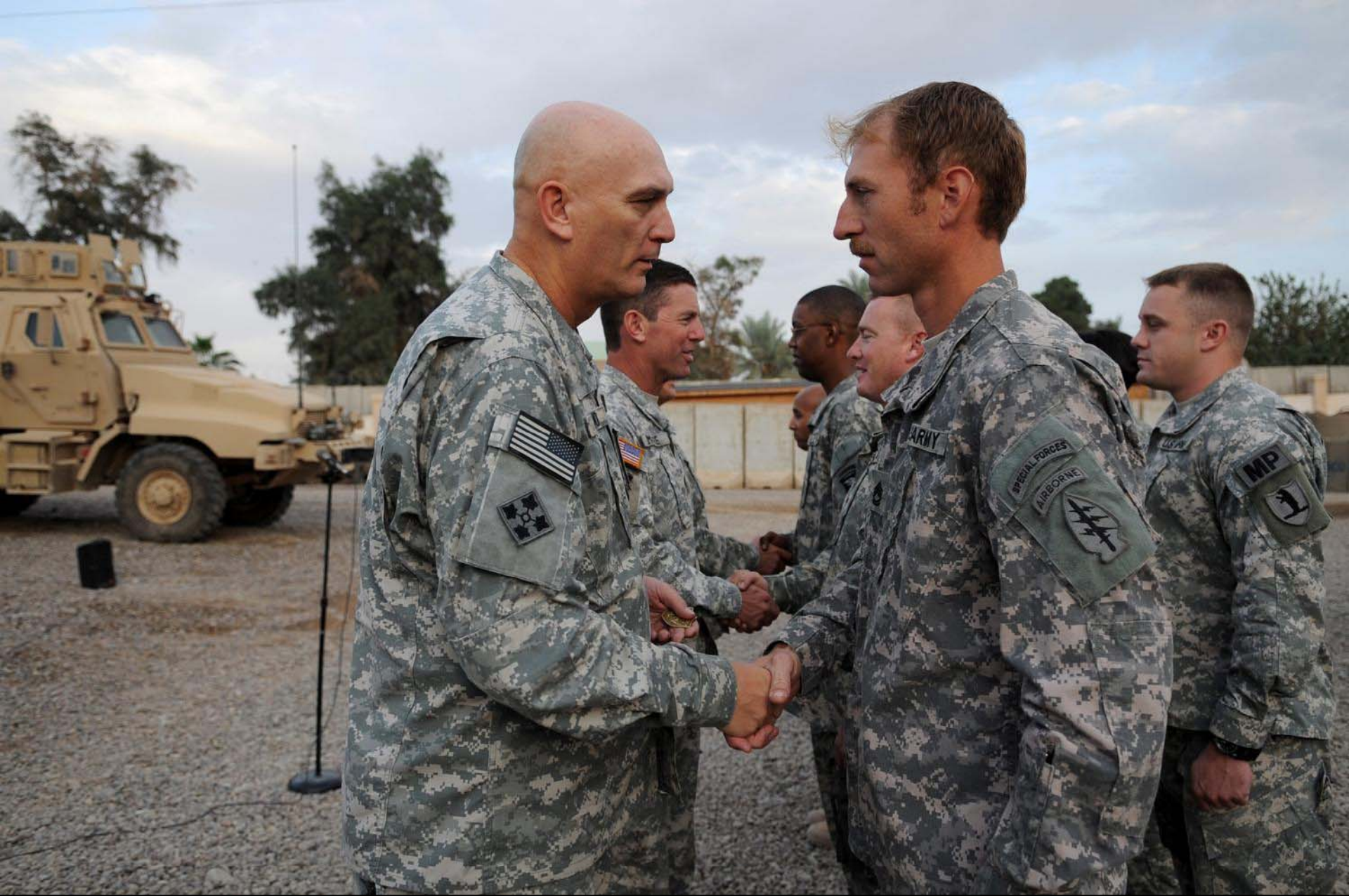
Gen. Ray Odierno, Commanding General, Multi-National Forces-Iraq, visits U.S. Soldiers from 2-327 Infantry Battalion, 1st Brigade Combat Team, 101st Airborne Division, for a ceremony at Patrol Base Olsen, Iraq, on Oct. 29, 2008.