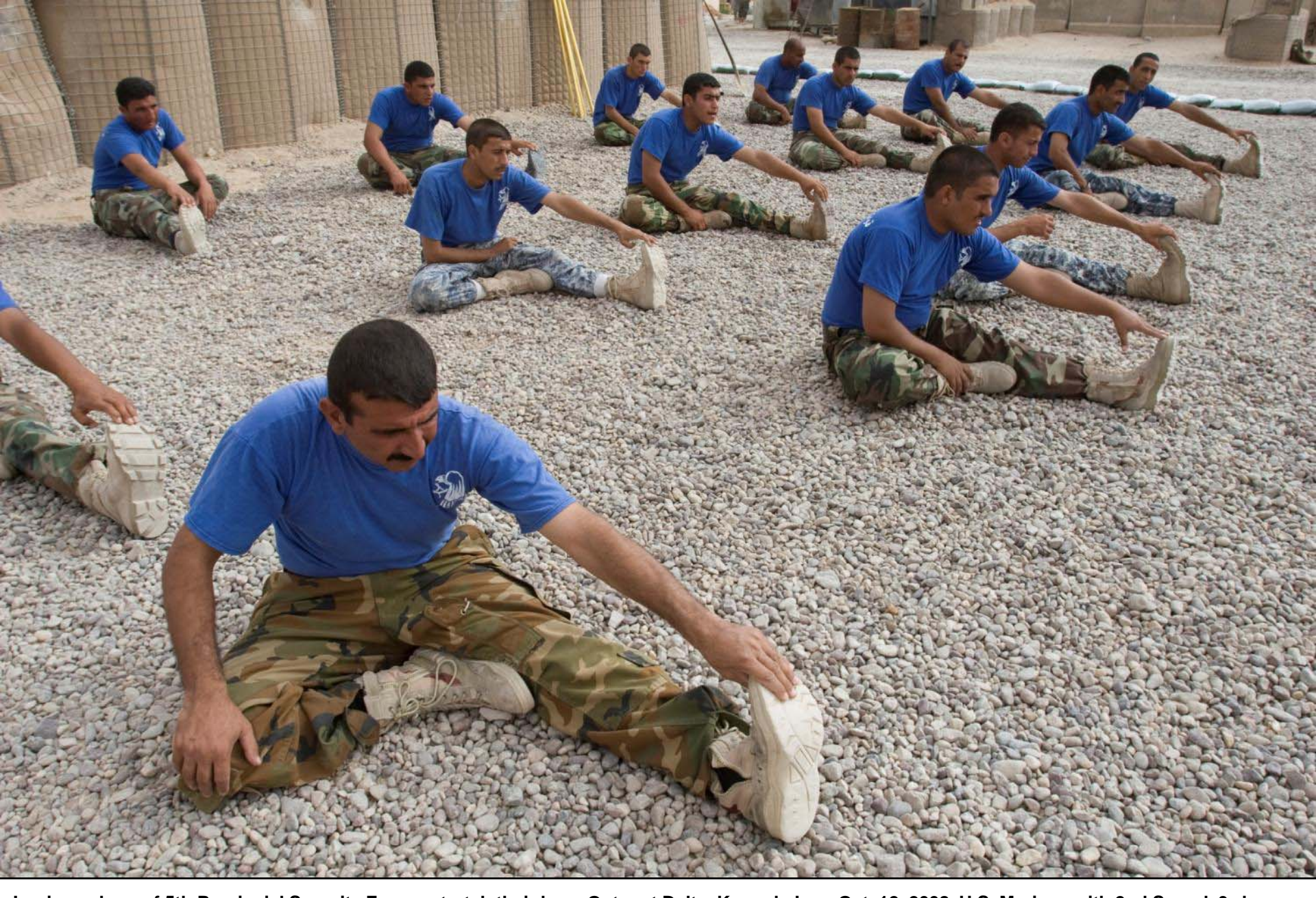
Iraqi members of 5th Provincial Security Forces stretch their legs, Outpost Delta, Karmah, Iraq, Oct. 12, 2008. U.S. Marines with 2nd Squad, 3rd Platoon, Charlie Company, 1st Battalion, 3rd Marine Regiment, Regimental Combat Team 1 (not shown), were present to train local members of 5th PSF in components of the Marine Corps Martial Arts Program and physical fitness.

081012-M-5041C-034