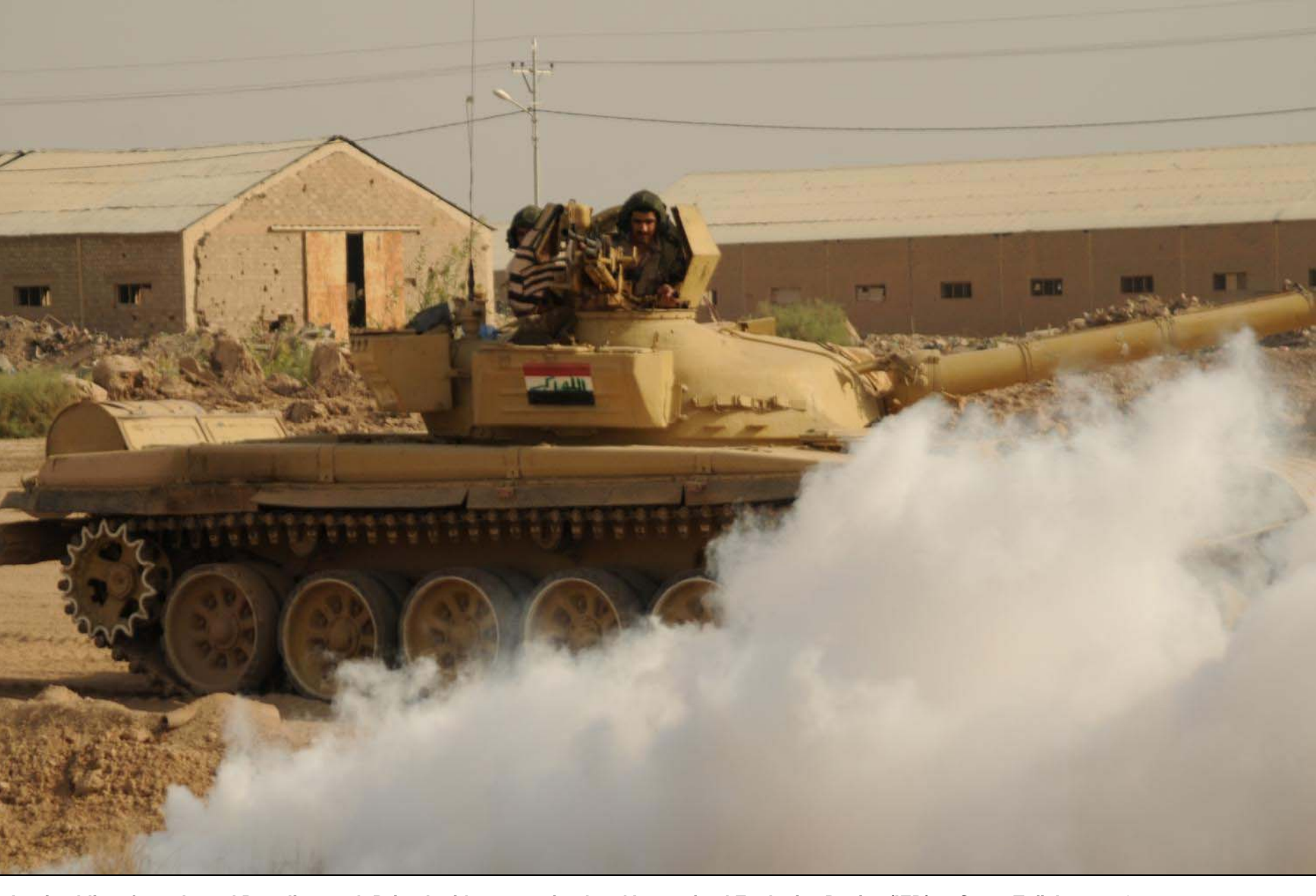
Iraqi soldiers from the 3rd Battalion, 36th Brigade ride past a simulated Improvised Explosive Device (IED) at Camp Taji, Iraq on Oct. 11, 2008.