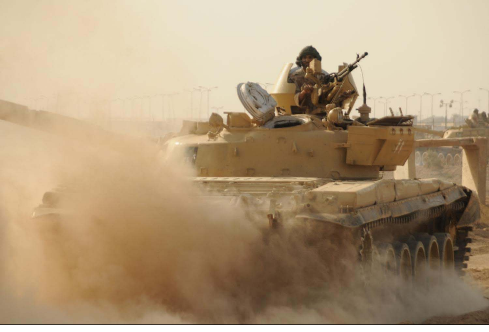
An Iraqi tanker from the 3rd Battalion, 36th Brigade clears an obstacle during a simulated Improvised Explosive Device (IED) explosion at Camp Taji, Iraq on Oct. 11, 2008.