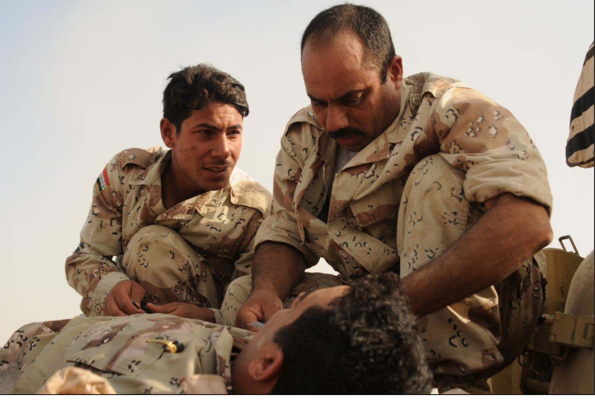
Iraqi soldiers from the 3rd Battalion, 36th Brigade read their scenario card during a simulated Improvised Explosive Device (IED) at Camp Taji, Iraq on Oct. 11, 2008.