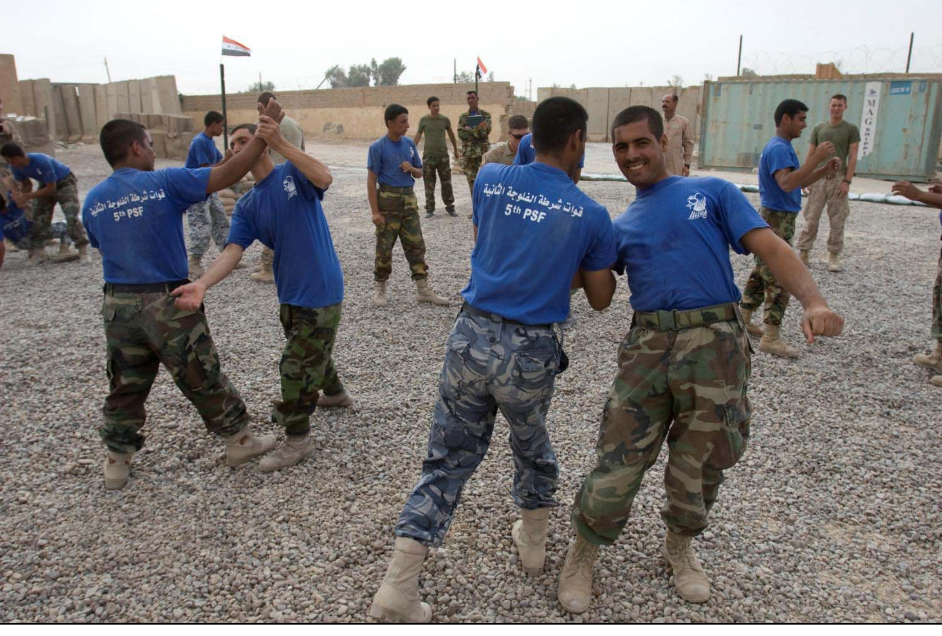
Iraqi members of 5th Provincial Security Forces perform arm locks during martial arts training, Outpost Delta, Karmah, Iraq, Oct. 12, 2008. U.S. Marines with 2nd Squad, 3rd Platoon, Charlie Company, 1st Battalion, 3rd Marine Regiment, Regimental Combat Team 1, were present to train local members of 5th PSF in components of the Marine Corps Martial Arts Program and physical fitness.

081012-M-5041C-090