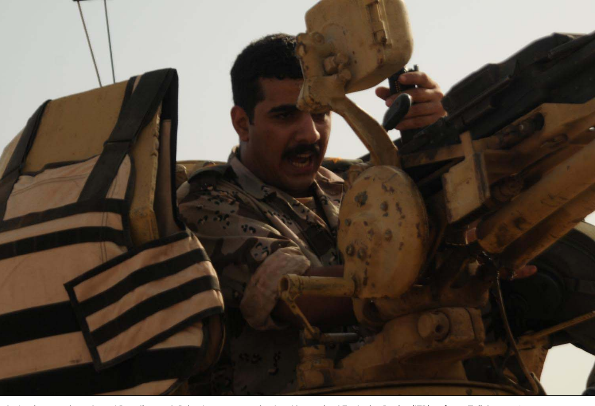
An Iraqi gunner from the 3rd Battalion, 36th Brigade reacts to a simulated Improvised Explosive Device (IED) at Camp Taji, Iraq on Oct. 11, 2008.