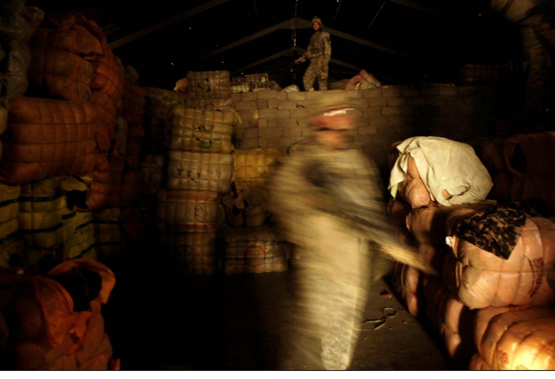
U.S. and Iraqi Soldiers search a warehouse for a weapons cache in Muhallla 454 of Shula, Iraq on Oct. 12, 2008. The U.S. Soldiers are members of 3rd Platoon, Bravo Company, 1st Battalion, 502nd Infantry Regiment, 101st Airborne Division and the Iraqi soldiers are members of Alpha Company, 2nd Battalion, 22nd Iraqi Army Division.

081012-F-0856M-412