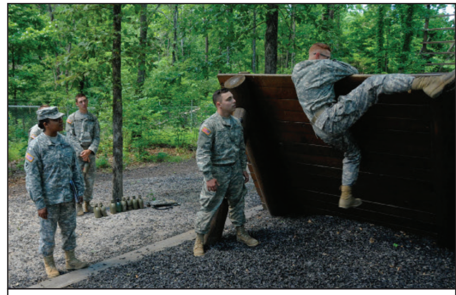
Members of the US Army Cadet Corps navigate and observe the obstacle course during part of the physical phase of the U.S. Army Cadet Summer Training held at Fort Knox.

This is an excerpt from the Cadet Creed memorized by future leaders of the United States Army during Cadet summer training at Fort Knox. From 21 to 29 June a handful of Commissioned and Non-Commissioned Officers from the 81st Regional Support Command had the opportunity to contribute to the Military's largest training exercise, U.S. Army Cadet Summer Training, as part of their Annual Training, LDAC is the U.S. Army Cadet Command's capstone training event. Not only did they get the chance to sharpen their own skills for their respective military tasks, Wildcats were able to play a