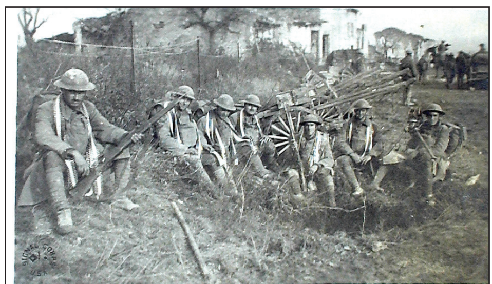
1276-D8 318世 M.G. Bn. Awaiting orders near Haudiomont NOV. 10世18

While final preparations were underway, 81st Division patrols on 8-9 November