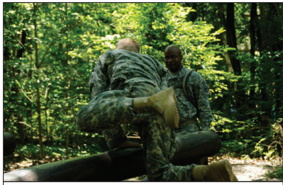
A Cadet participant navigates the obstacle course as an observer looks on, during the physical portion of the U.S. Army Cadet Summer Training held at Fort Knox.

In 2017, Senior Army ROTC has a total of 275 programs located at colleges and universities in all 50 states, the District of Columbia, and Puerto Rico with an enrollment of over 33,000 Cadets. According to U.S. Army