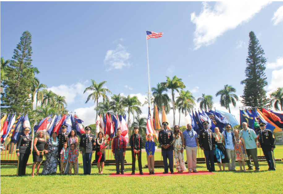
The 8th Theater Sustainment Command honors four sustainers during its Celebration of Service retirement ceremony, Feb. 9, at Fort Shafter’s historic Palm Circle.