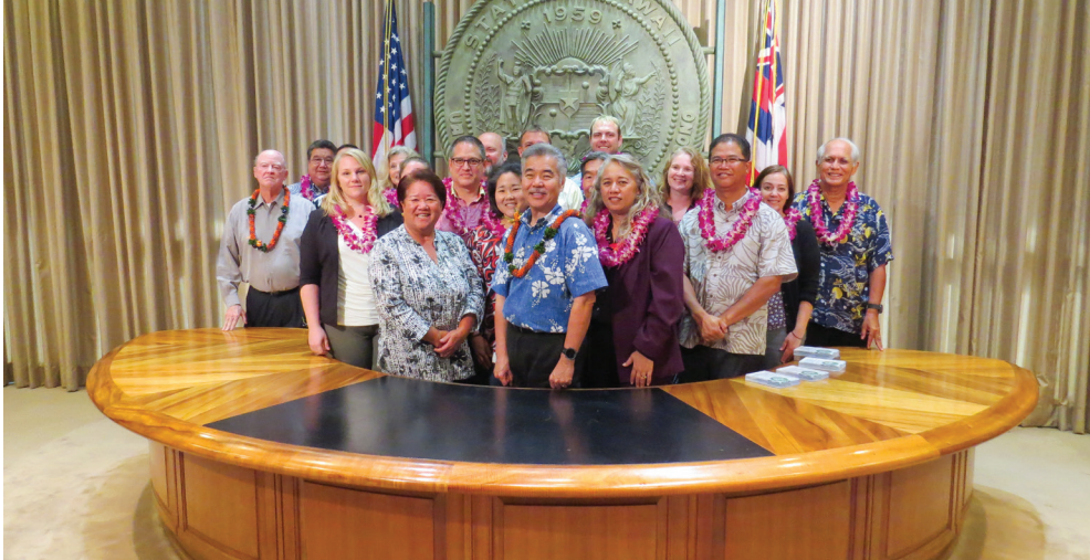
Distinguished personnel and guests, including Gov. David Ige (center in blue), pose for a remembrance photo.

“Conservation in Hawaii and invasive species control are synonymous. In order to do conservation here, you can’t just man-