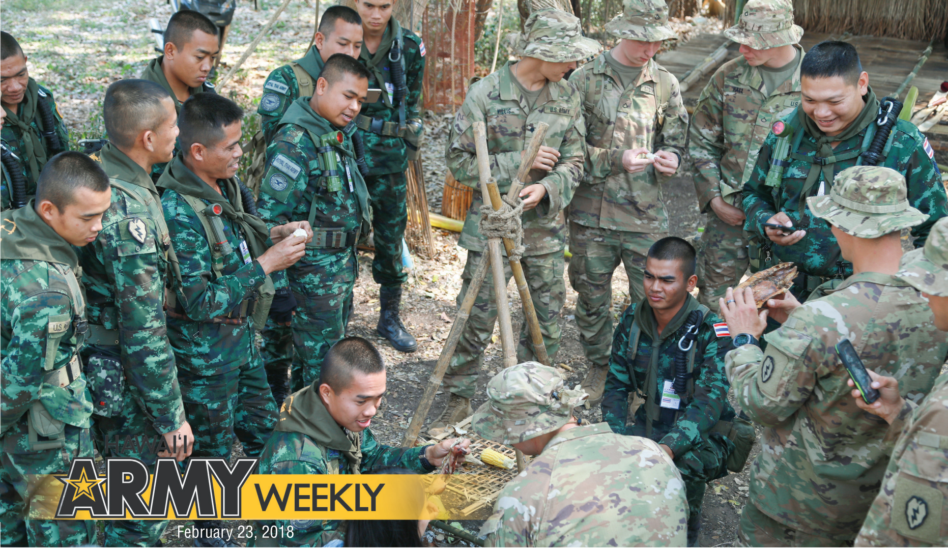
Royal Thai Army soldiers share a variety of food with U.S. Soldiers from Delta Co., 1st Bn. 21st Inf. Regt., 2nd IBCT, 25th ID, during jungle training, Feb. 12, at Camp Friendship in Korat, Kingdom of Thailand.