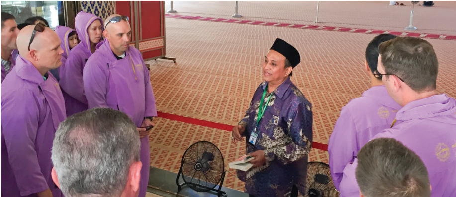
Members of the RLDP-P tour the Masjid Negara National Mosque in Kuala Lumpur, Malaysia, on Sept. 30, 2017.

at the very core of talent development. RLDP-P has partnered with the Pentagon’s Office of Economic Manpower Analysis and the Army G1 Talent Management Task Force to assess its students and provide them with professional feedback that will enhance their military careers.