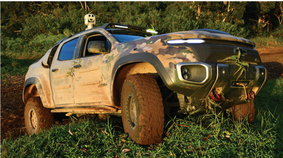
A ZH2 fuel cell vehicle takes the spotlight on display.

SCHOFIELD BARRACKS — Soldiers from the 25th Infantry Division put the Army’s ZH2 fuel-cell electric vehicle through the rigors of operating in jungle terrain during a training exercise, here, in late January. Soldiers evaluated the Chevrolet Colorado ZH2’s operational effectiveness during multiple reconnaissance missions as a notional friendly “blue” force (BLUFOR) and “opposition” force (OPFOR) vehicle asset. They provided feedback on its fuel-cell technology and the capabilities it offers. The U.S. Army Tank Automotive Research, Development and Engineering Center (TARDEC) leveraged General Motors’ fuel-cell and off-road vehicle technology investments and commercial off-the-shelf products to develop the ZH2 demonstrator. TARDEC has been collecting data and Soldier feedback on the ZH2’s capabilities for more than a year as part of the Army’s