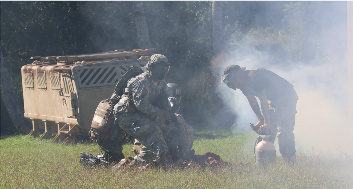
U.S. Soldiers and a JGSDF officer provide tactical care under the cover of smoke during a training exercise at Schofield Barracks, Feb. 12.