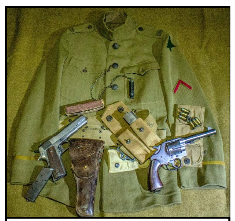
Left: Model 1911 Auto Right: M1917 .45 Service Revolver

Not all pistols carried by First Army Soldiers were Model 1911 pistols, however. For the same reason it looked for additional resources for its rifles, the Army sought current production solutions to help fill its need for pistols. The Army turned to Colt and Smith & Wesson for an interim solution. The two companies adapted their current heavy-frame civilian revolvers to the standard .45 ACP pistol cartridge used by M1911. Both companies' revolvers utilized half-moon clips to extract the rimless .45 ACP cartridges from the pistols.<sup>15</sup> This production delivered over 300,000 needed pistols to the hands of First Army and the American Expeditionary Forces.