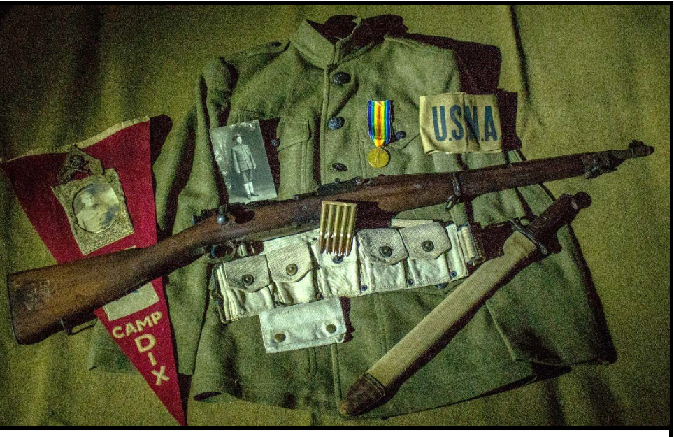
Model 1903 Springfield and bayonet as well as typical issued equipment.

Moreover, only two government-owned factories at Springfield, Massachusetts and Rock Island, Illinois, existed to fill the Army's priority for small arms, although both Arsenals produced the Model 1903 rifles. Army planners correctly judged that production at these arsenals could not be significantly increased, certainly not fast enough to arm the approximate four million men the Army planned to mobilize.<sup>4</sup> Stock on-hand when America entered the war consisted of 843,239 rifles produced by both arsenals since 1903.5 Despite these shortfalls, American Soldiers liked the rifle. In the words of First Lieutenant Samuel Meek the 1903 Springfield "...was a great weapon. Not only was it accurate, but it rarely jammed. Having very few parts, it seemed to be able to absorb the dirt and we were always living in dirt-and still worked."6 Unfortunately, the combined output of the Springfield and Rock Island Arsenals failed to supply the Army's emergent small arms requirements.