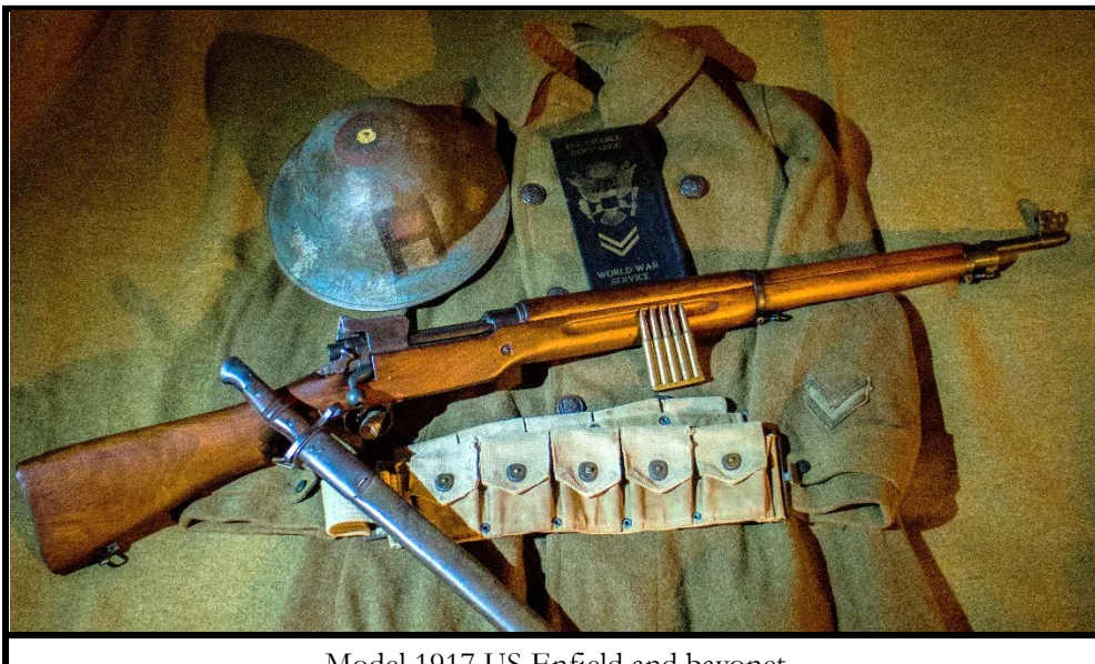
Model 1917 US Enfield and bayonet.

The resulting modification became known as the US Model 1917 or the American Enfield and answered the Army's requirement as the three companies produced almost 2.2 million rifles with production reaching almost 10,000 rifles per day by the end of the war.<sup>7</sup> Compared with the production of the 1903 rifles from Springfield and Rock Island Arsenal, at 422,266 rifles produced during the course of the war, this was the added production needed to arm the doughboys for the war.<sup>8</sup> Most of the National Guard and National Army (Army Reserve) Divisions that served under First Army during WWI carried the M1917 rifle as opposed to the Active Divisions typically carrying the M1903 rifles. The M1917 was truly the unsung rifle of WWI for First Army.