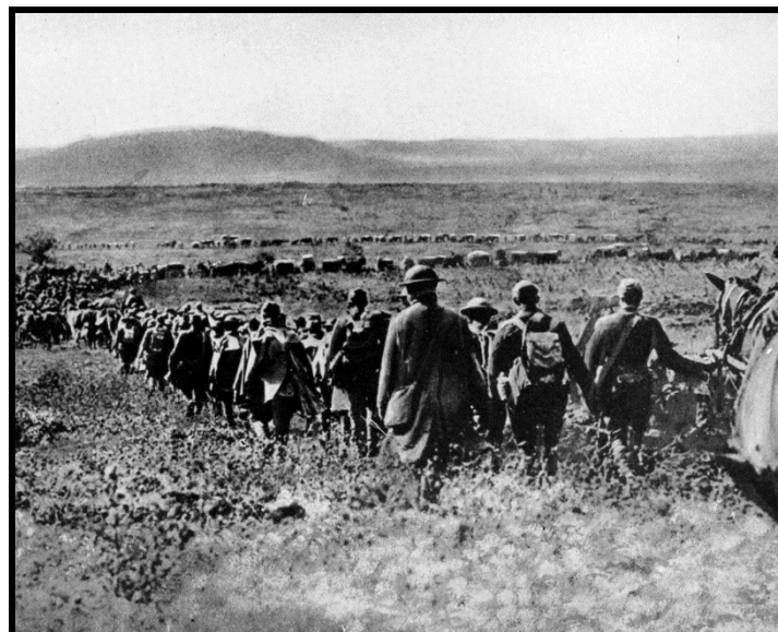
First Army Soldiers marching into the St. Mihiel salient on the morning of September 12, 1918.