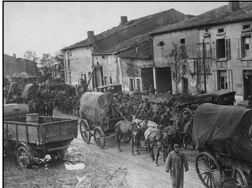
German prisoners that were captured on the first day of the St. Mihiel offensive.

"The St. Mihiel Salient, that needle point on the Western Front for four long years, had been nipped off," wrote American Captain Barnwell Rhett Legge in a 1919 account. "The First Army, but recently come into being, gave to the world tangible evidence of America's power." 8 The battle of St. Mihiel also serves as a teaching tool to modern tactical commanders regarding the necessity to issue clear and concise orders that allow small unit leaders the freedom to carry out their commander's intent during the battle or (mission command).