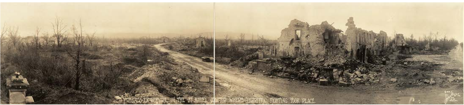
"Fresnes-en-Woevre, in the St. Mihiel sector where terrific fighting took place."

accustomed, as were our Allies, to such huge payments in human life, would have seized upon the criticism of any Allied official as a basis for condemning our own Commander in Chief."