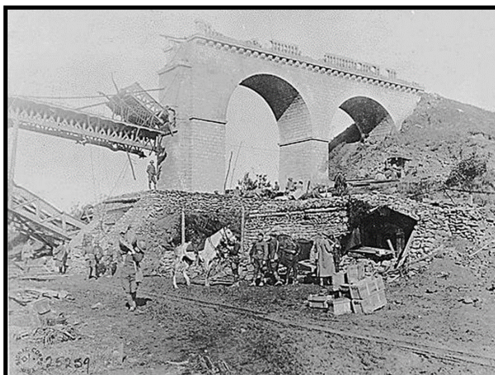
Headquarters of the American 89th Division next to a destroyed bridge at the Battle of St. Mihiel.