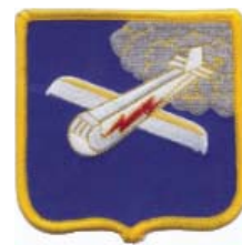
Left: The 17th Airborne Division insignia. • Above: The 194th Glider Infantry Regiment insignia.