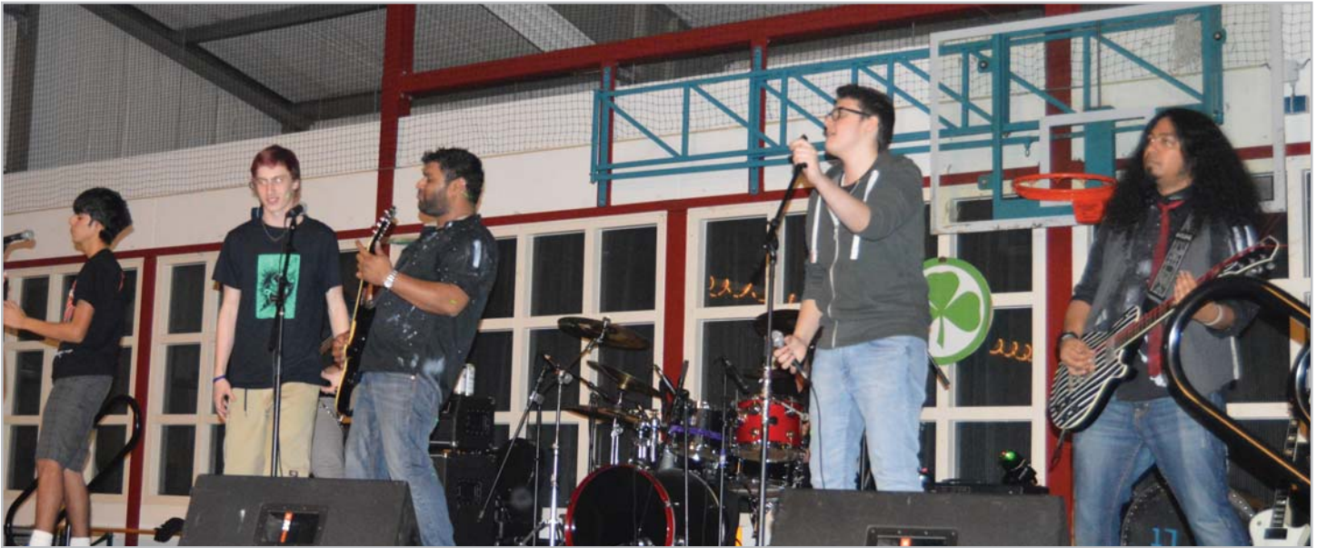
The opening band at the Schinnen's St. Patrick's Day Party, "Strocial," teams up with the headliner, Slant, to put on a dynamic performance Thursday, March 19, 2015. Strocial is a local AFNORTH High School group.